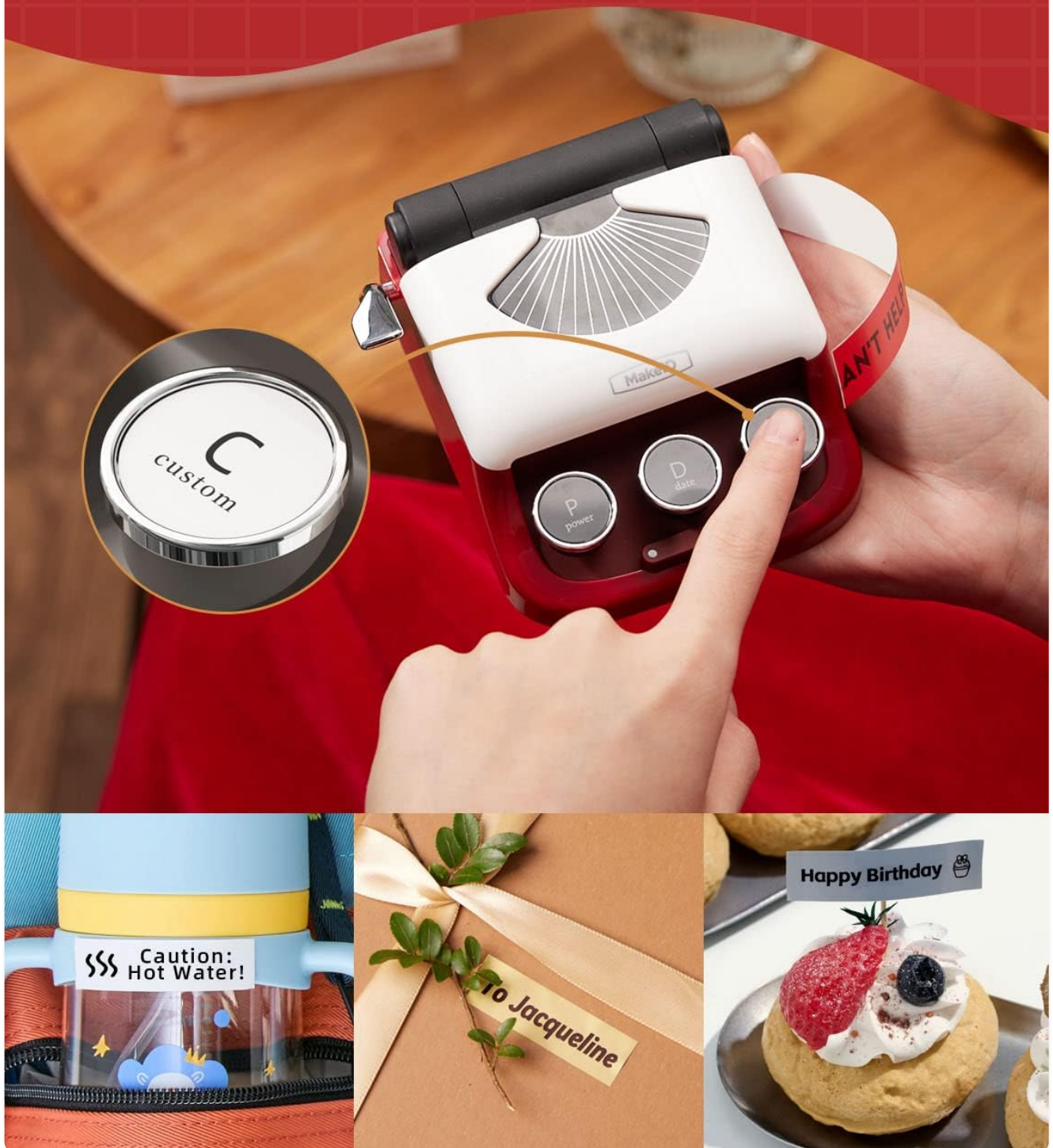
Image: The 'C' (Custom) button on the Makeid Q1, showing how it can be used for personalized labels.