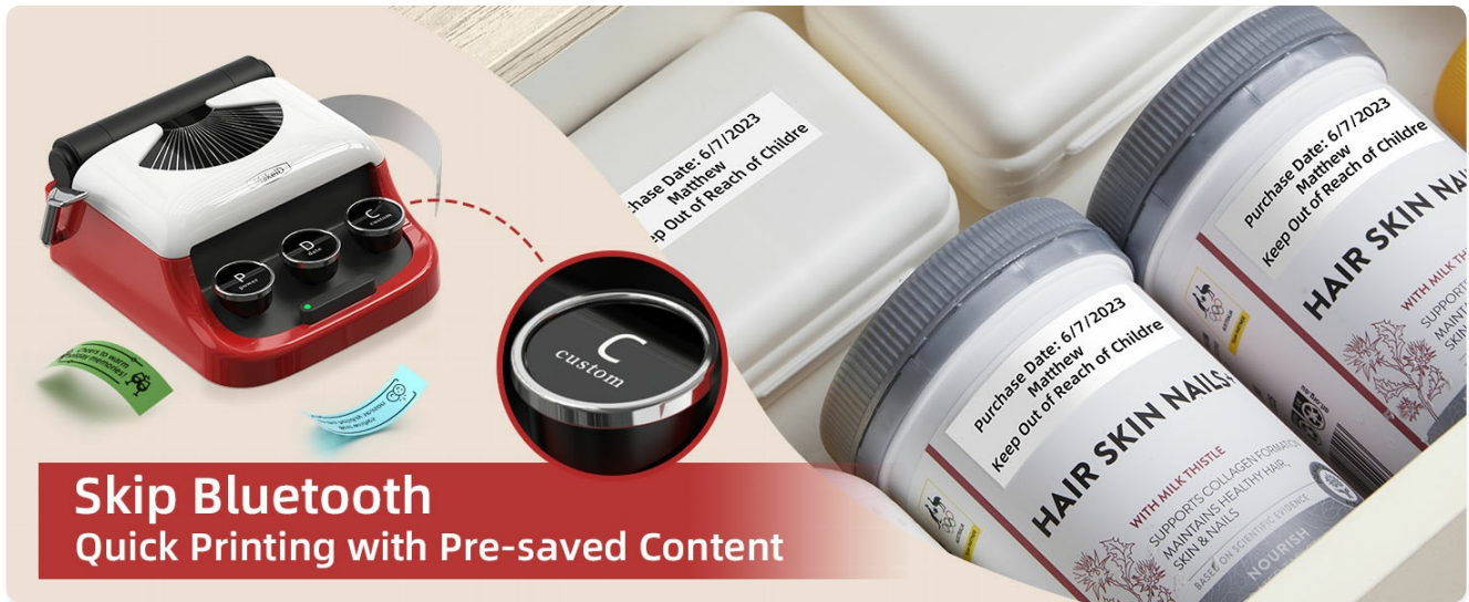
Image: The Makeid Q1 printing a custom label, illustrating the convenience of the pre-saved content feature.