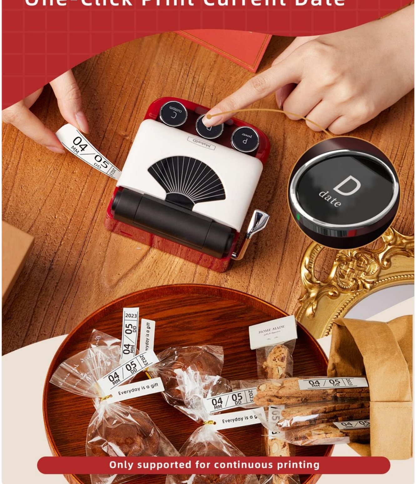
Image: The 'D' (Date) button on the Makeid Q1, demonstrating its use for printing dates on various items.