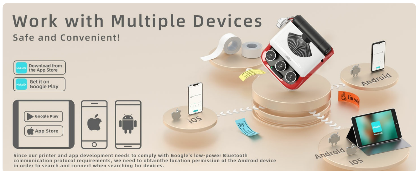
Image: Instructions for downloading the MakeID-Life app from the App Store or Google Play.

The Makeid Q1 operates via a dedicated smartphone application. Search for "MakeID-Life" in your device's app store (available for iOS and Android). Download and install the application.