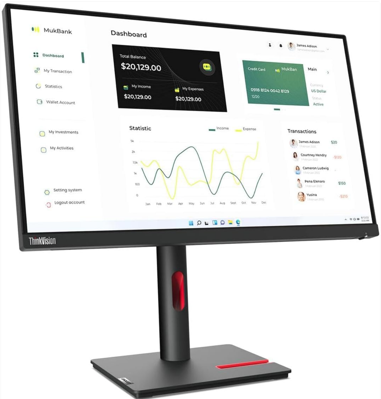
Figure 1: Front view of the Lenovo ThinkVision T23i-30 monitor. This image shows the monitor from the front, displaying a graphical user interface with charts and data, mounted on its stand.