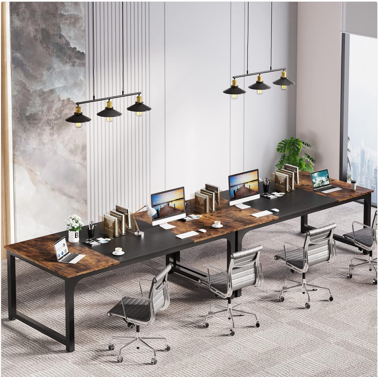
Figure 3: The desk's design allows for multiple units to be combined, creating a large conference or collaborative workspace.