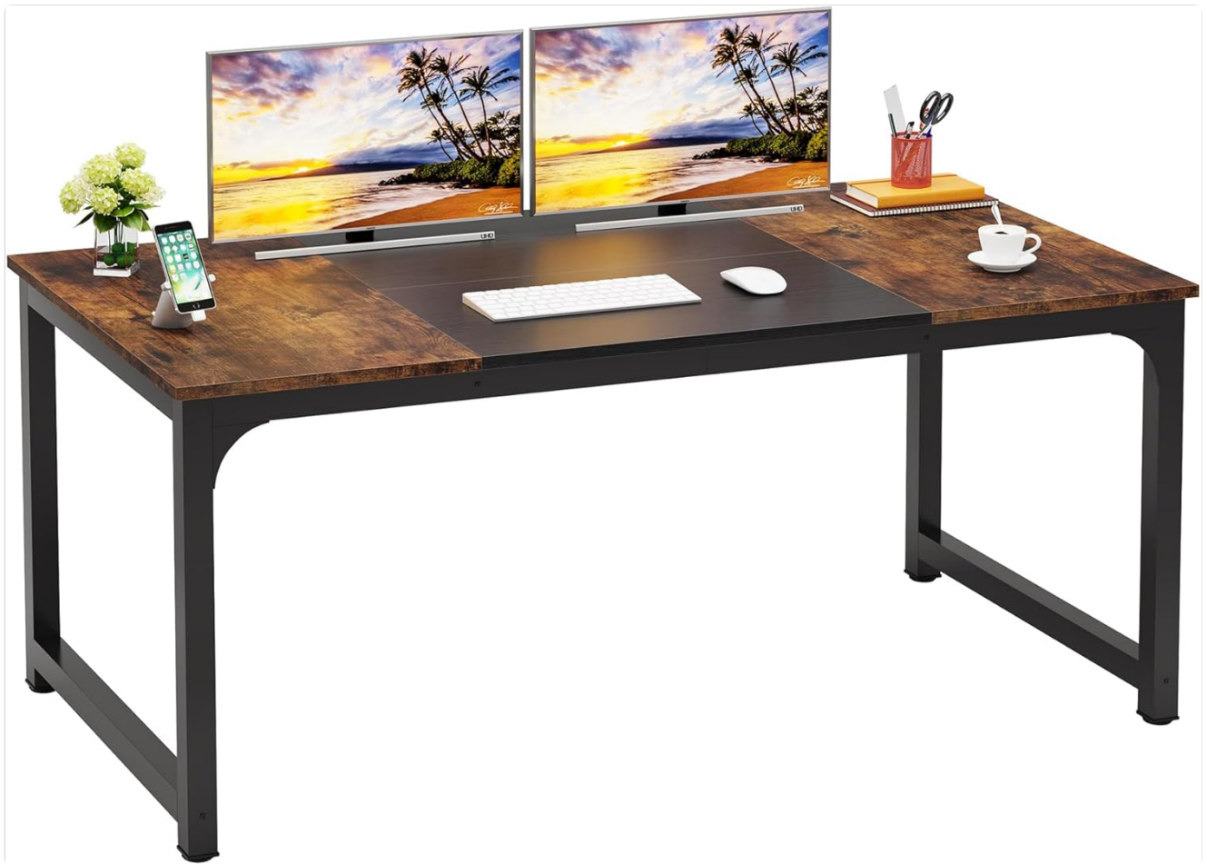
Figure 2: The desk provides ample space for a multi-monitor setup and various office accessories, enhancing productivity.