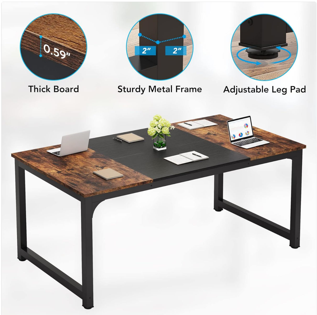
Figure 1: Close-up view of the desk features: 0.59 inch thick board, sturdy metal frame, and adjustable leg pad. These elements contribute to the desk's stability and durability.