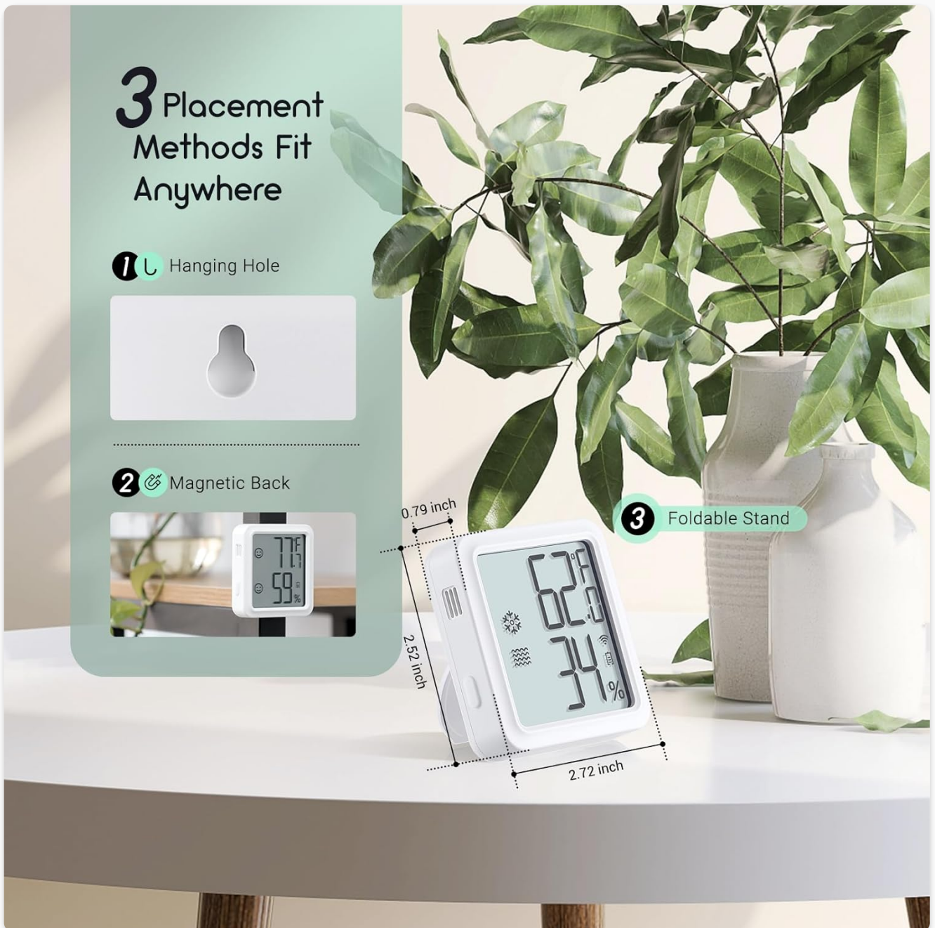
Figure 3: The versatile placement options for the IBS-TH3-PLUS, including a hanging hole, magnetic back, and a foldable stand, allowing it to fit in various locations.