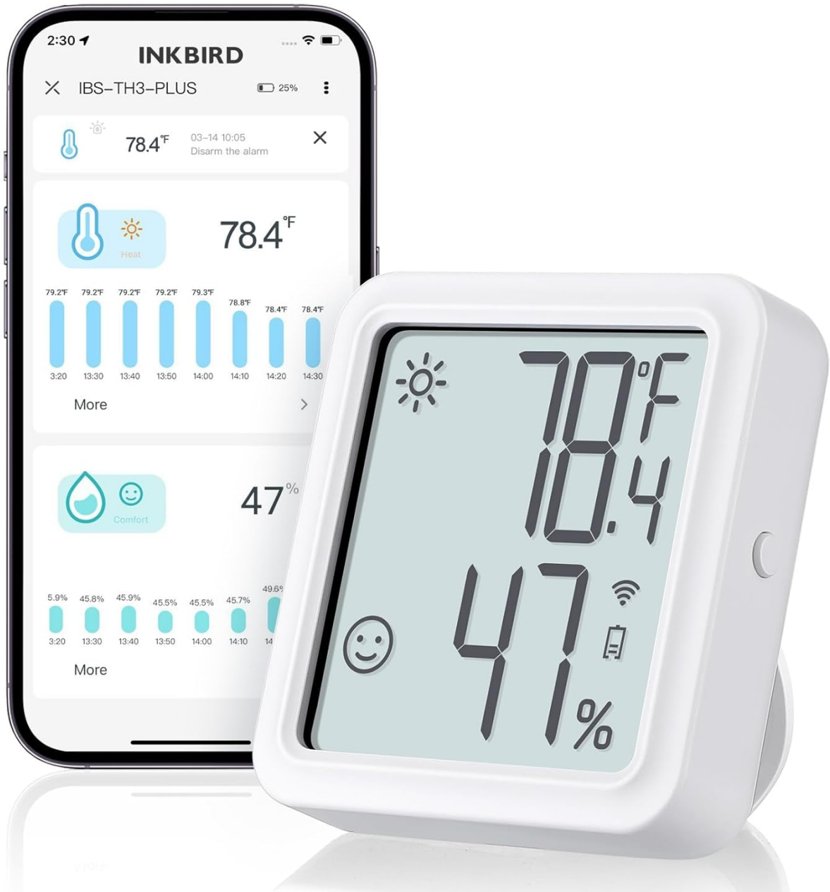
Figure 1: The INKBIRD IBS-TH3-PLUS device shown alongside a smartphone displaying its companion application. The device's screen shows current temperature and humidity, while the app provides detailed historical data and settings.