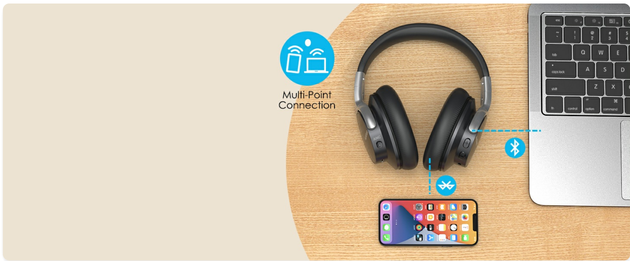
Image: Visual representation of the headphones connected to multiple devices via Bluetooth.