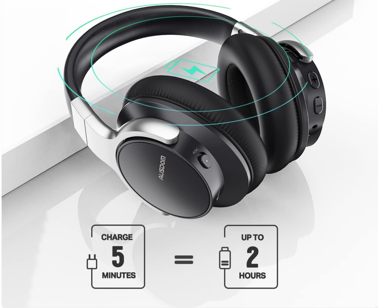
Image: The AUDSOM E7 headphones connected to a USB-C charger, emphasizing the quick charge capability.

5 minutes of charging time offers you 2 hours of playtime.