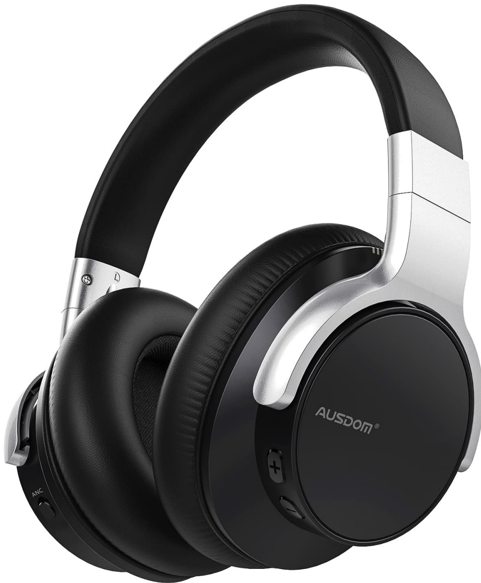
Image: AUDDOM E7 Noise Cancelling Headphones, showcasing their modern black and silver design.