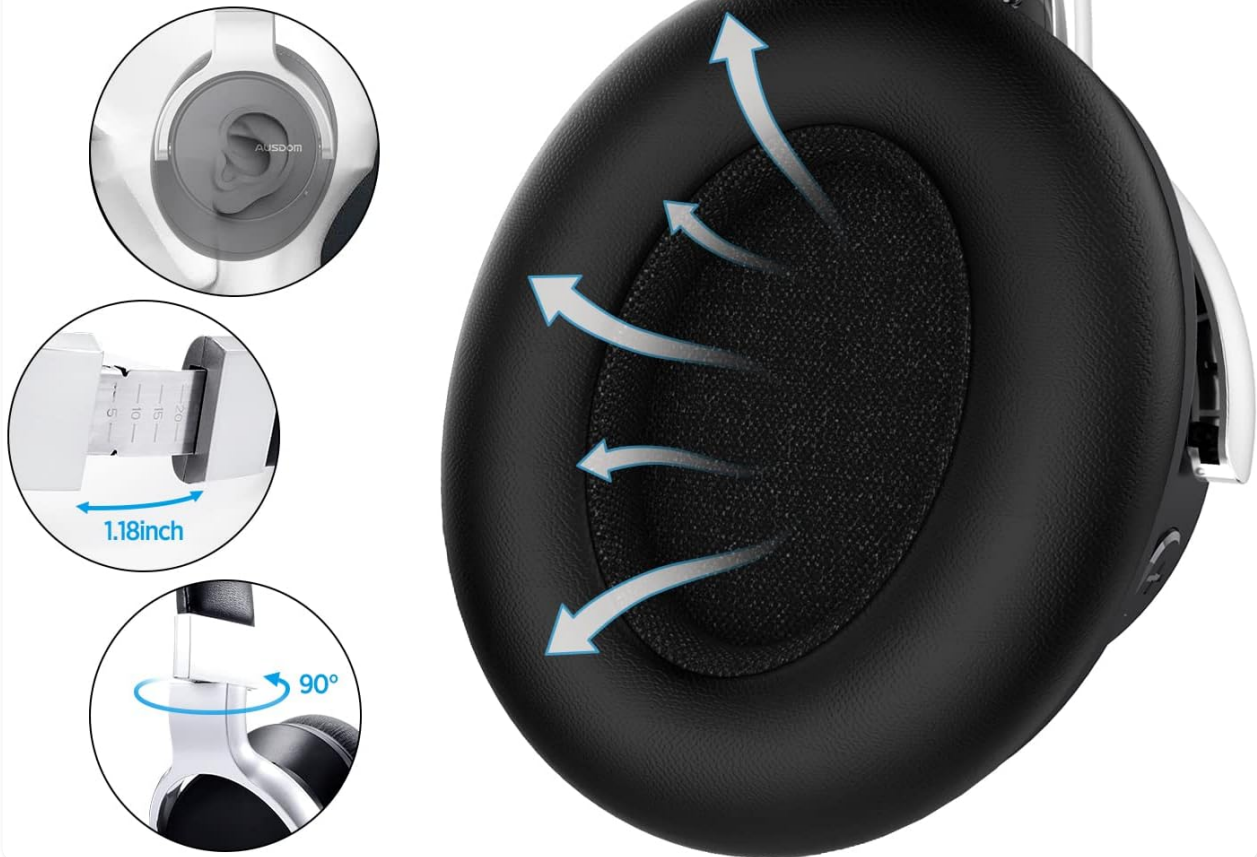
Image: Detailed view of the comfortable over-ear design and adjustable features of the headphones.

Better fit achieves steady awesome comfort and less leak sound.