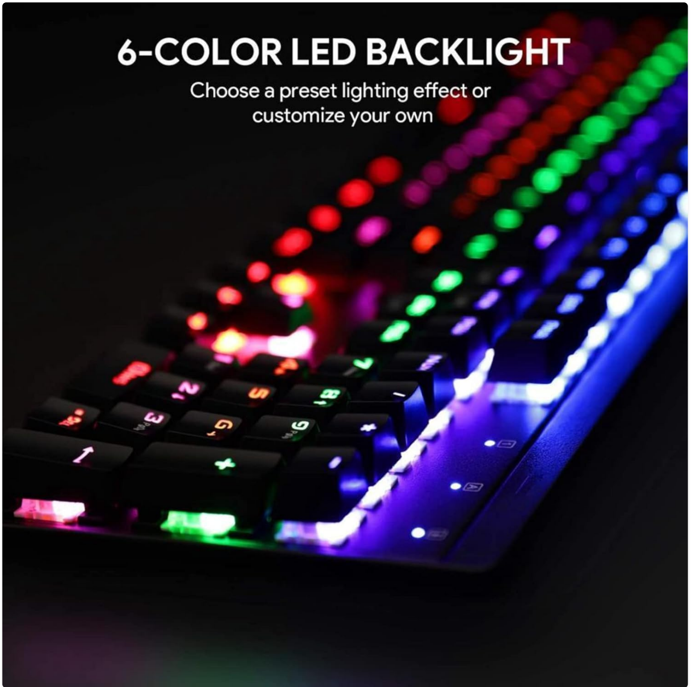
Image: The keyboard illuminated with its 6-color LED backlight, demonstrating different lighting effects.

Choose a preset lighting effect or customize your own