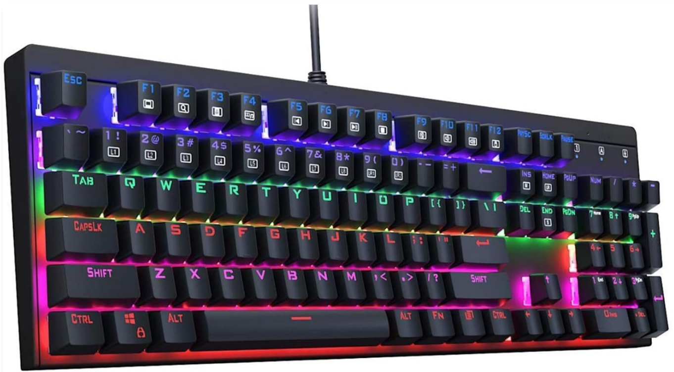
Image: The KM-G6 Mechanical Keyboard showcasing its vibrant 6-color LED backlighting.