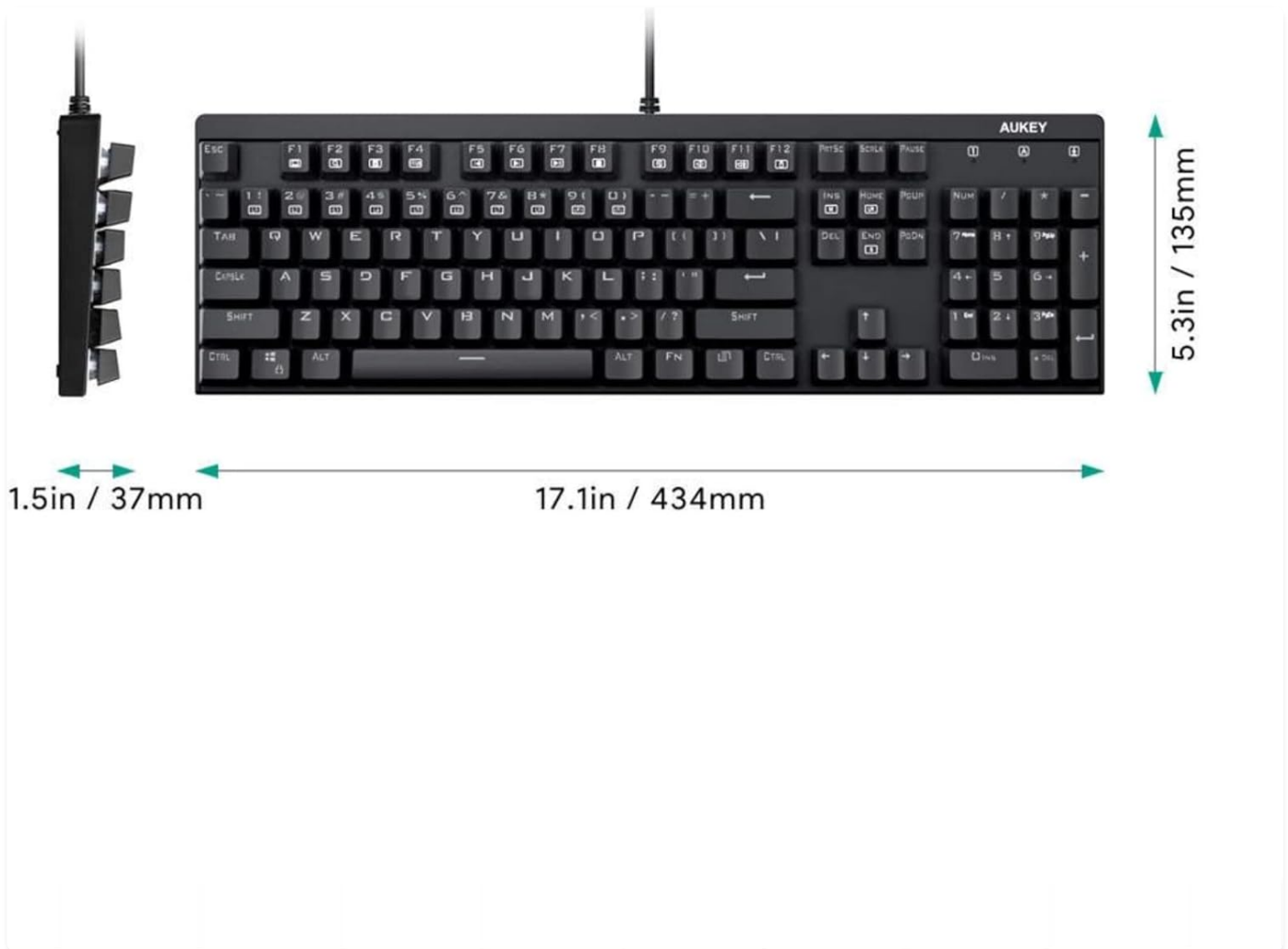
Image: Dimensional overview of the KM-G6 Mechanical Keyboard.