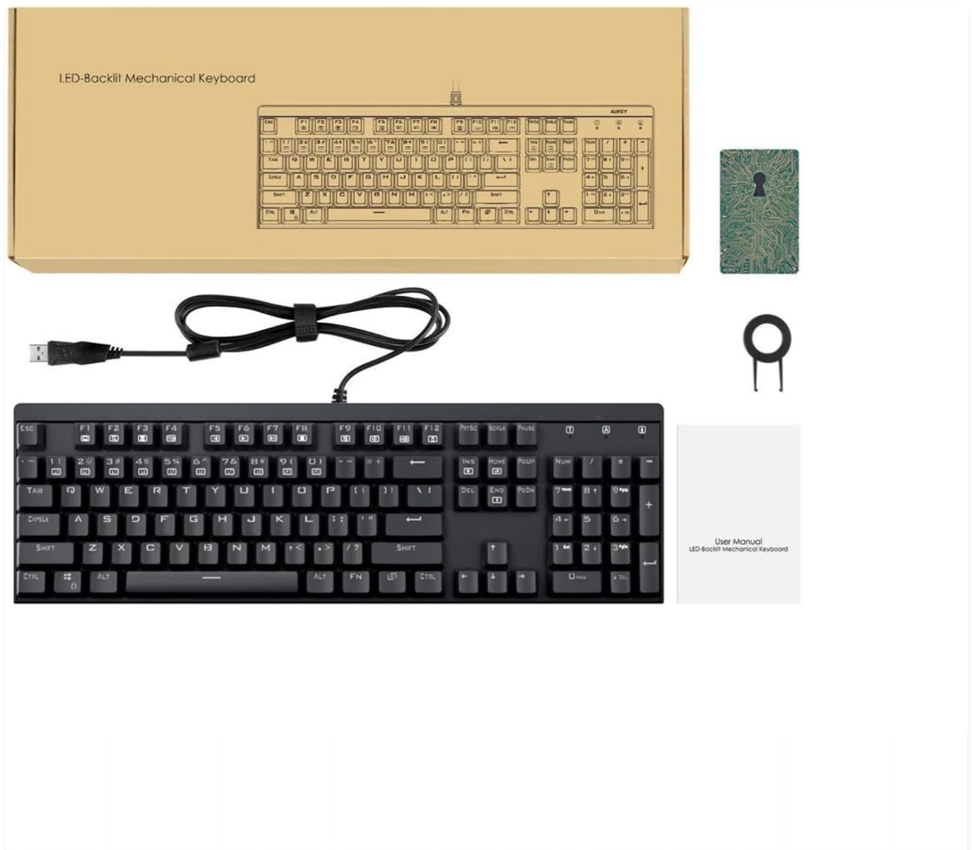
Image: All items included in the KM-G6 Mechanical Keyboard package.