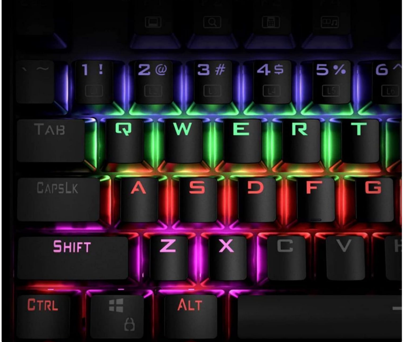
Image: Illustration of the 104-key rollover feature, ensuring every keystroke is registered.