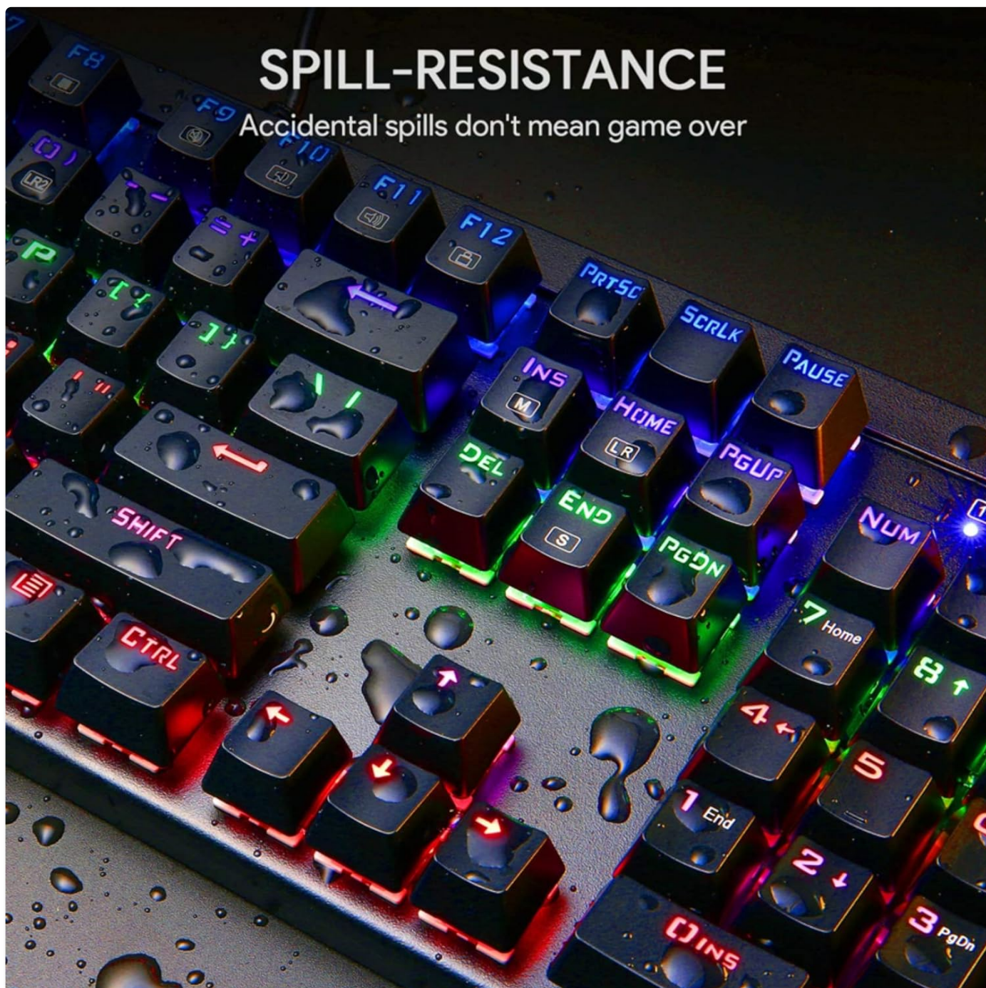
Image: The keyboard demonstrating its spill-resistance, with water droplets on the keys.