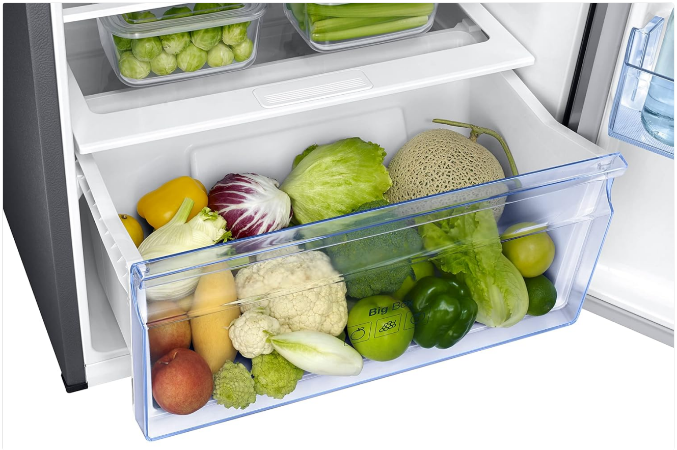
Figure 3.4.1: MoistFresh Zone for optimal humidity control.