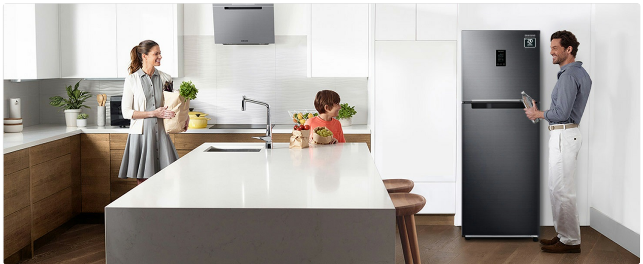
Figure 3.8.5: Tall Bottle Guard.