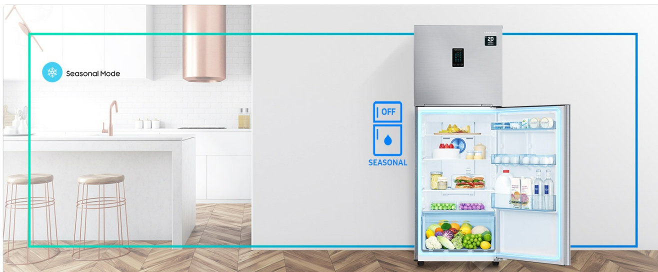
Figure 3.1.1: Control panel for selecting convertible modes.