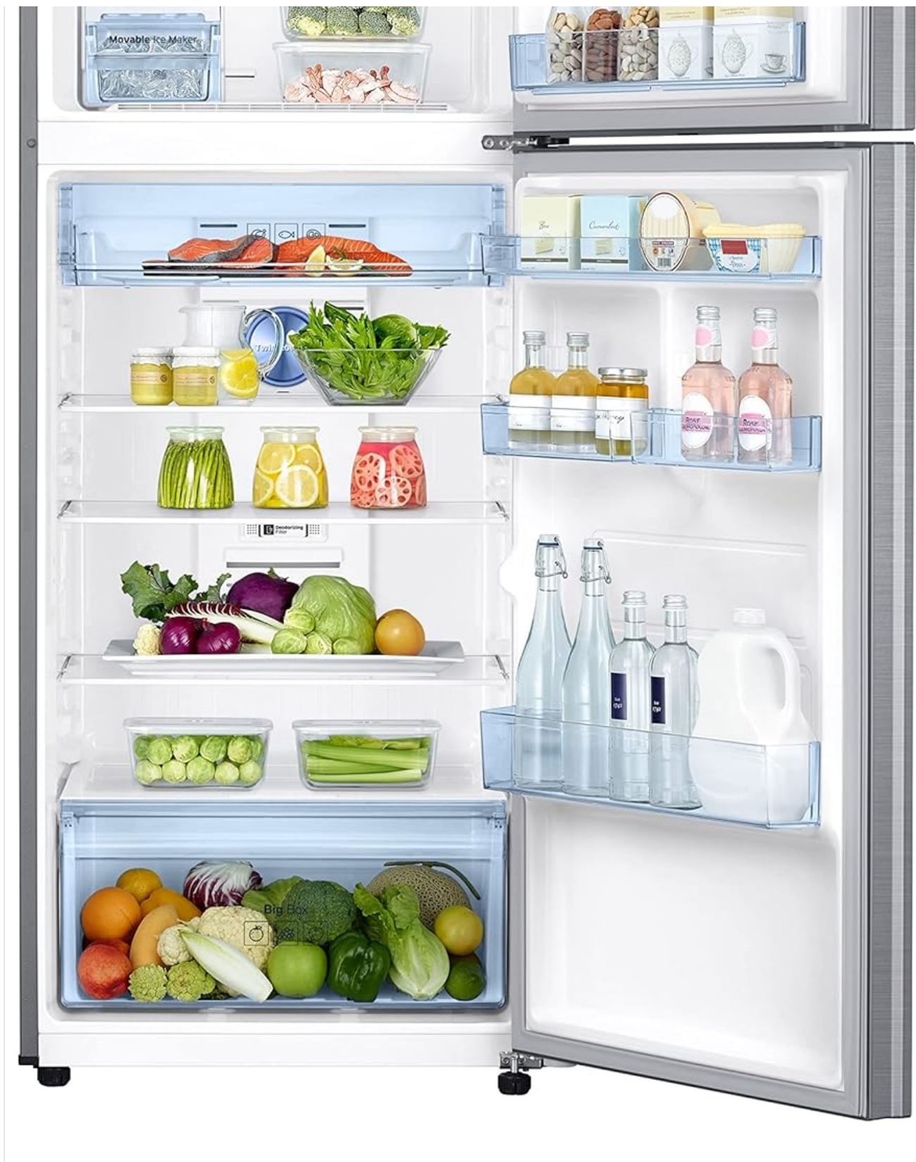
Figure 3.0.1: Interior view of the refrigerator with food items.