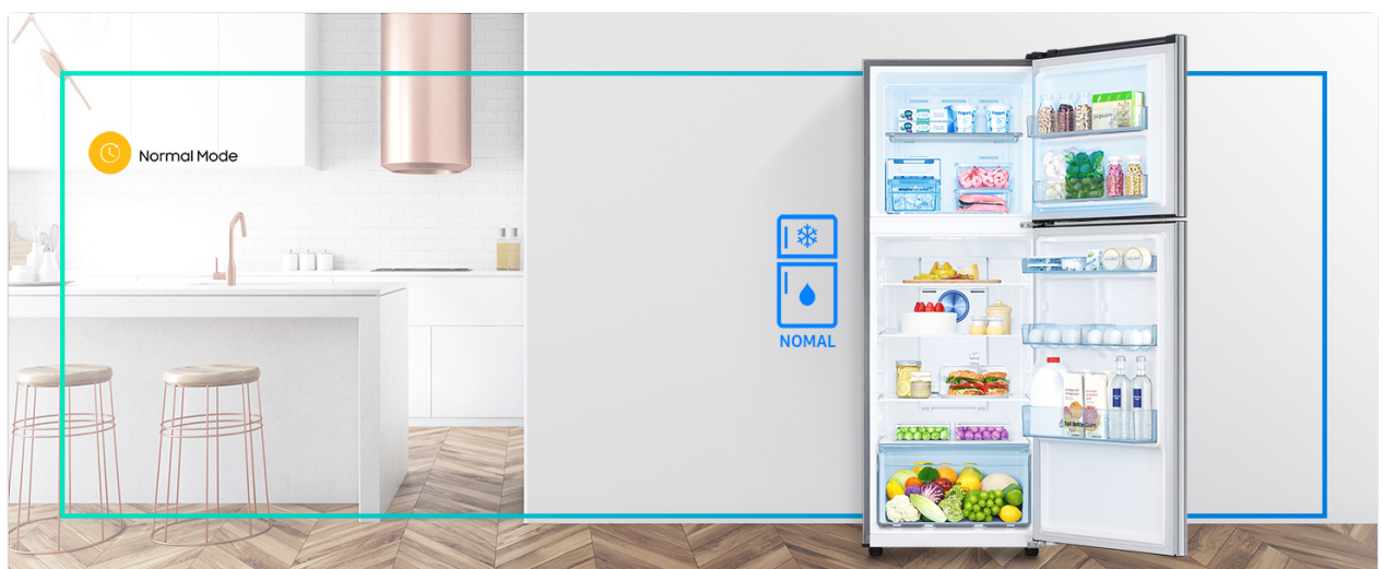
Figure 3.8.6: Fresh Room compartment.