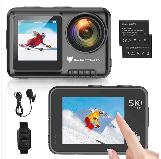
Figure 2.3.1: icefox 5K Action Camera and Included Accessories.

This image displays the icefox 5K Action Camera, two 1350mAh batteries, an external microphone, and the 2.4G wireless remote control. The camera features a front screen and a main touchscreen display on the back, showing a skiing scene.