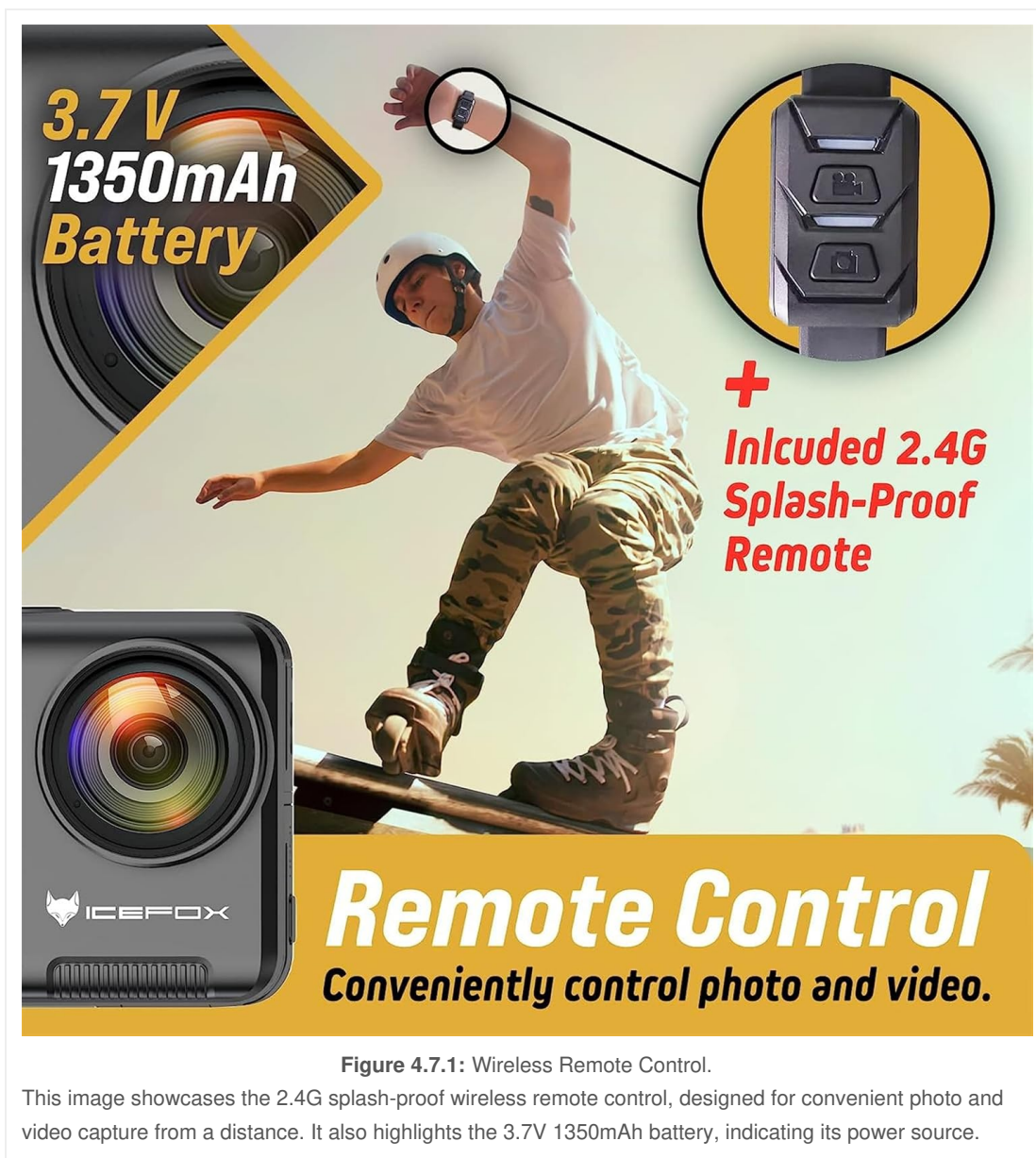
Figure 4.7.1: Wireless Remote Control.

This image showcases the 2.4G splash-proof wireless remote control, designed for convenient photo and video capture from a distance. It also highlights the 3.7V 1350mAh battery, indicating its power source.