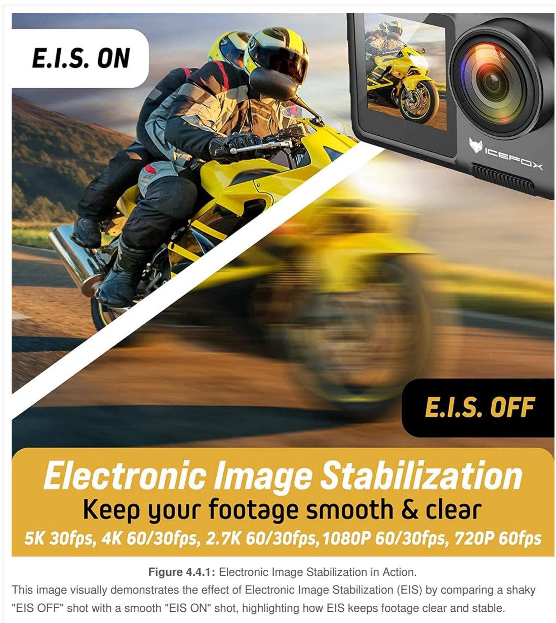
Figure 4.4.1: Electronic Image Stabilization in Action.

This image visually demonstrates the effect of Electronic Image Stabilization (EIS) by comparing a shaky "EIS OFF" shot with a smooth "EIS ON" shot, highlighting how EIS keeps footage clear and stable.