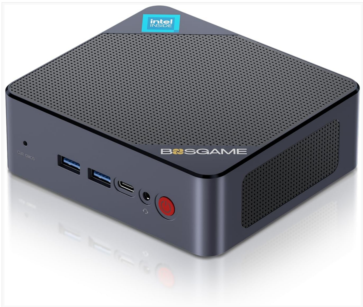
Image: The BOSGAME Mini PC B95 main unit.