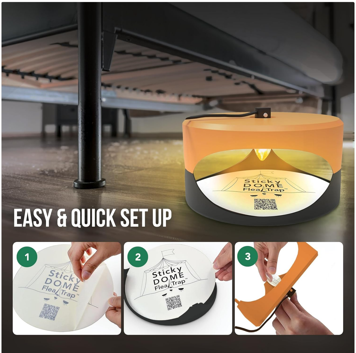
Image: Visual guide for quick and easy setup.