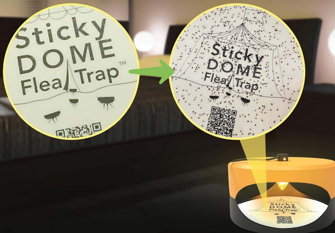
Image: The trap provides 360-degree coverage, effective up to 50 feet.