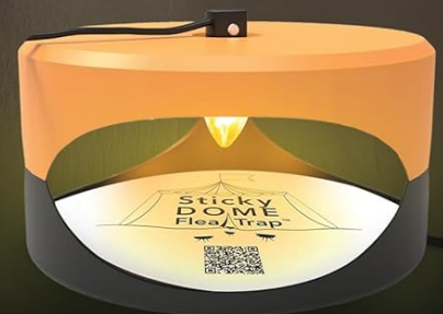
Image: The trap is designed for safe use in homes, including those with children and pets.