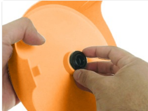
Image: Inserting the light bulb into the trap.