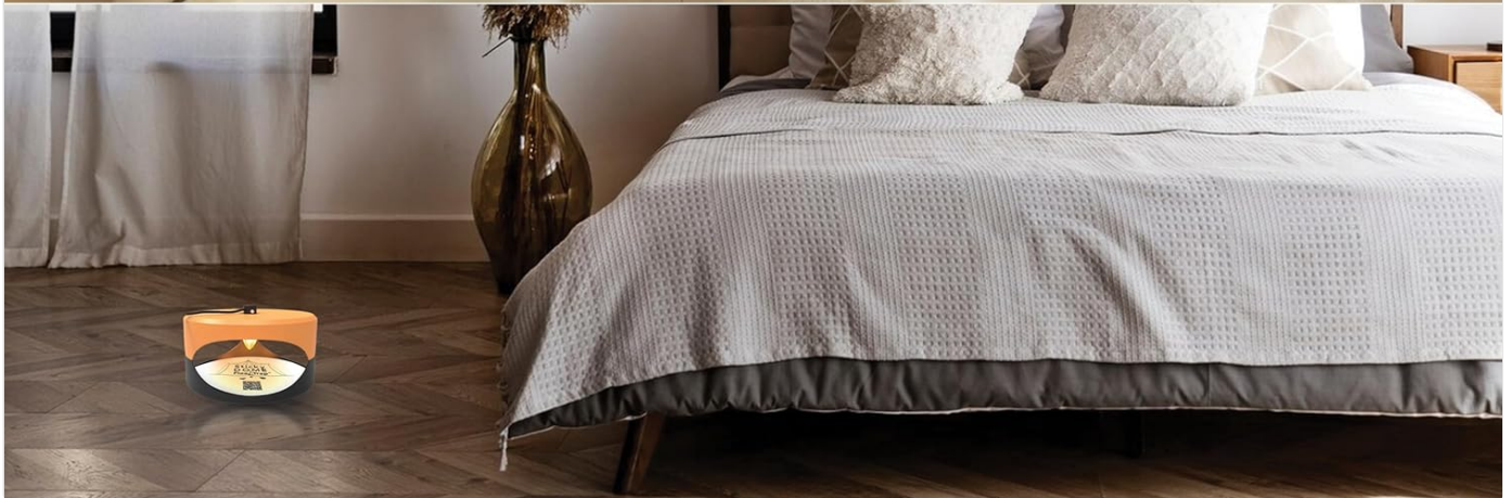
Image: Visible results of flea capture on the sticky disc.