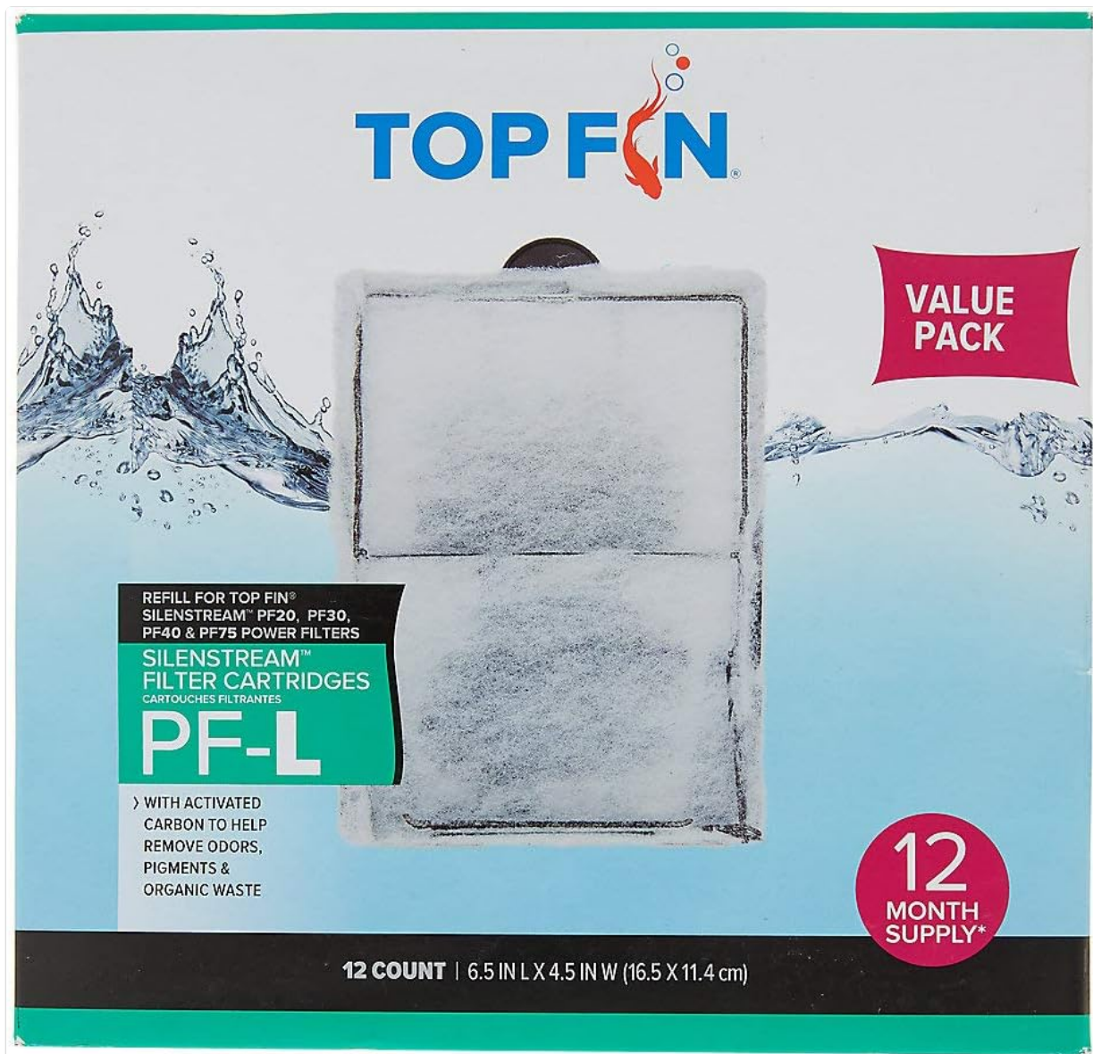
Image: Packaging for Top Fin Silenstream PF-L Filter Cartridges, showing a 12-count value pack. The box highlights compatibility with PF20, PF30, PF40, and PF75 power filters and the inclusion of activated carbon.