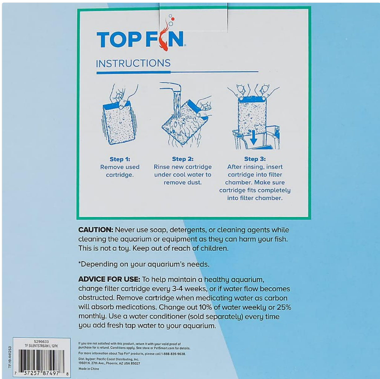
Image: A three-step diagram illustrating the filter cartridge replacement process: 1) removing the old cartridge, 2) rinsing the new cartridge, and 3) inserting the new cartridge into the filter.