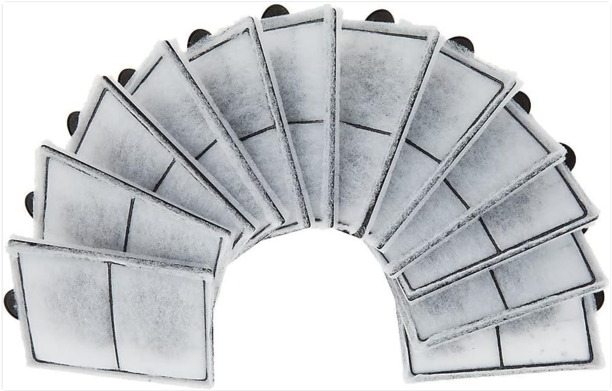
Image: Several Top Fin Silenstream PF-L filter cartridges arranged in a fanned pattern, illustrating the quantity included in a multi-pack.