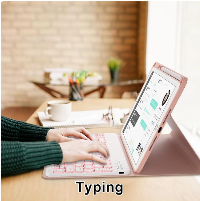
Figure 6: Adjustable Viewing Angle & Detachable Keyboard.