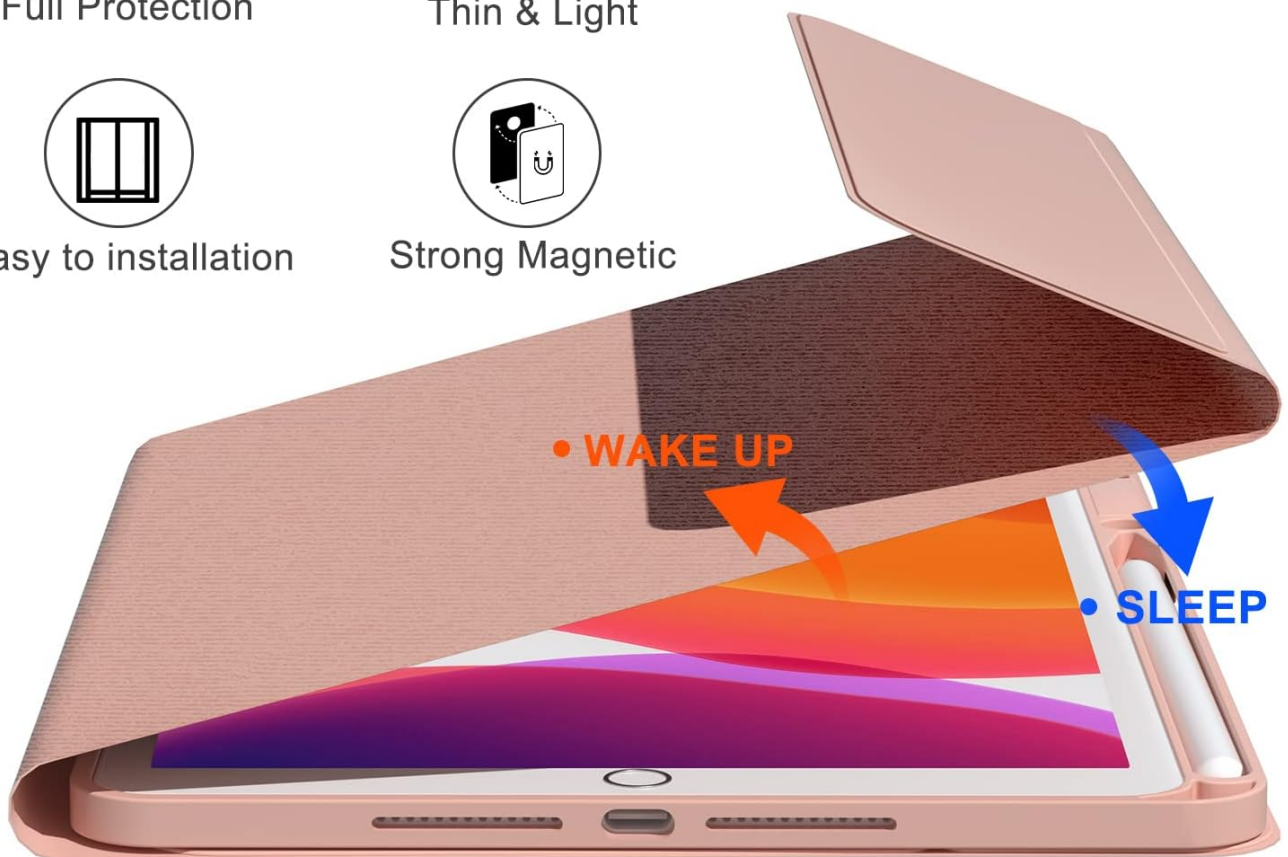
Figure 5: Auto Sleep/Wake Functionality.