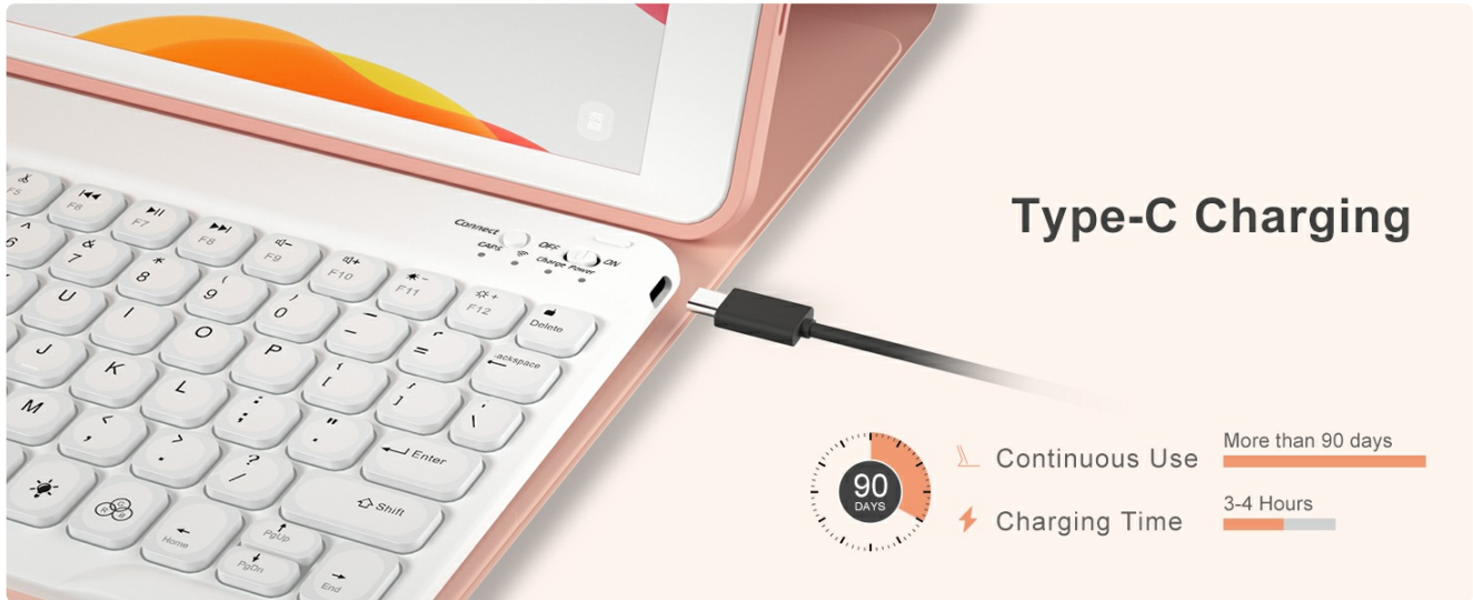
Figure 8: Type-C Charging for the keyboard.