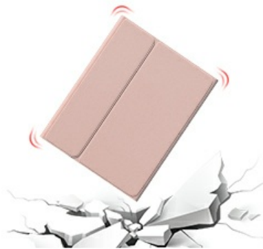
Figure 9: Honeycomb grid pattern for heat dissipation and shock absorption.