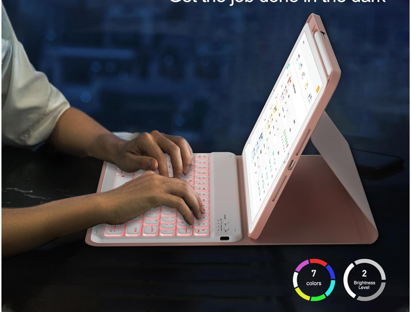
Figure 3: Backlit Keyboard with color and brightness controls.