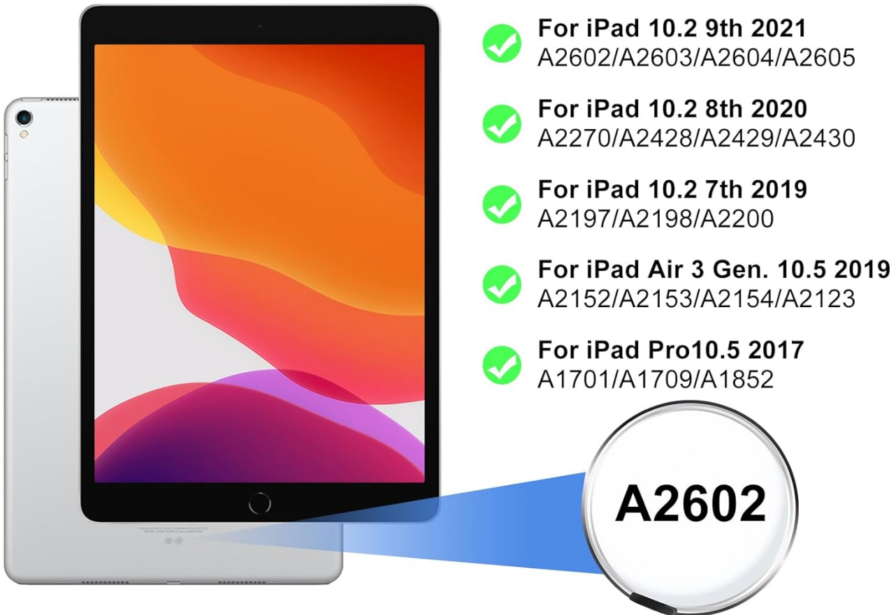
Figure 1: iPad Compatibility Guide. Check your iPad's model number for proper fit.

Please Confirm the Model Number on the Back of Your iPad