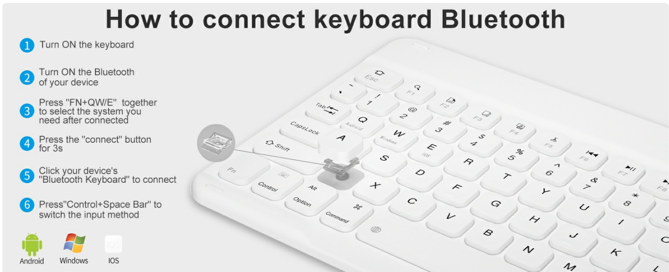
Figure 2: Bluetooth Keyboard Connection Steps.

Your browser does not support the video tag.