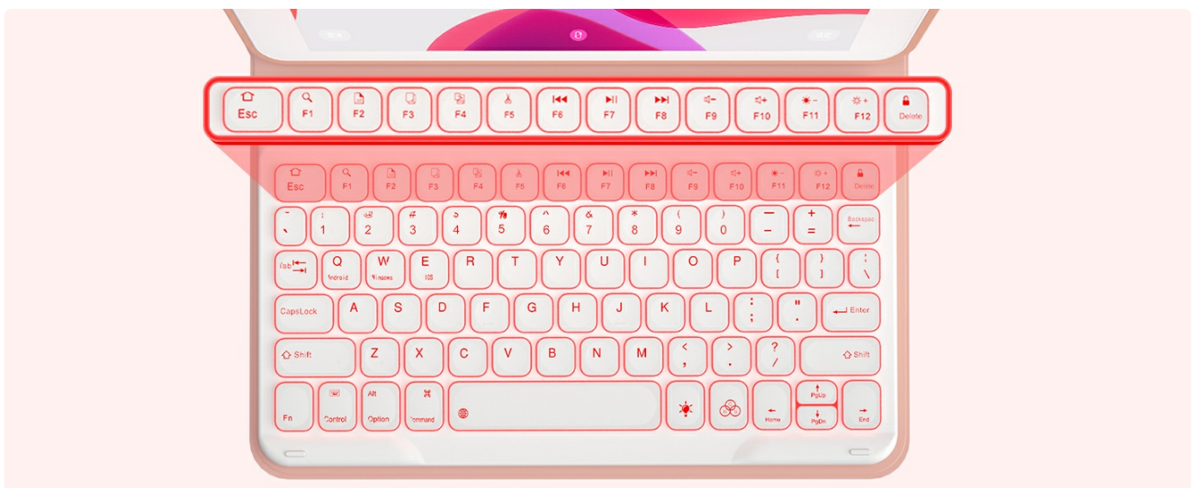
Figure 4: The 7-color backlit keyboard allows for typing in dark environments.