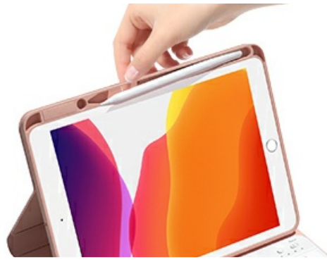
Figure 10: Upgraded pen slot for secure storage.