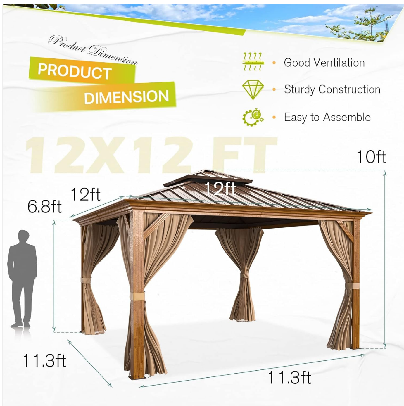
Image: A detailed diagram illustrating the product dimensions of the 12'x12' gazebo, including height, width, and length measurements,