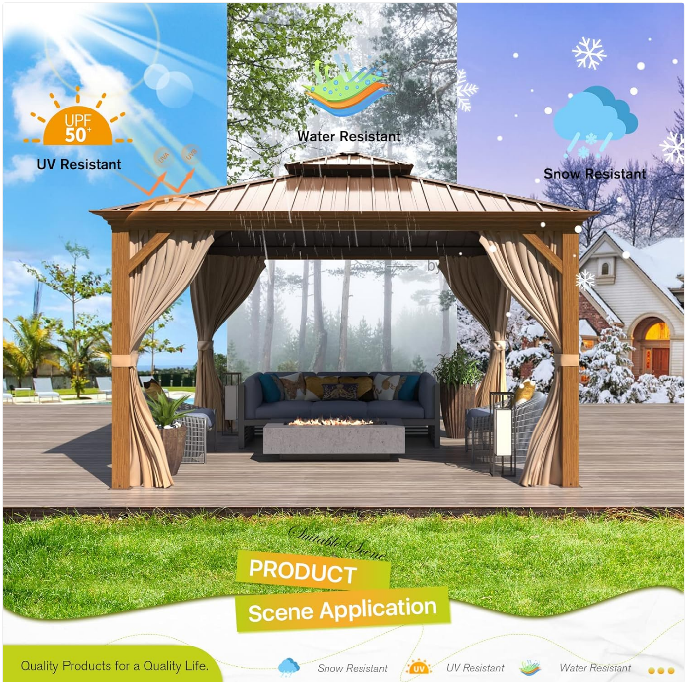
Image: A visual representation demonstrating the gazebo's resilience against various weather elements, including UV radiation (UPF 50+), water, and snow, highlighting its all-weather durability.