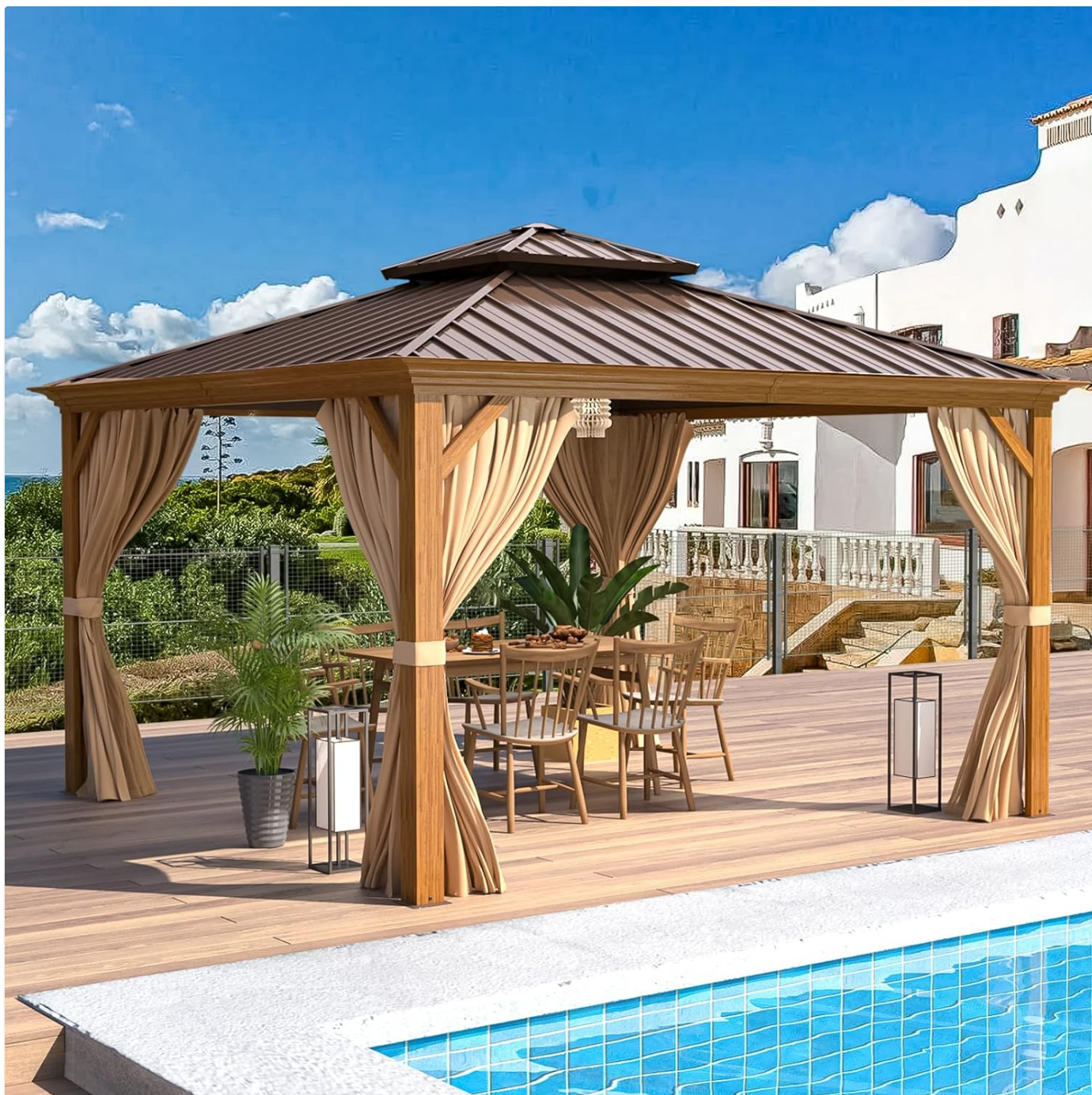
Image: The EROMMY 12'x12' Hardtop Gazebo, showcasing its wood-looking finish aluminum frame and galvanized steel roof, set up in an outdoor patio area beside a swimming pool, complete with curtains tied back.