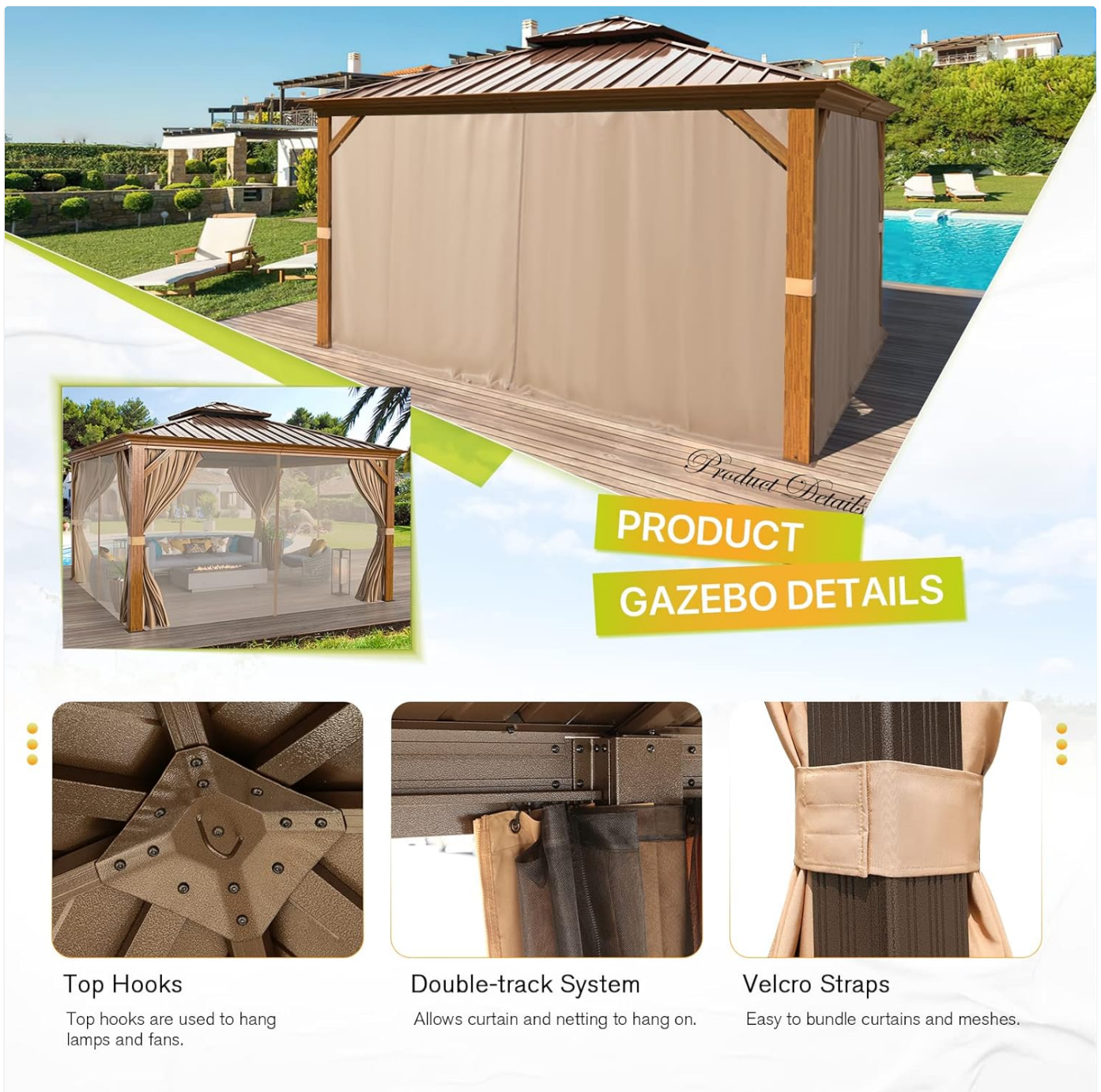
Image: A composite image detailing key features of the gazebo: top hooks for hanging accessories, the double-track system for curtains and nettings, and velcro straps for bundling the fabric layers.