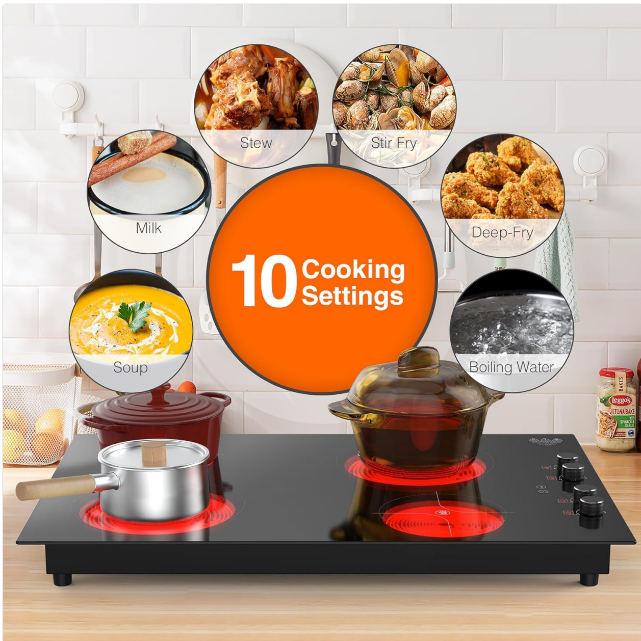
Image 3: The cooktop demonstrating various cooking applications such as stew, stir-fry, deep-fry, boiling water, soup, and milk.