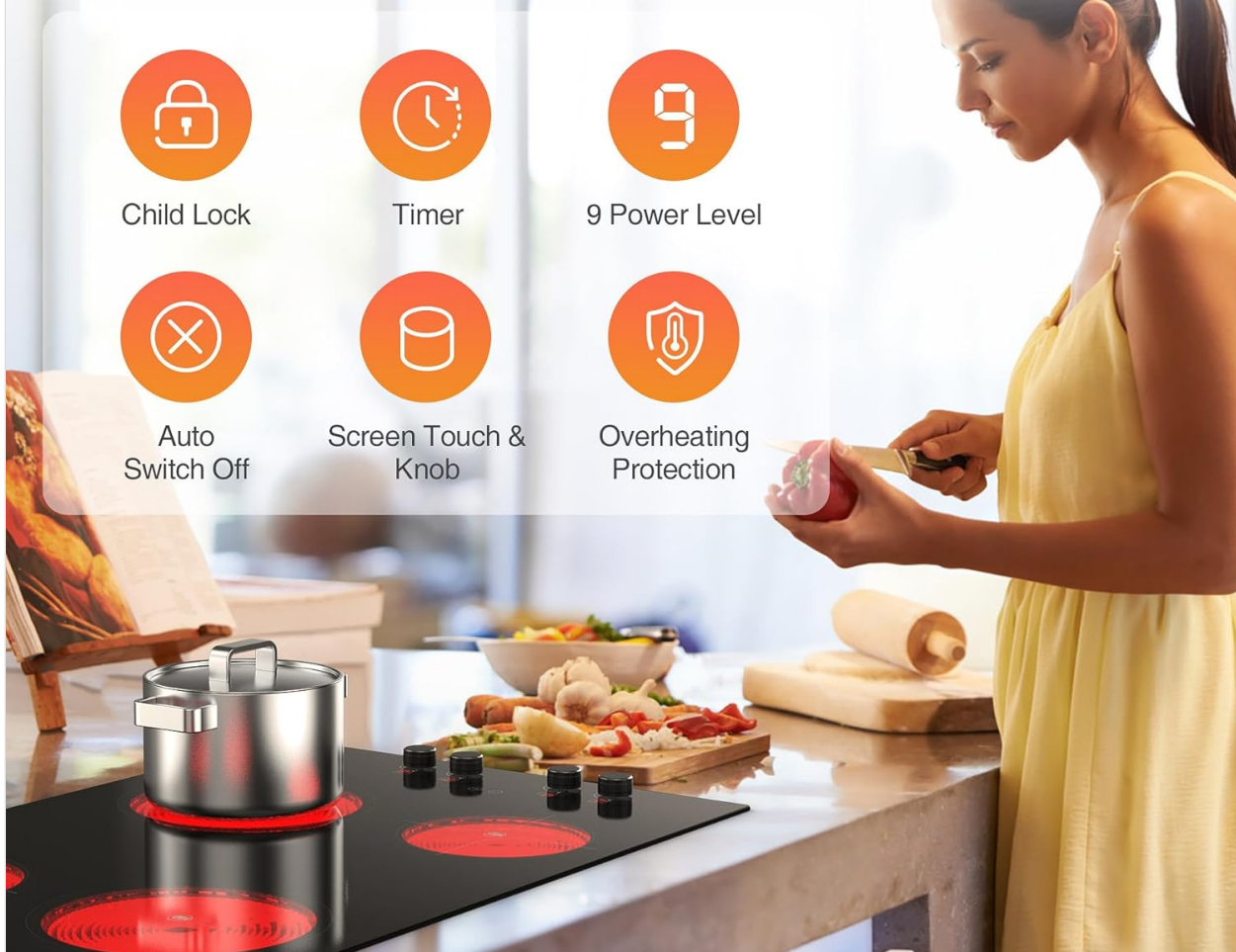
Image 2: Overview of cooktop safety features including Child Lock, Timer, 9 Power Level, Auto Switch Off, and Overheating Protection.