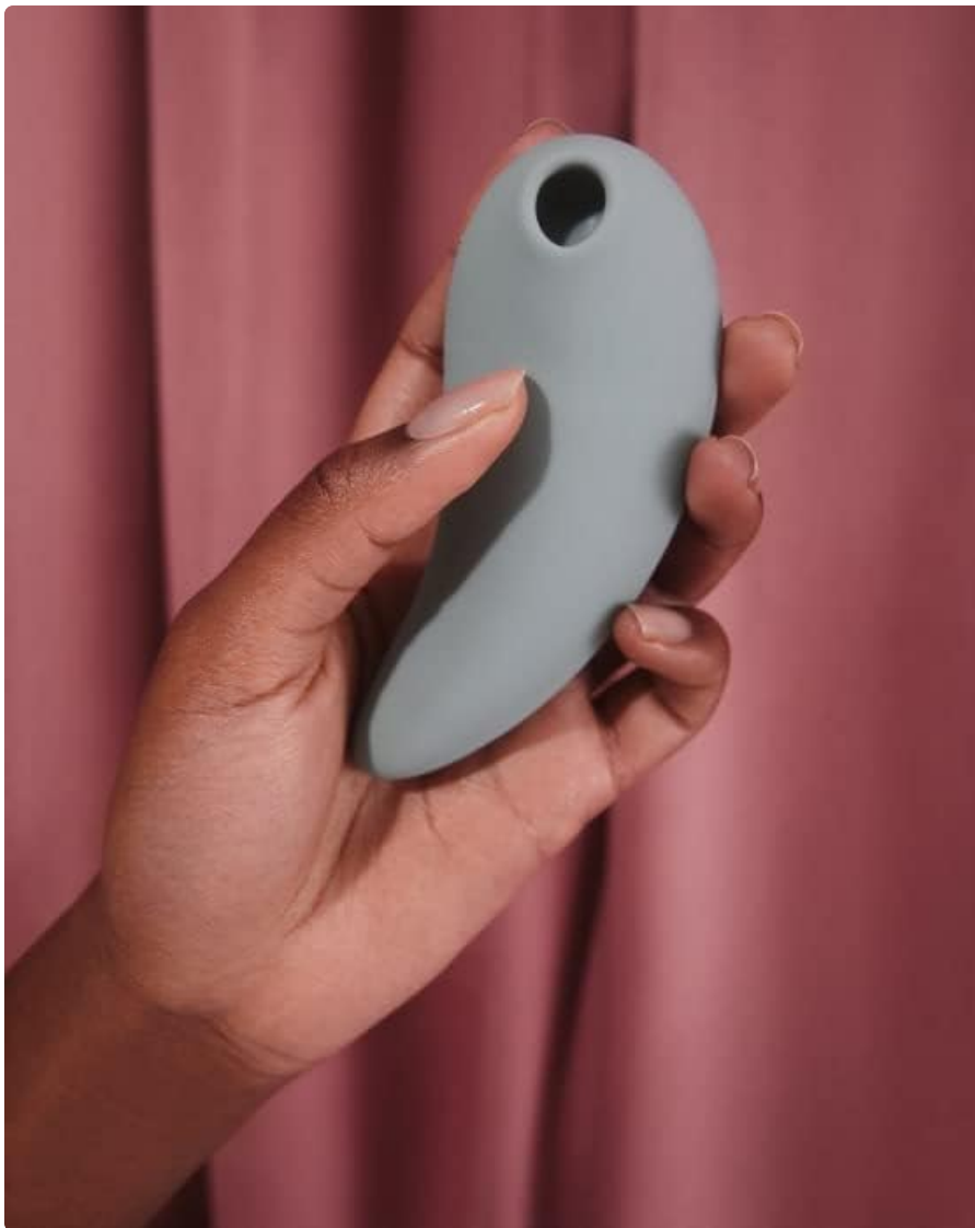
Image: The BELLESA Thump device held in a hand, showcasing its ergonomic design.