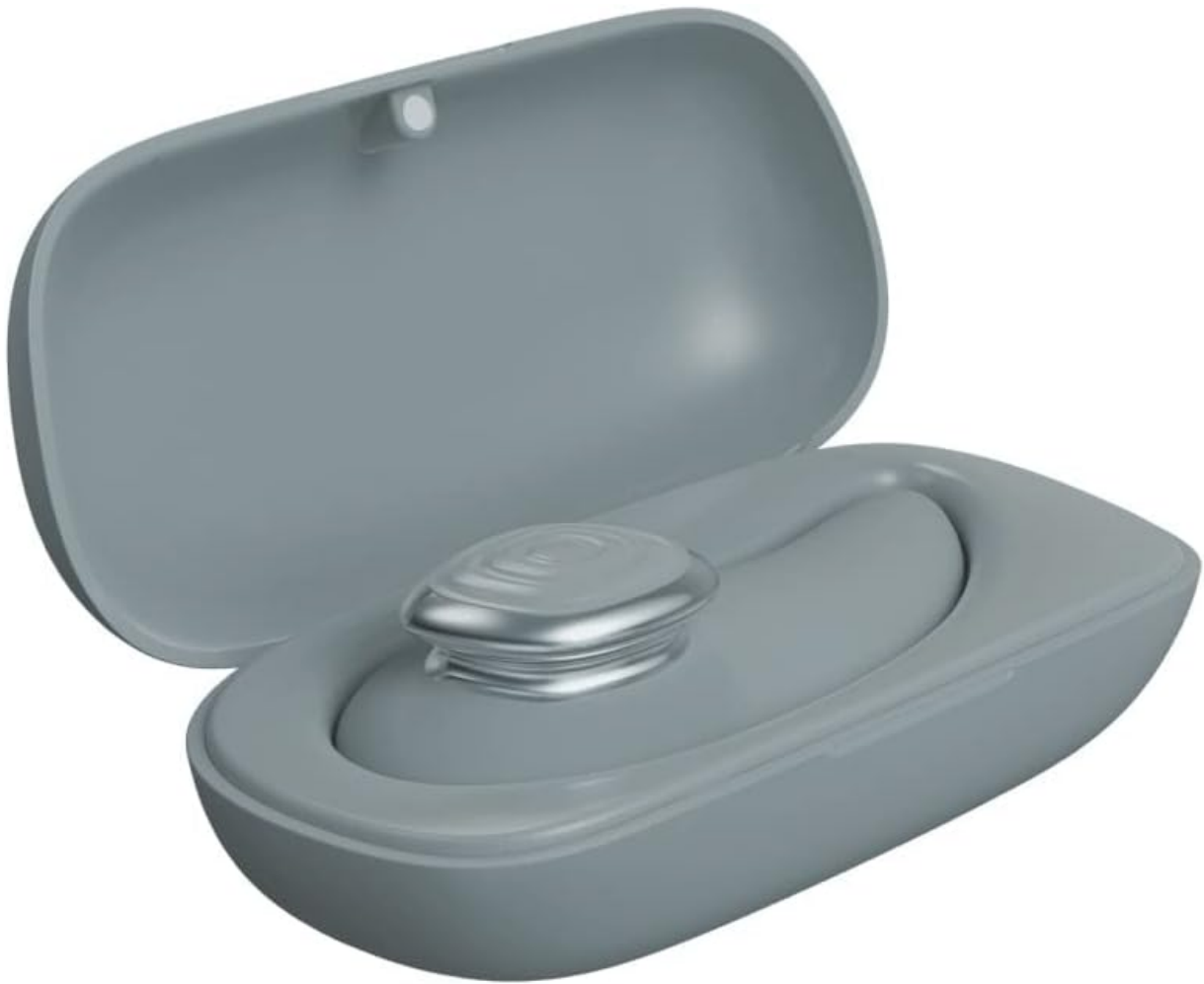
Image: The BELLESA Thump device neatly stored within its protective case.