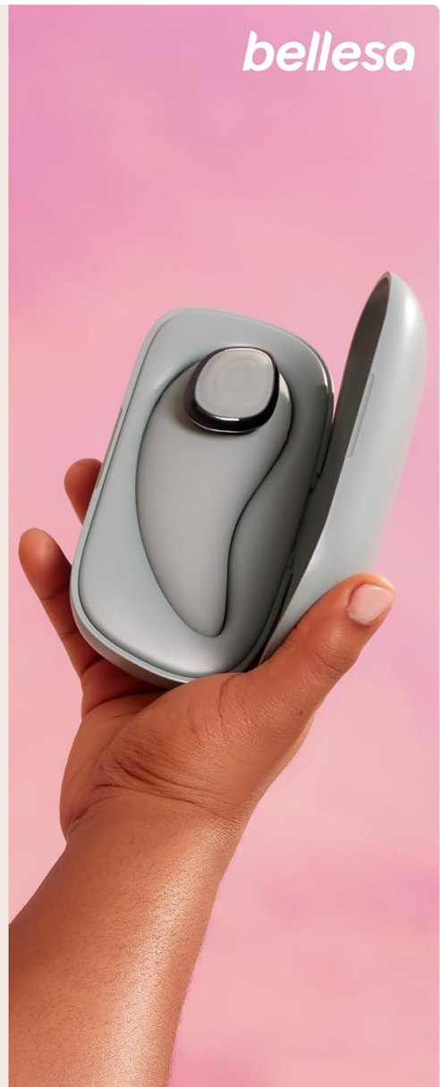
Image: Visual representation of key features including storage, silicone material, waterproof capability, and rechargeable function.