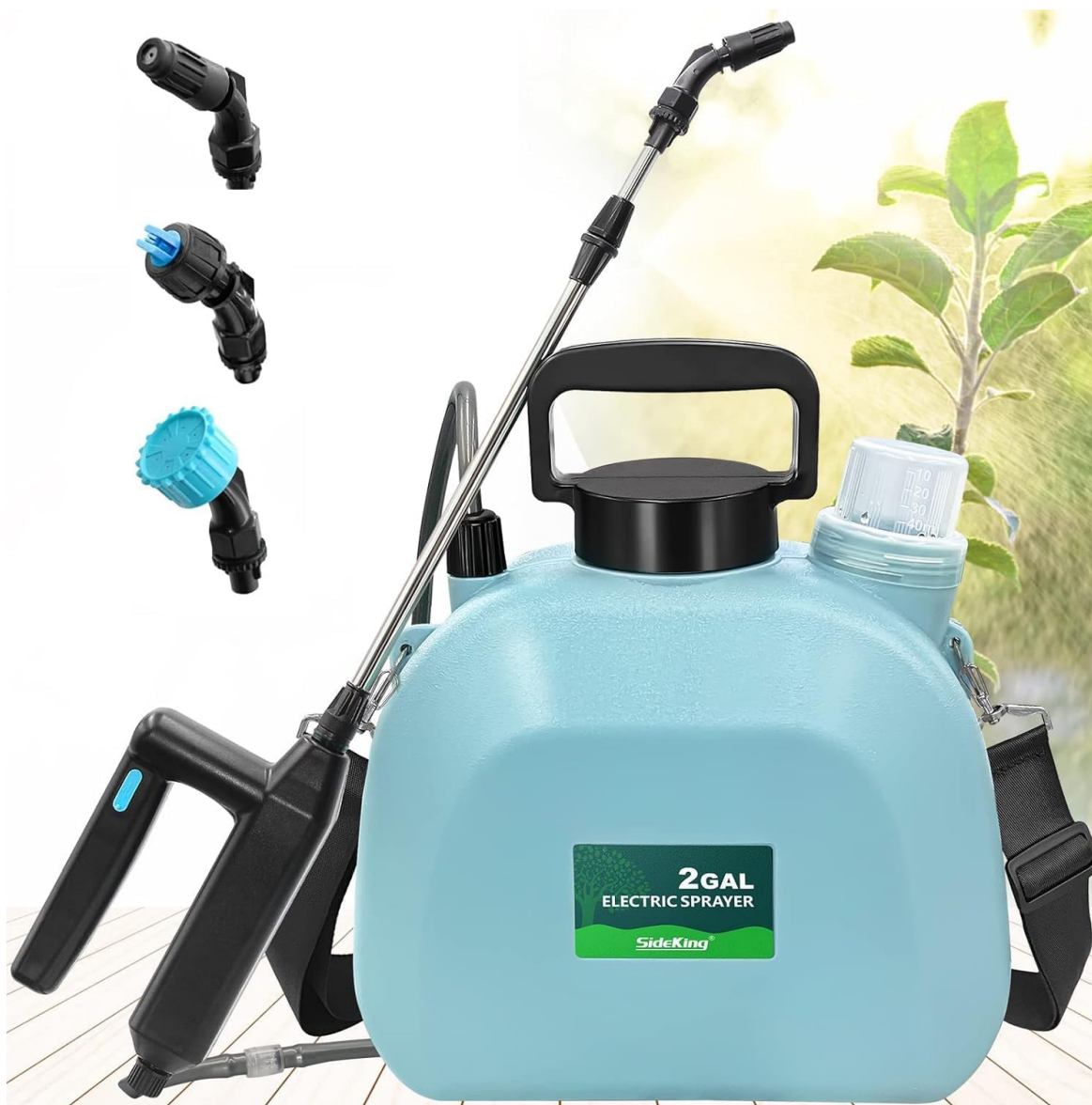
Image: The SideKing 2 Gallon Battery Powered Garden Sprayer with its main components laid out. This image shows the overall product design and included parts.