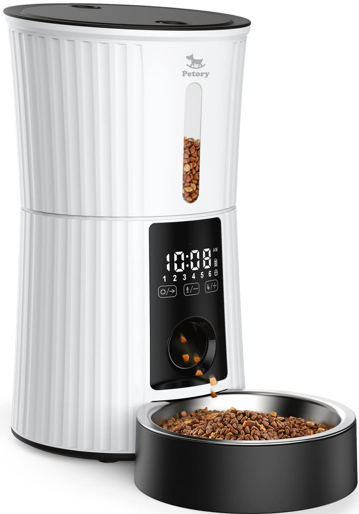
Figure 1: Petory Automatic Cat Feeder (Model F01R)