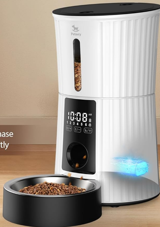
Figure 4: Long-lasting Battery Life

* No need to purchase batteries frequently