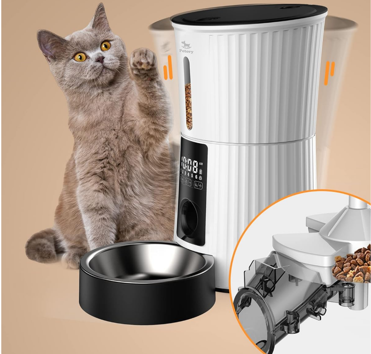
Figure 3: Airtight Storage Mechanism

Effectively avoid shaking to get more food out