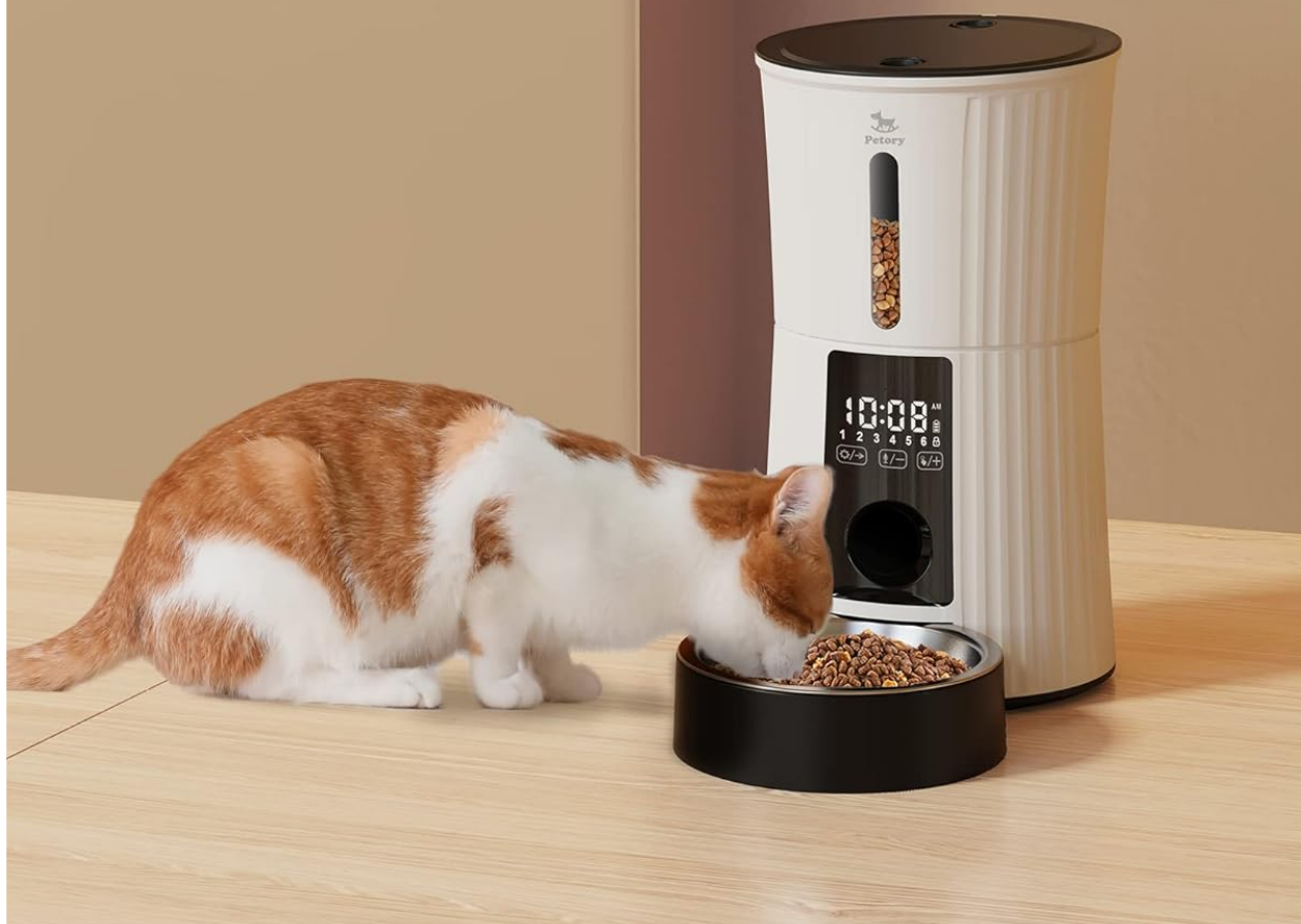
Figure 2: Customizable Feeding Plan