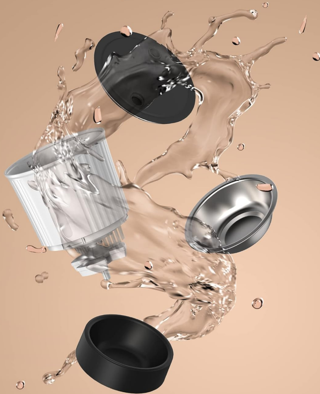
Figure 8: Easy to Clean Components