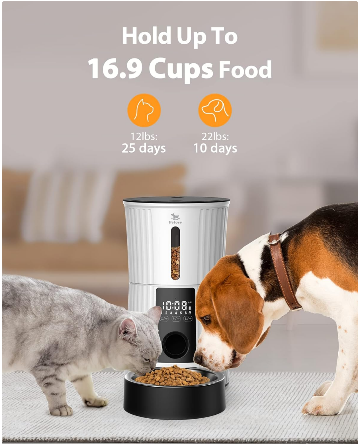
Figure 7: Food Capacity