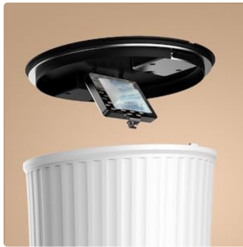
Figure 5: Built-in Rechargeable Battery