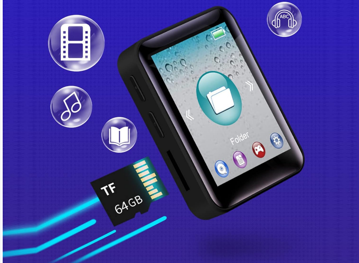
Image: The MP3 player screen displaying a music icon, surrounded by text indicating features like eight-speed play, A-B restudy, and subtitle synchronization, useful for language learning.

Big capacity big wonderful 64 gb memory card extension is supported