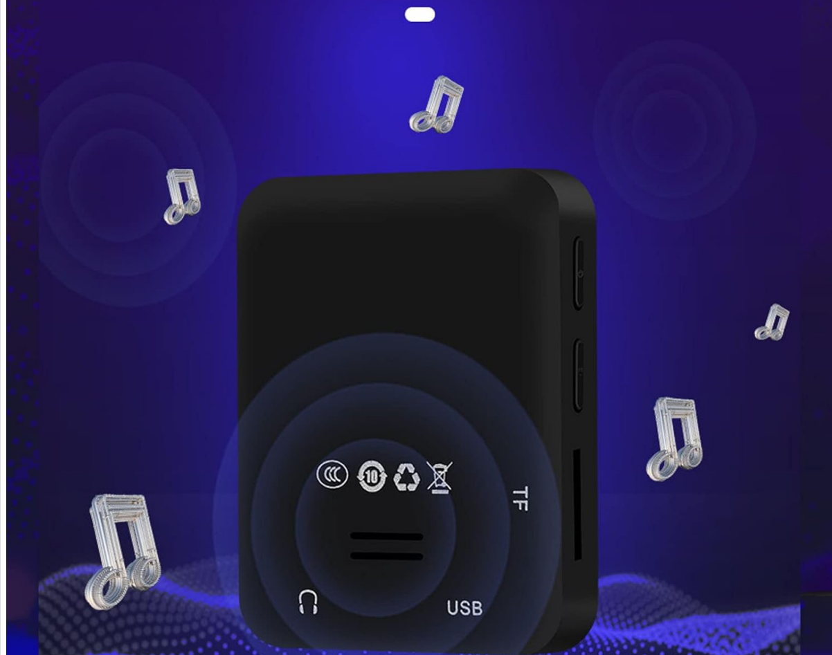
Image: The rear view of the MP3 player, emphasizing its dual magnetic external speaker for audio output without headphones.

You don't need headphones to listen to music Electronic/rock/funk/jazz and other 7 sound effects are available