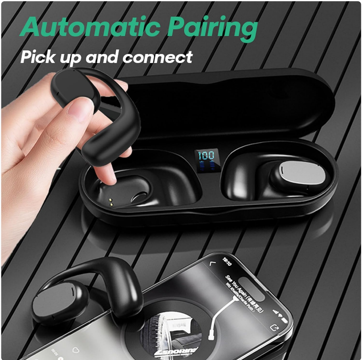
Image: A hand demonstrates picking up one of the headphones from its charging case, illustrating the automatic pairing feature with a smartphone in the foreground.