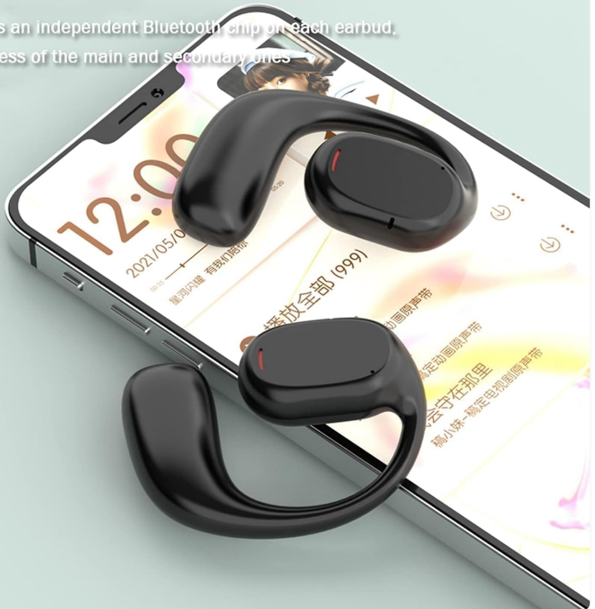
Image: Two black Xmenha headphones are shown, highlighting their independent operation for single or dual earbud use.

There is an independent Bluetooth chip on each earbud, regardless of the main and secondary ones