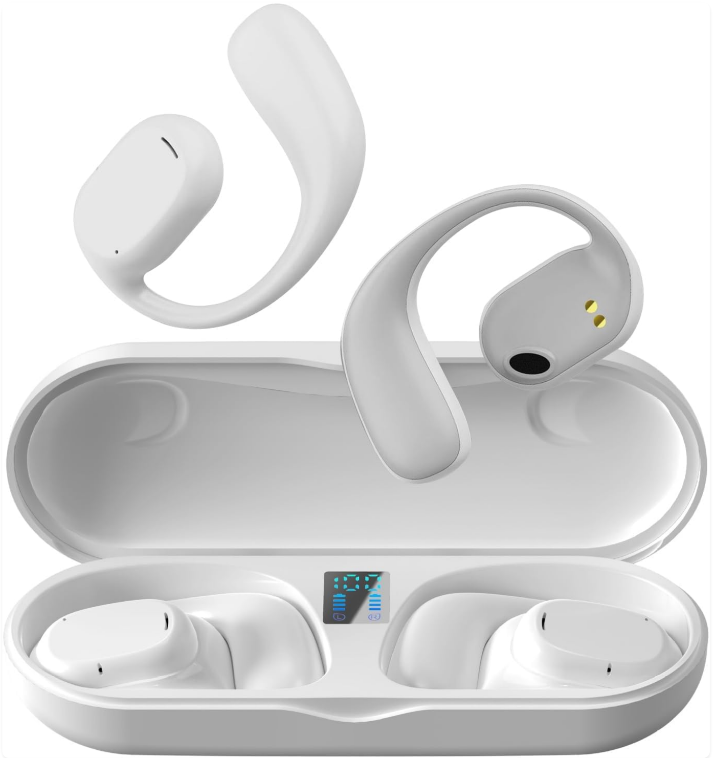
Image: The Xmenha Open Ear Bluetooth Headphones in their white charging case, showcasing the open-ear design and compact form factor.