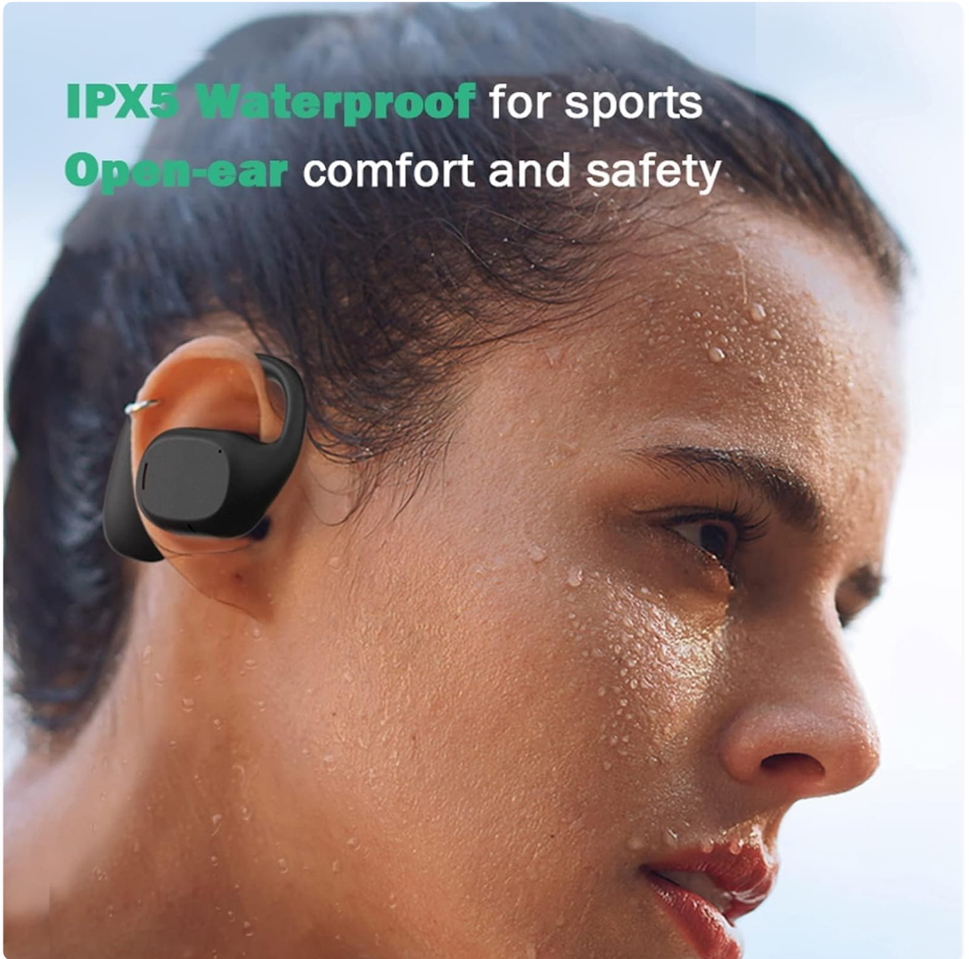
Image: A man wearing the headphones during a workout, demonstrating their IPX5 waterproof and sweatproof capabilities for sports.