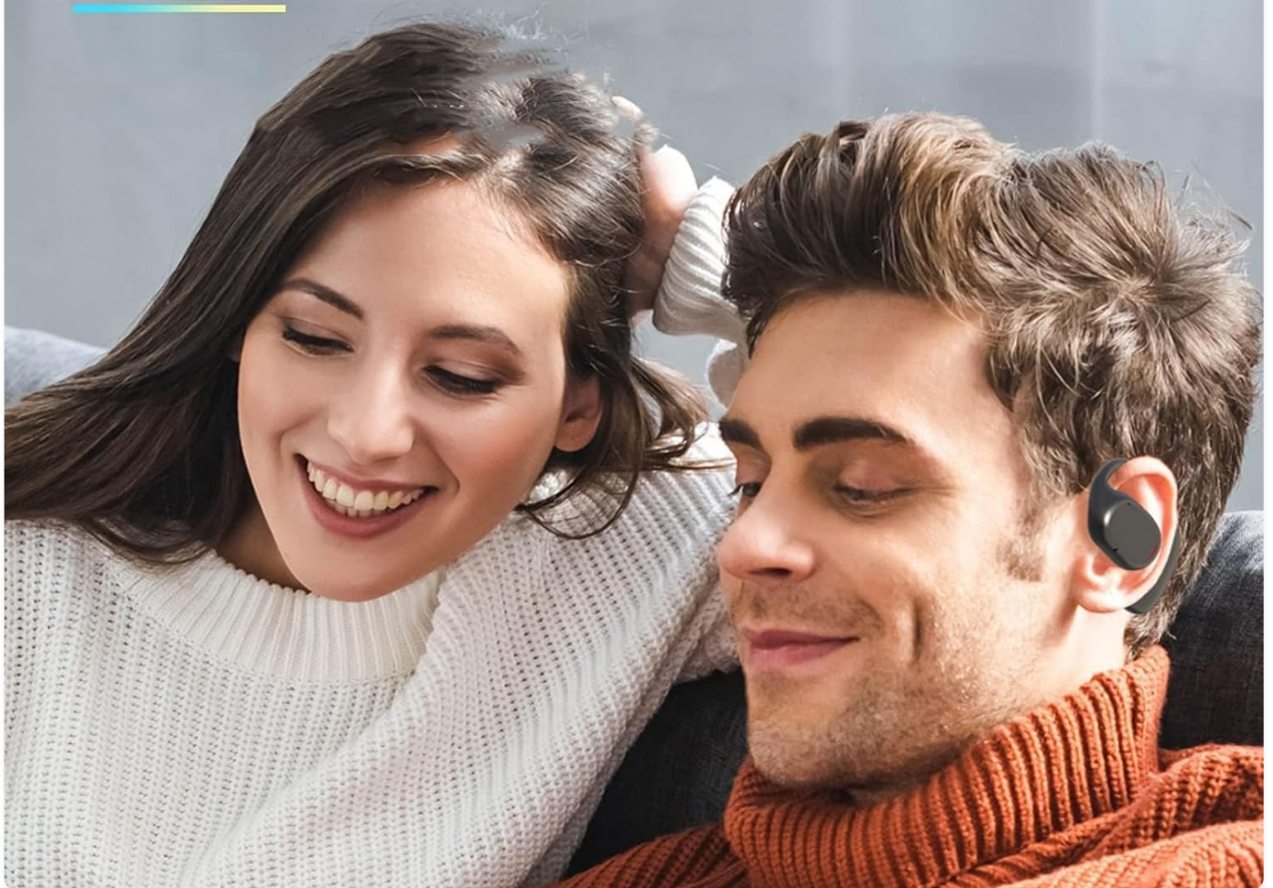
Image: Two individuals interacting, with one wearing the headphones, demonstrating how the open-ear design allows for conversation without removing the headphones.