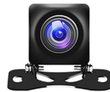
Pull back camera