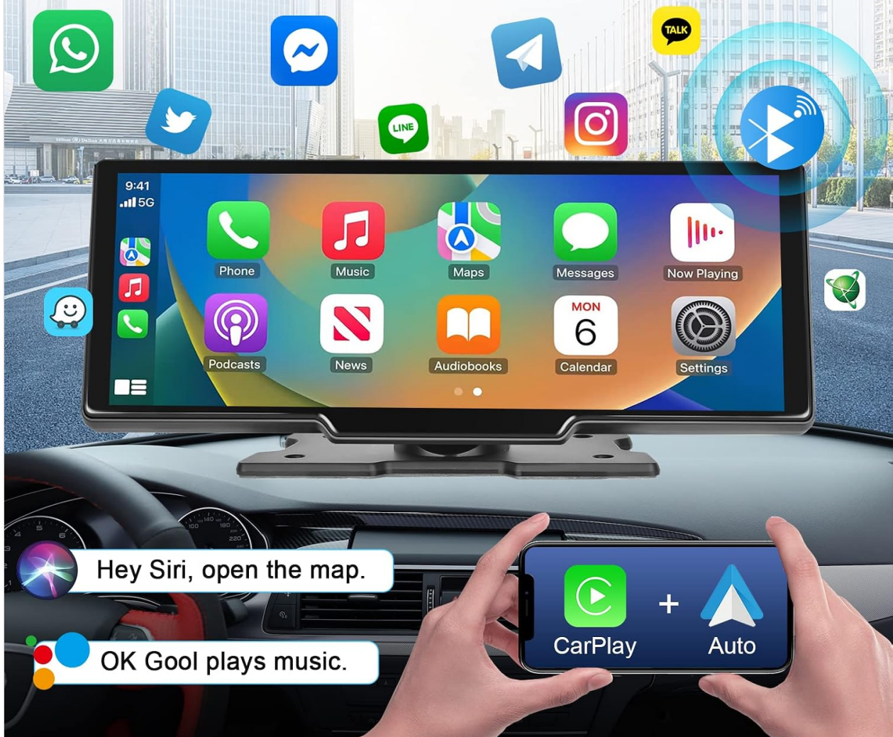
Figure 4: Wireless CarPlay Interface

Connection to carplay, connect to Apple mobile phone, use apps, output voice to execute voice commands.