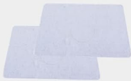
Bracket fixing sticker