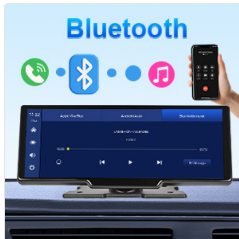
Figure 7: Bluetooth Connection Screen