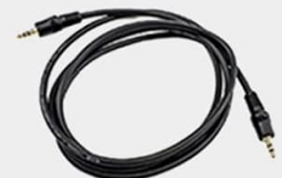
3m AUX cable