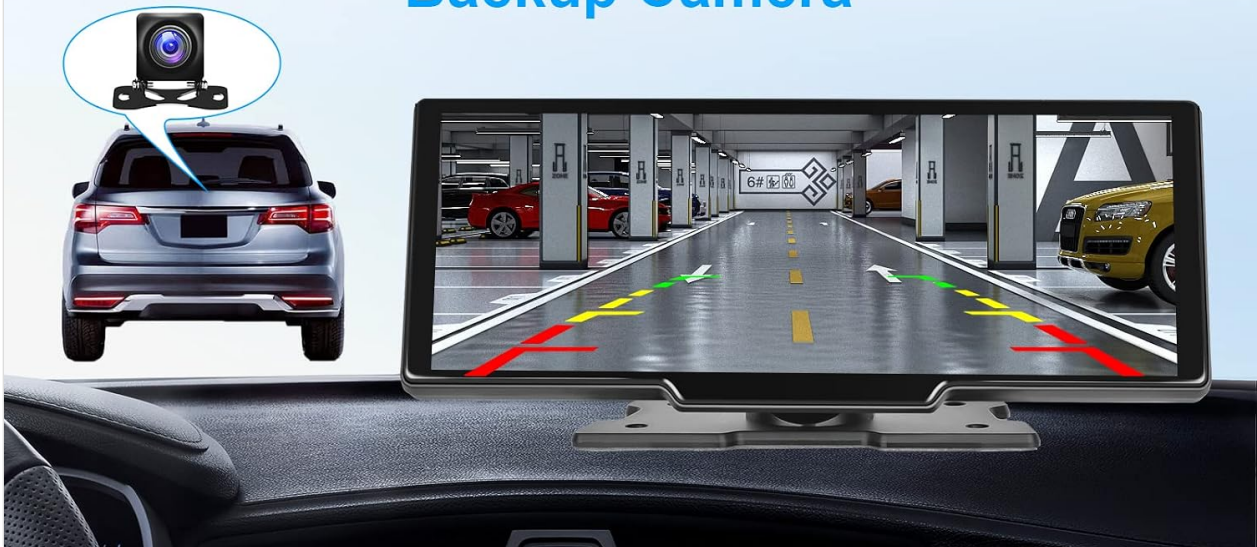
Figure 8: Dash Cam Loop Recording and Backup Camera View