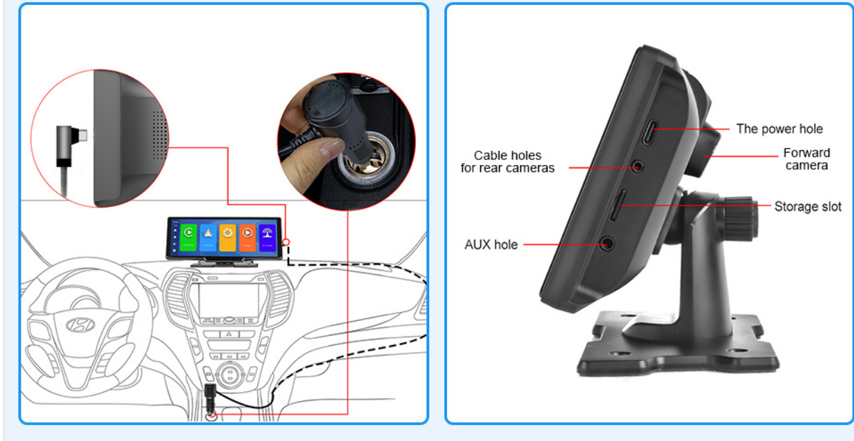
Figure 3: Wiring Diagram