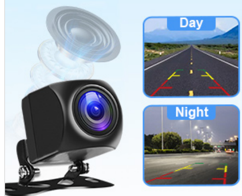
Figure 9: AHD Backup Camera Details