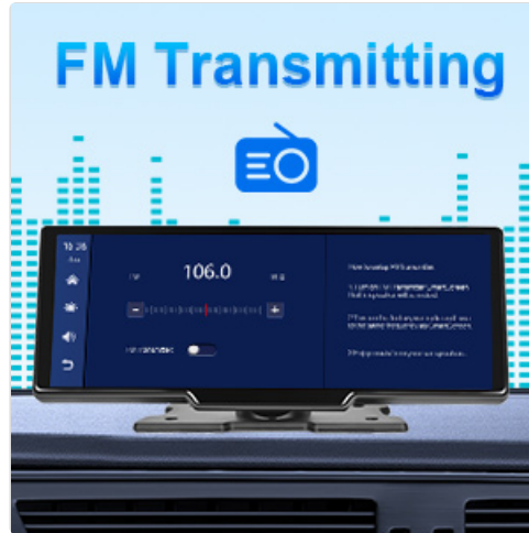
Figure 6: FM Transmitting Interface