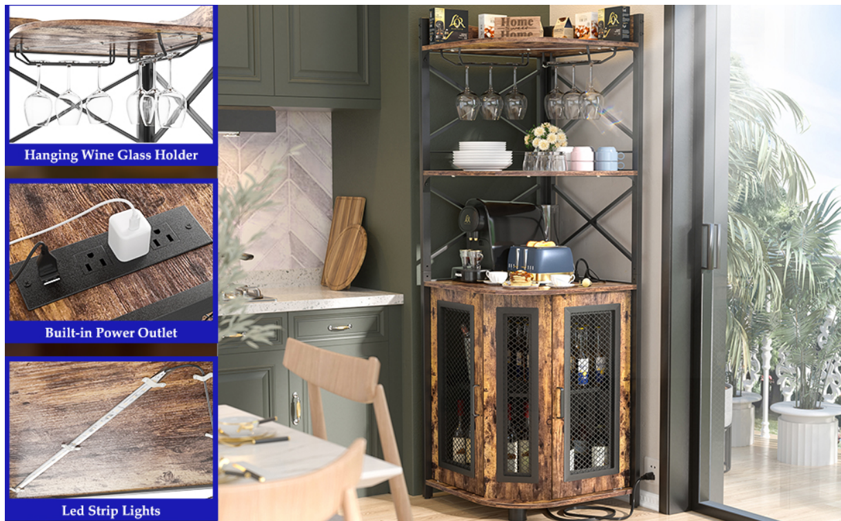
Image 5.2: Overview of LED light features, including control options.