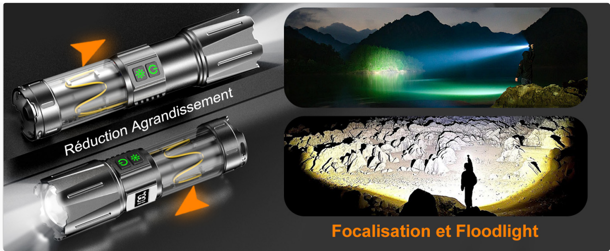
Figure 7: Adjusting the focus between floodlight and spotlight.