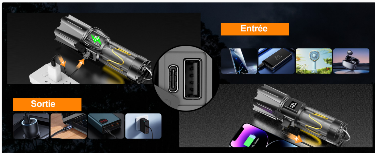
Figure 4: USB-C input for charging and USB-A output for power bank function.