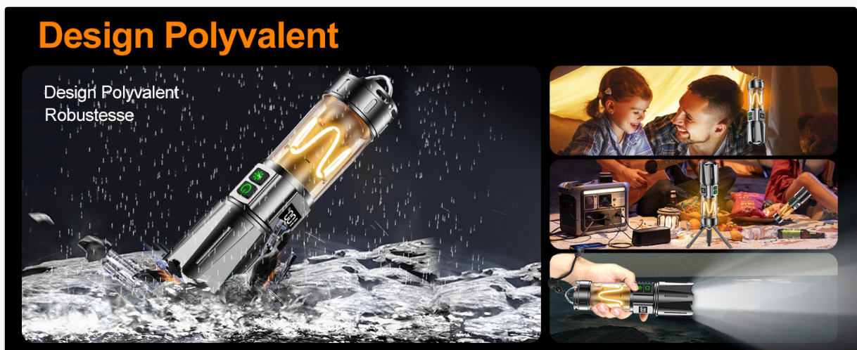
Figure 8: The flashlight's robust and IPX6 waterproof features.