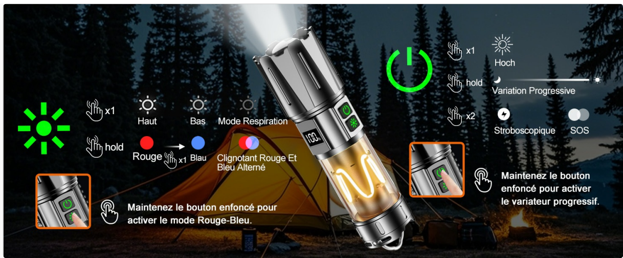
Figure 5: Main light and COB light mode controls.