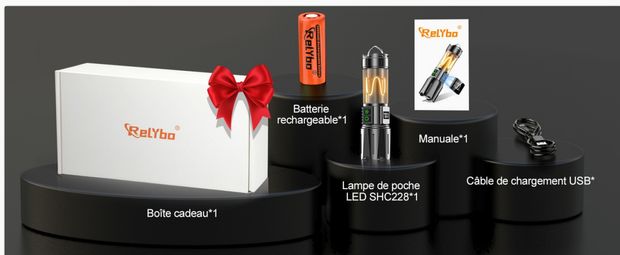
Figure 2: Included components in the Relybo SHC228 package.