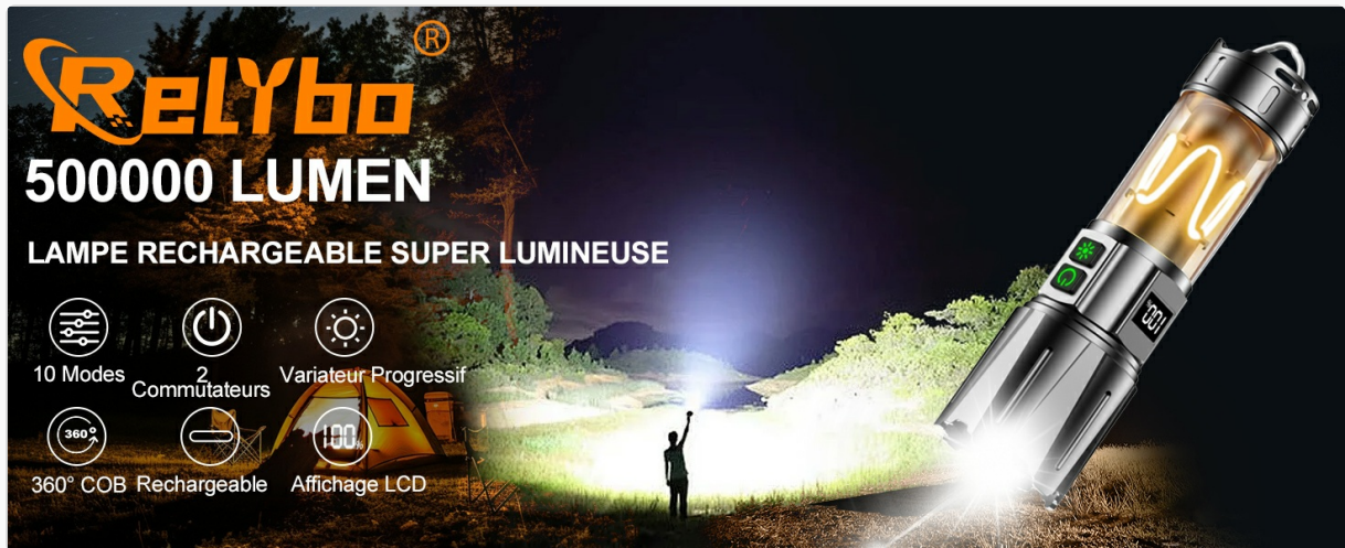
Figure 1: Relybo SHC228 LED Flashlight with its main features.

The Relybo SHC228 LED Flashlight is a versatile and powerful lighting tool designed for various applications, including outdoor activities, emergencies, and general use. It features a high-performance LED chip, multiple lighting modes, continuous dimming, and a rechargeable battery with power bank functionality.