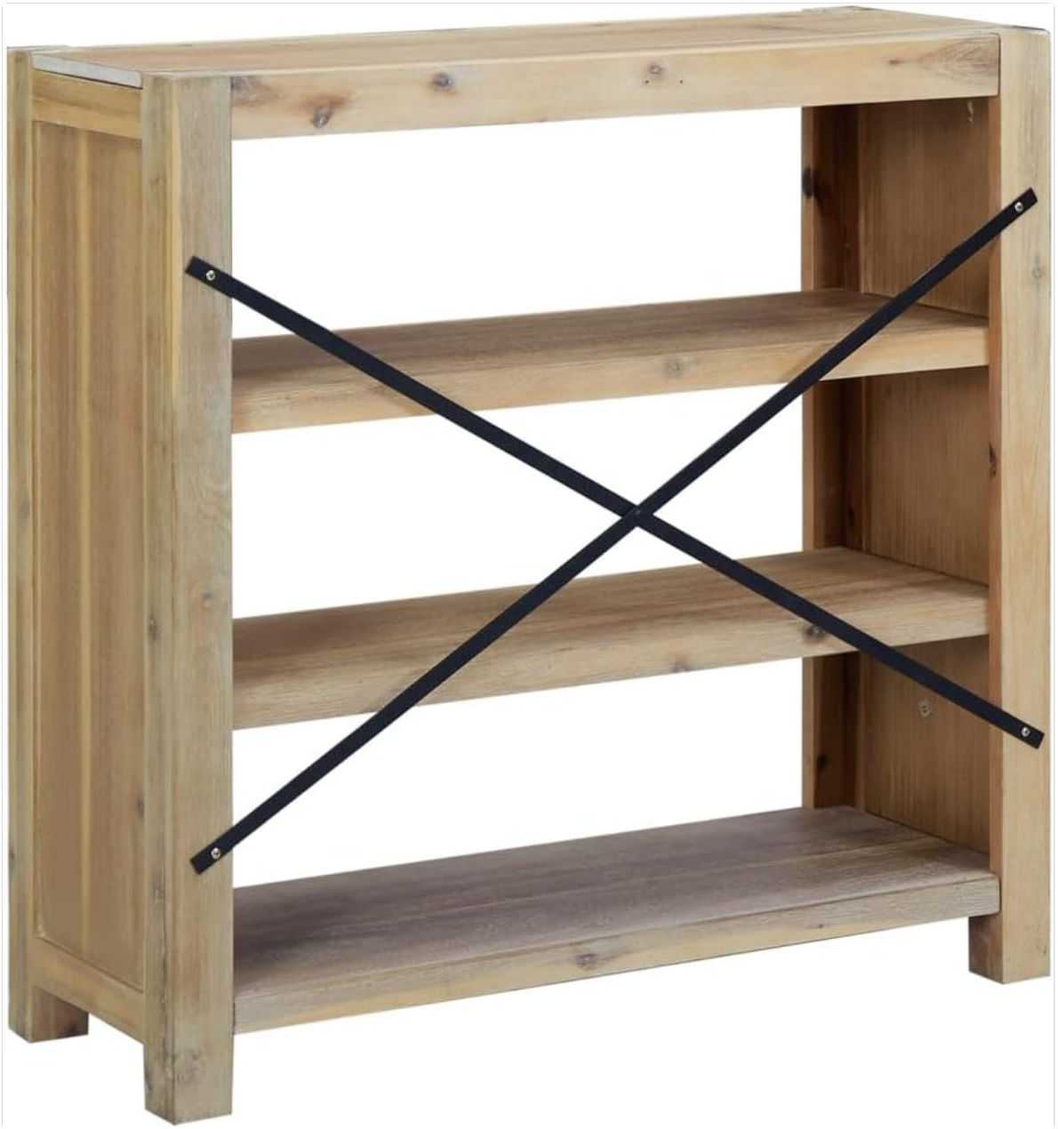
Image 4.1: Rear view of the bookcase, showing the X-shaped metal cross-bracing for enhanced stability.