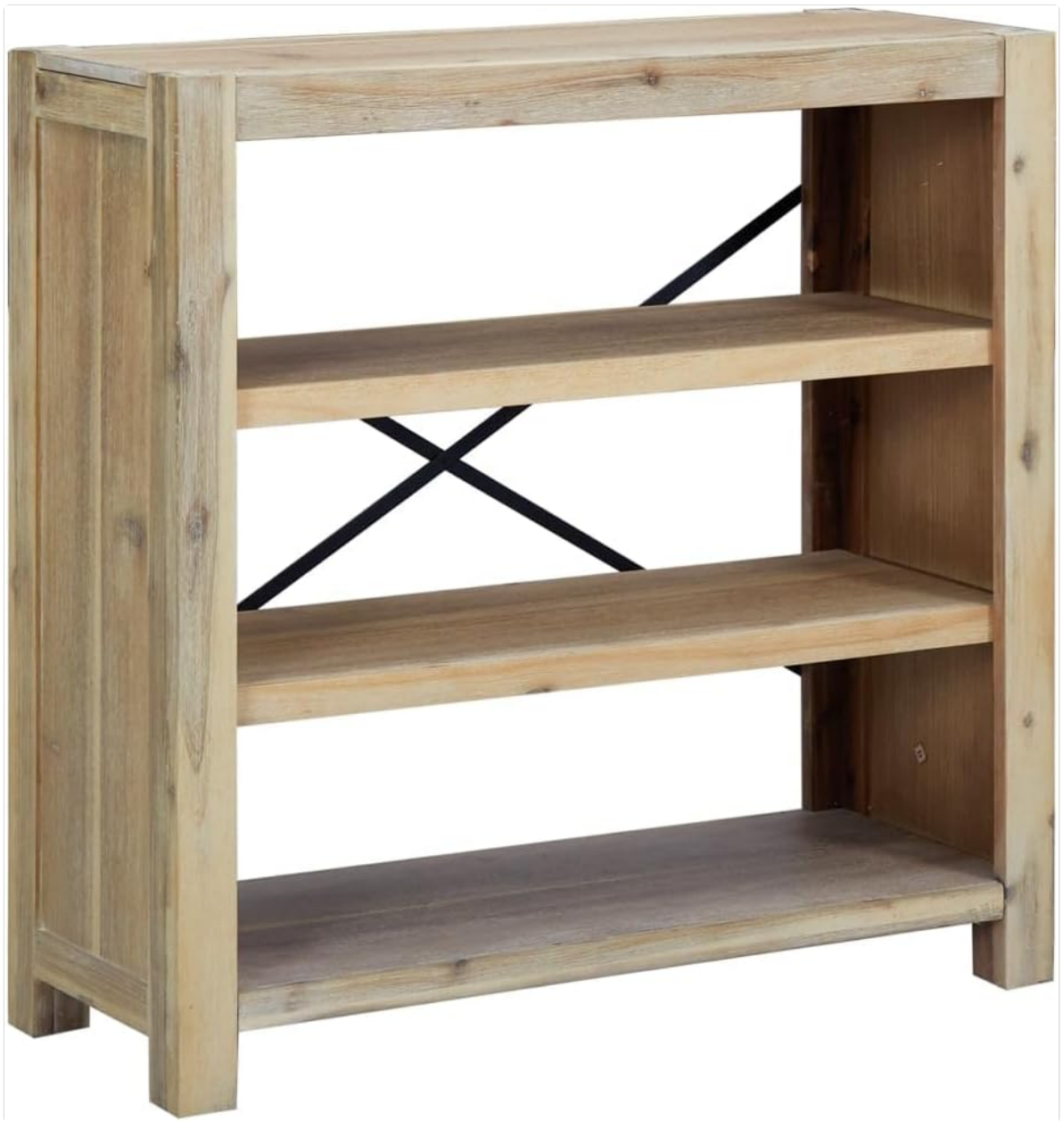
Image 1.1: The vidaXL Solid Acacia Wood 3-Tier Bookcase, showcasing its brushed finish and three shelves.