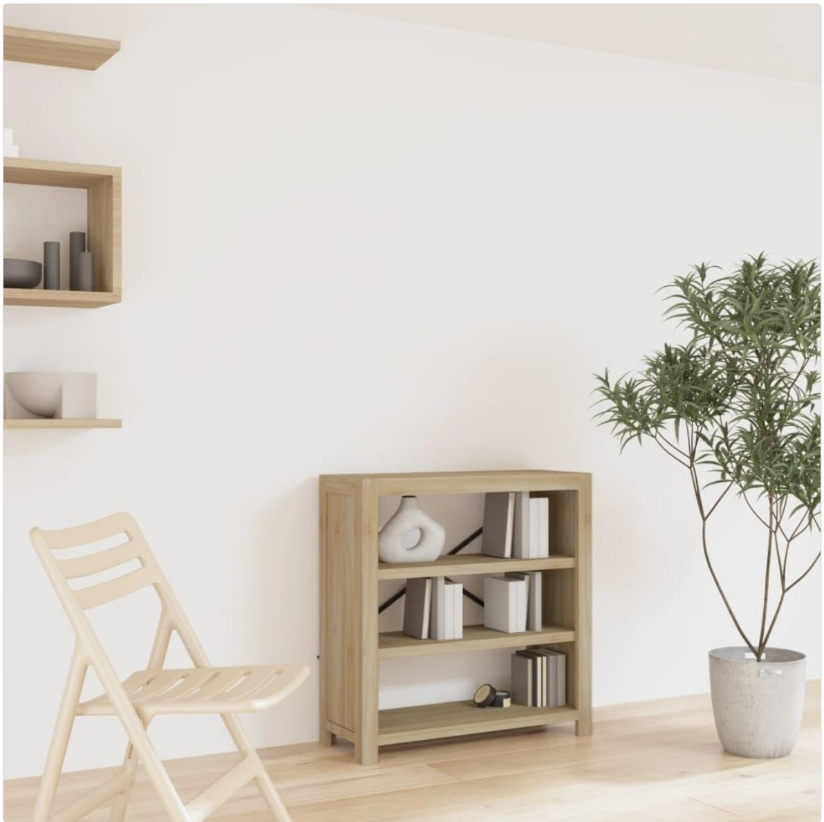
Image 5.1: The bookcase integrated into a living space, demonstrating its storage and display capabilities.