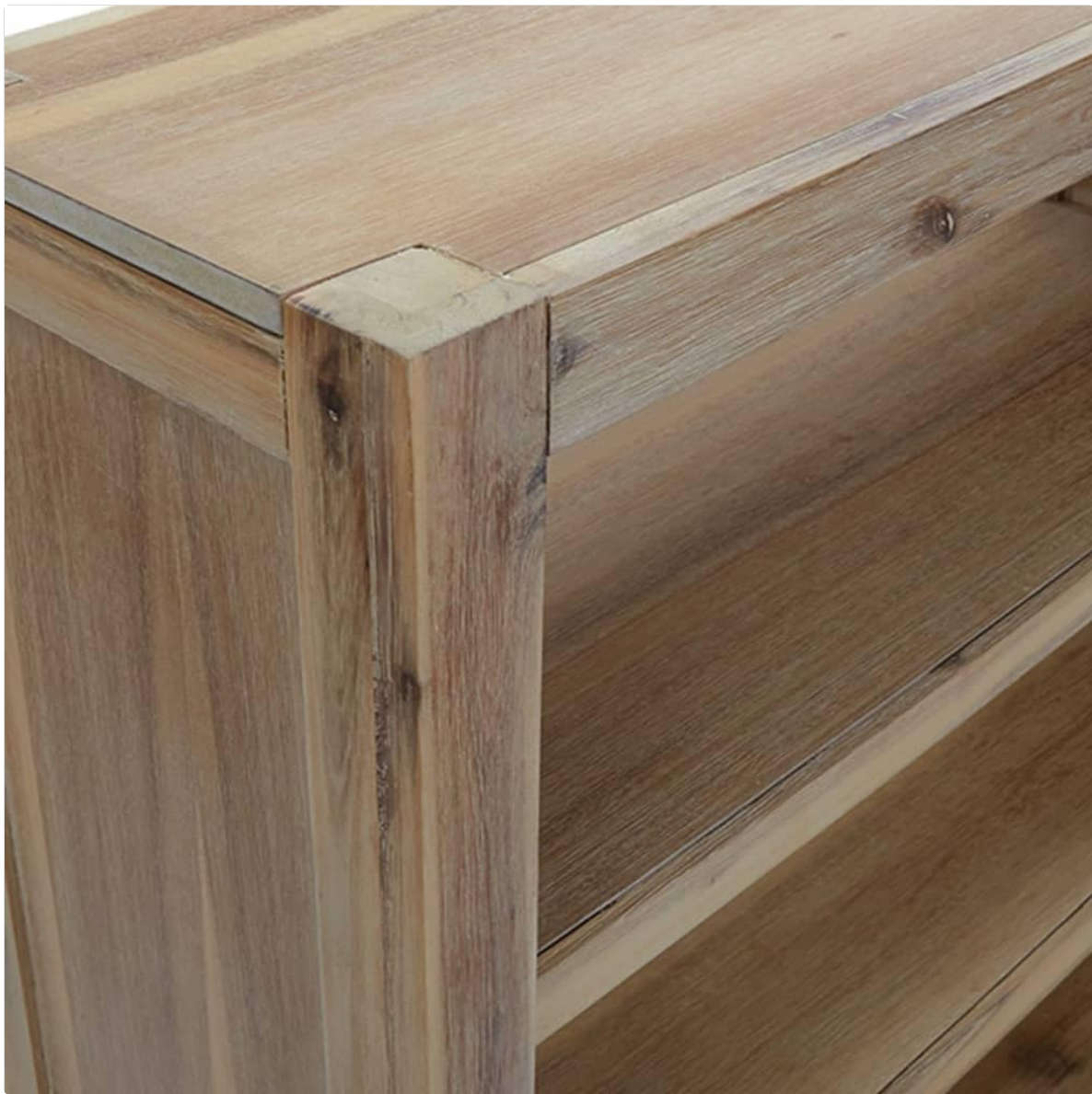
Image 6.1: Close-up of the brushed acacia wood finish, highlighting the natural grain and texture.