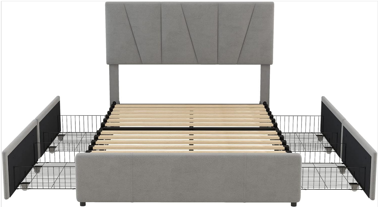
Image: The bed frame with both storage drawers partially pulled out, demonstrating their functionality.