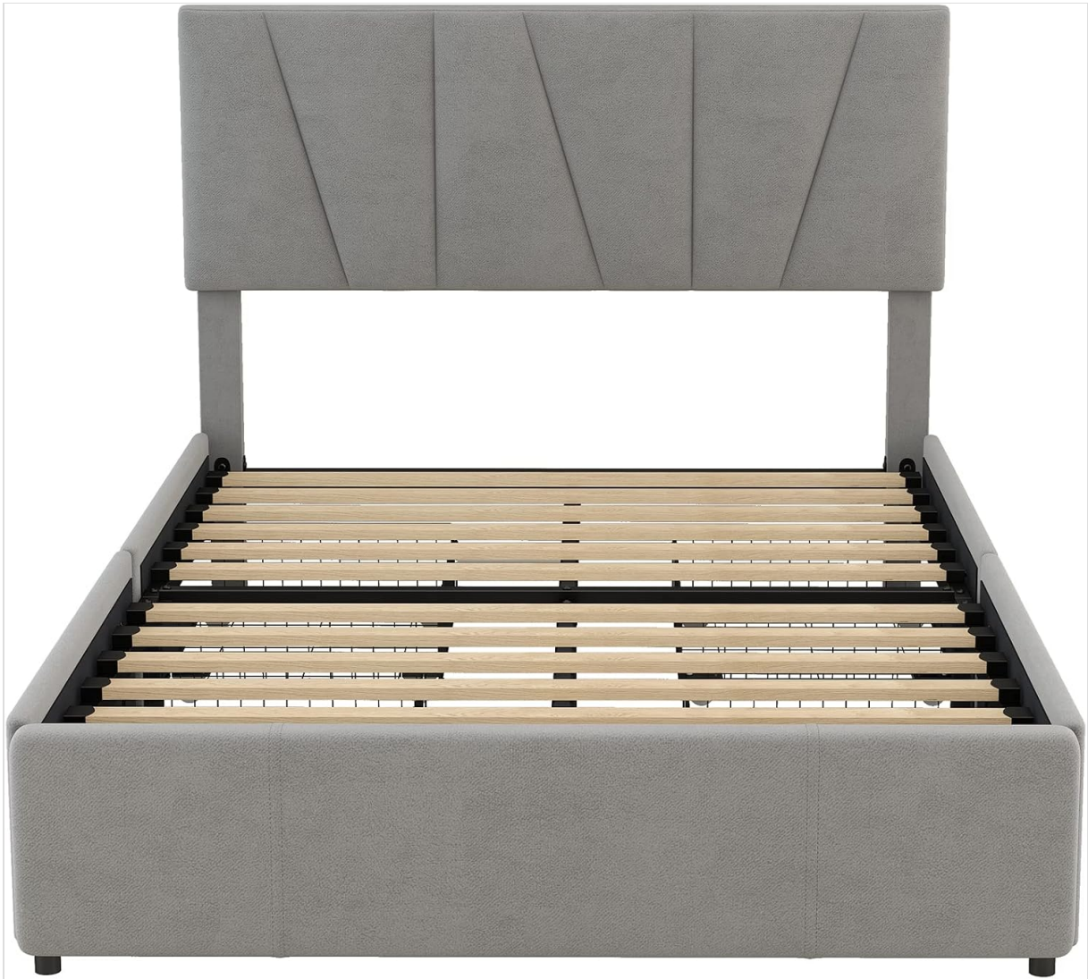
Image: The main bed frame structure with the slatted base installed, ready for the headboard and drawers.