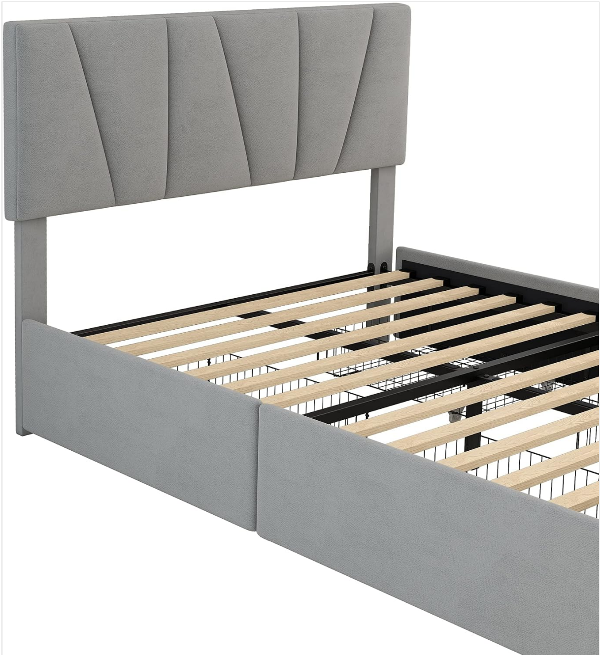
Image: A close-up view of the headboard connected to the bed frame, showing the slatted base.