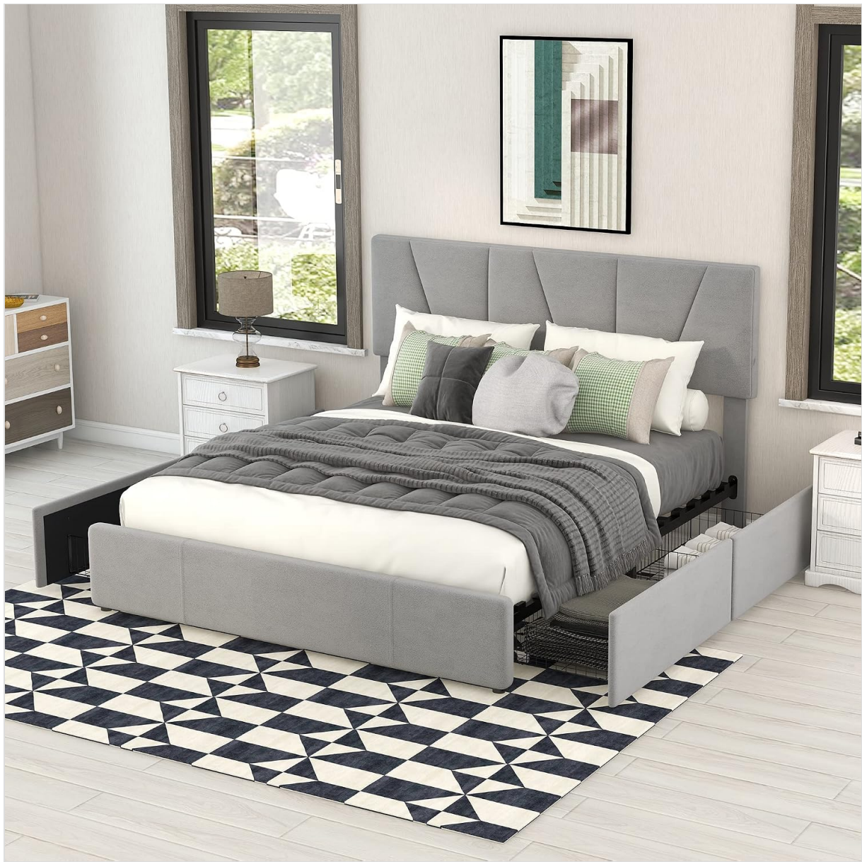
Image: A lifestyle shot of the bed with one storage drawer open, showing its capacity for storing items.