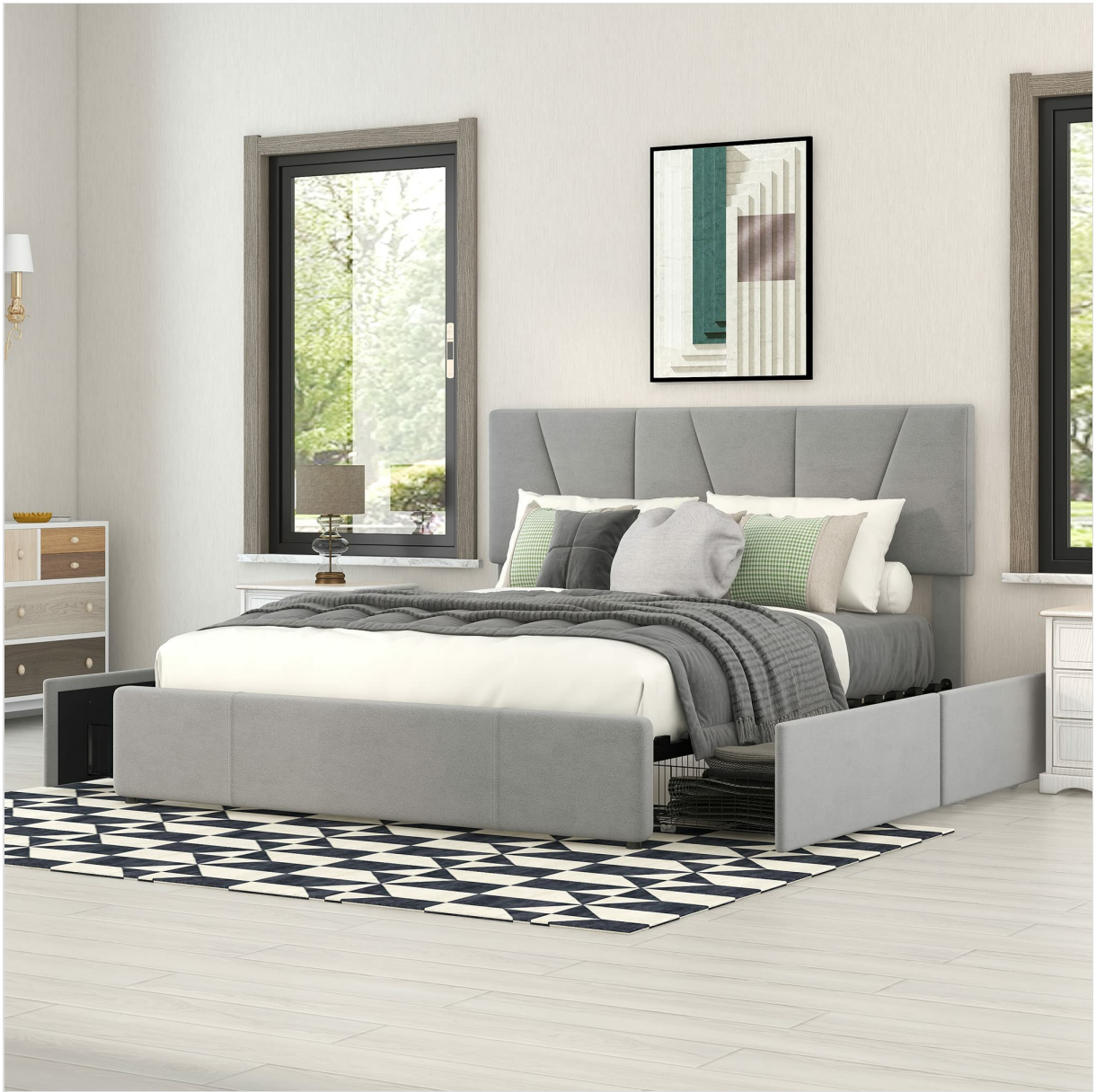
Image: The ModernLuxe velvet upholstered bed in a bedroom setting, showcasing its design and integrated drawers.