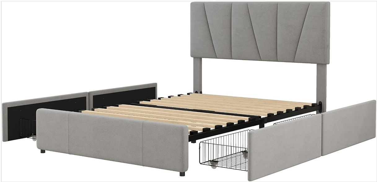
Image: All major components of the bed frame, including the headboard, side rails, slatted base, and storage drawers, laid out before assembly.