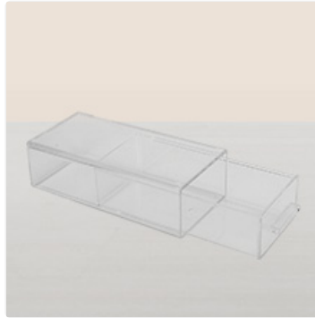
Image: The Anko Clear Pull-Out Storage Drawer Organizer with its drawer partially pulled out, demonstrating the easy access and removable design for setup and use.