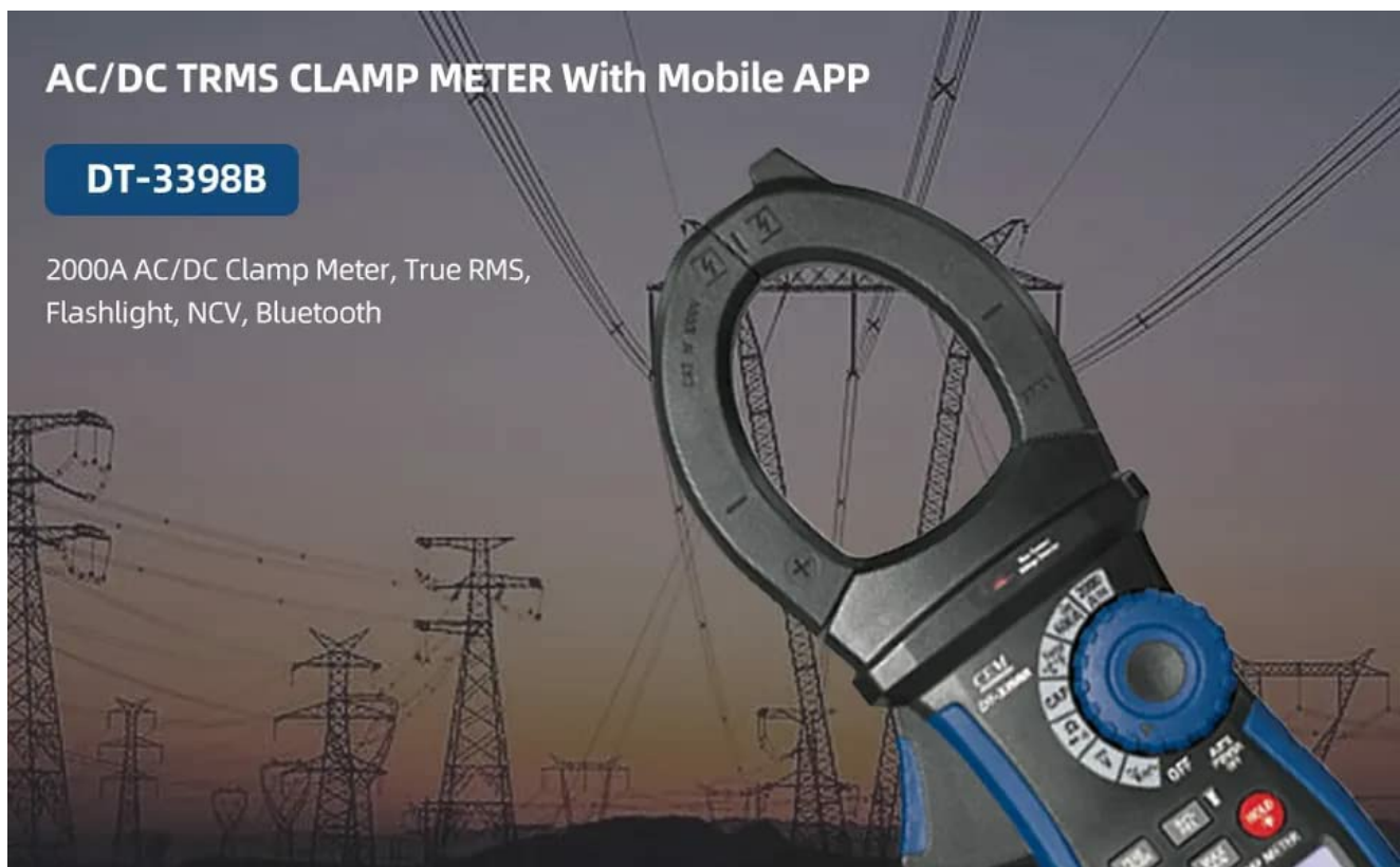
Figure 2: The DT-3398B Clamp Meter, illustrating its capability for AC/DC TRMS measurement and mobile app integration via Bluetooth.