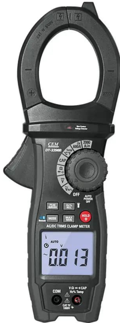
Figure 1: Front view of the CEM DT-3398B Clamp Meter, showing the display, rotary dial, and function buttons.