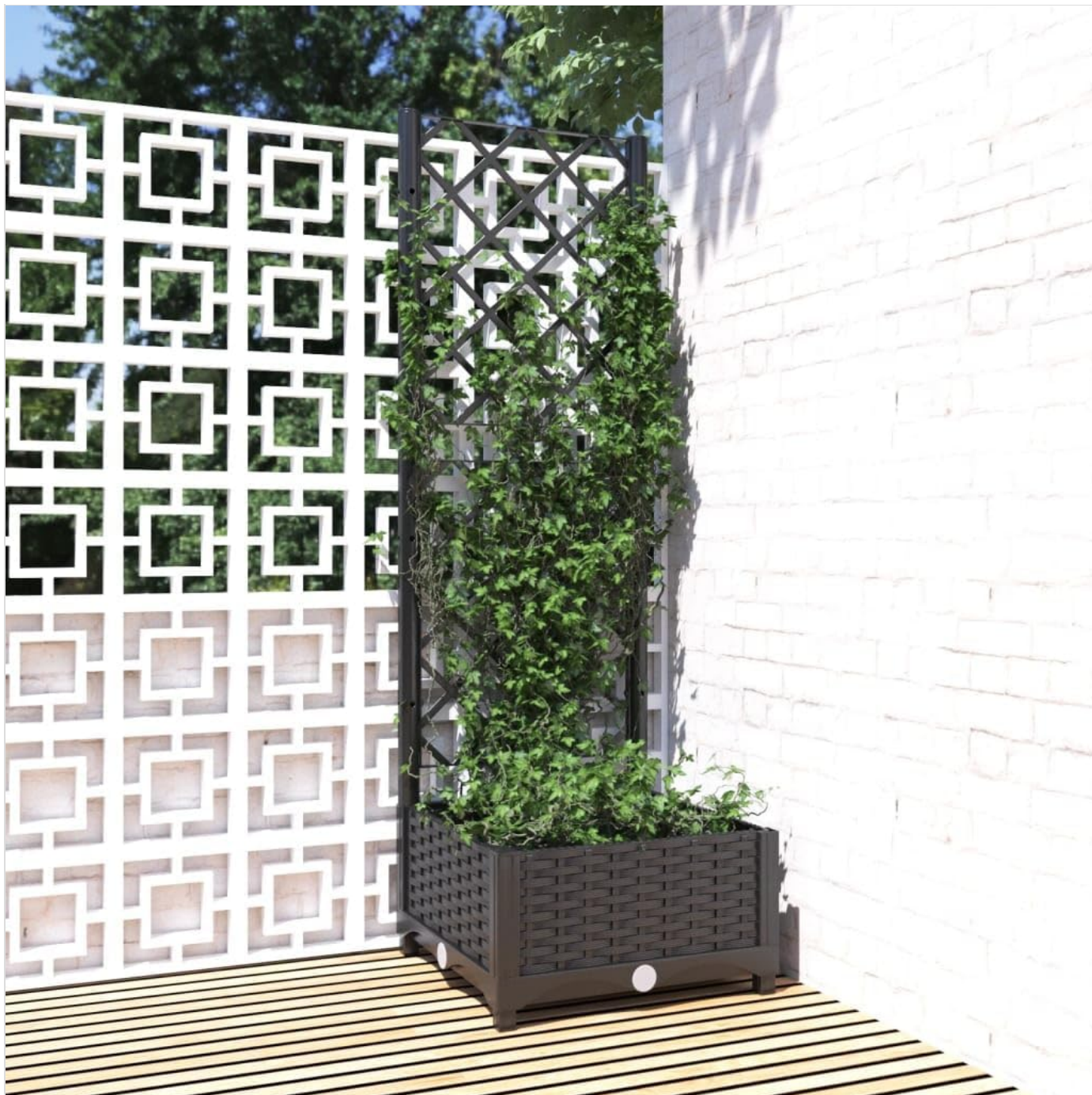
Image: The vidaXL Garden Planter with Trellis placed against a white brick wall, showcasing climbing plants growing up the trellis. This demonstrates typical outdoor usage.