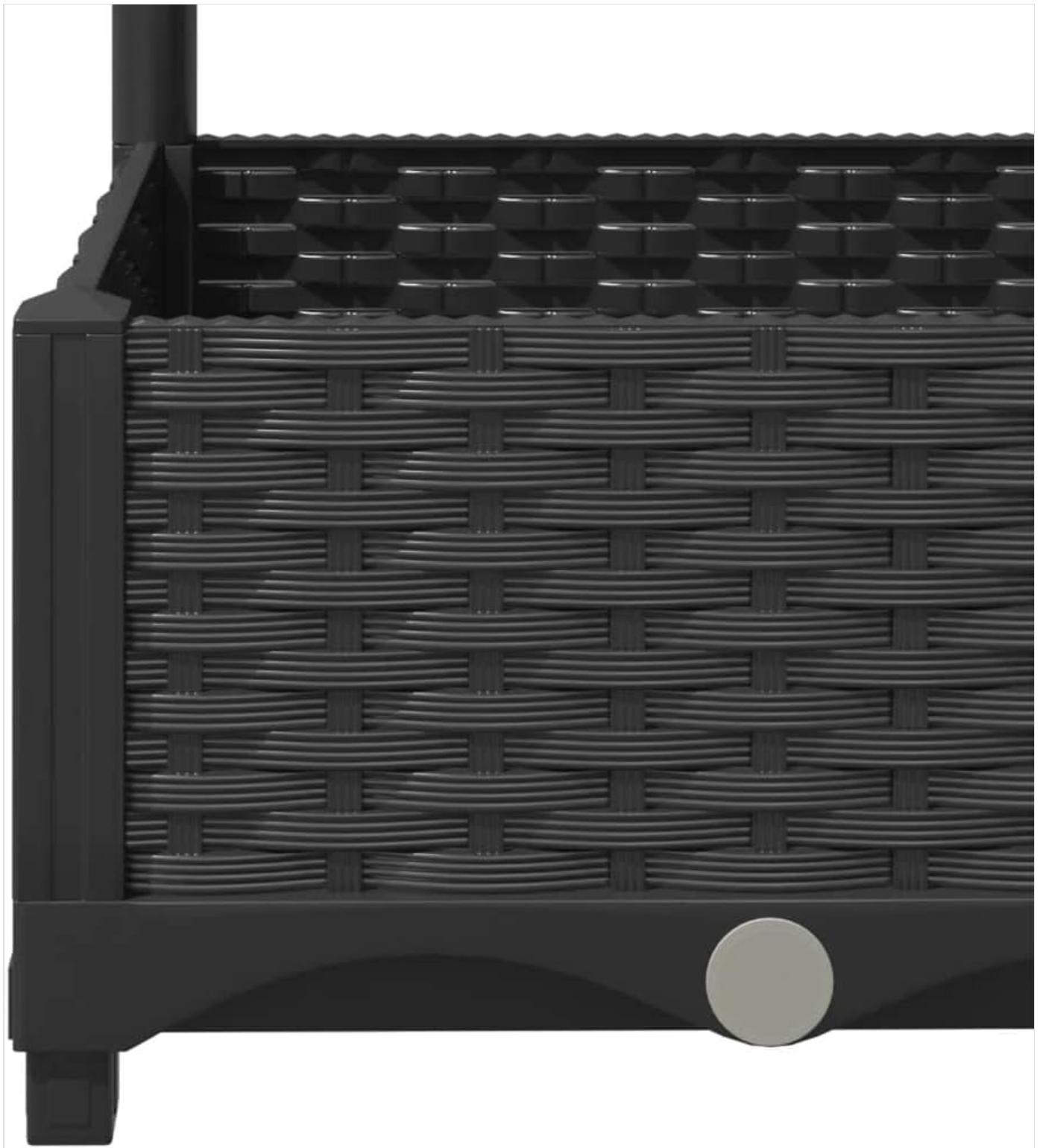
Image: Close-up view of the black polypropylene planter box, highlighting its woven texture and durable material.