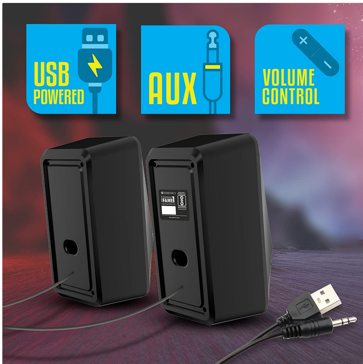
Rear view of the B.C Zeb Fame 1 speakers, illustrating the integrated USB power cable and 3.5mm audio input cable for connectivity.