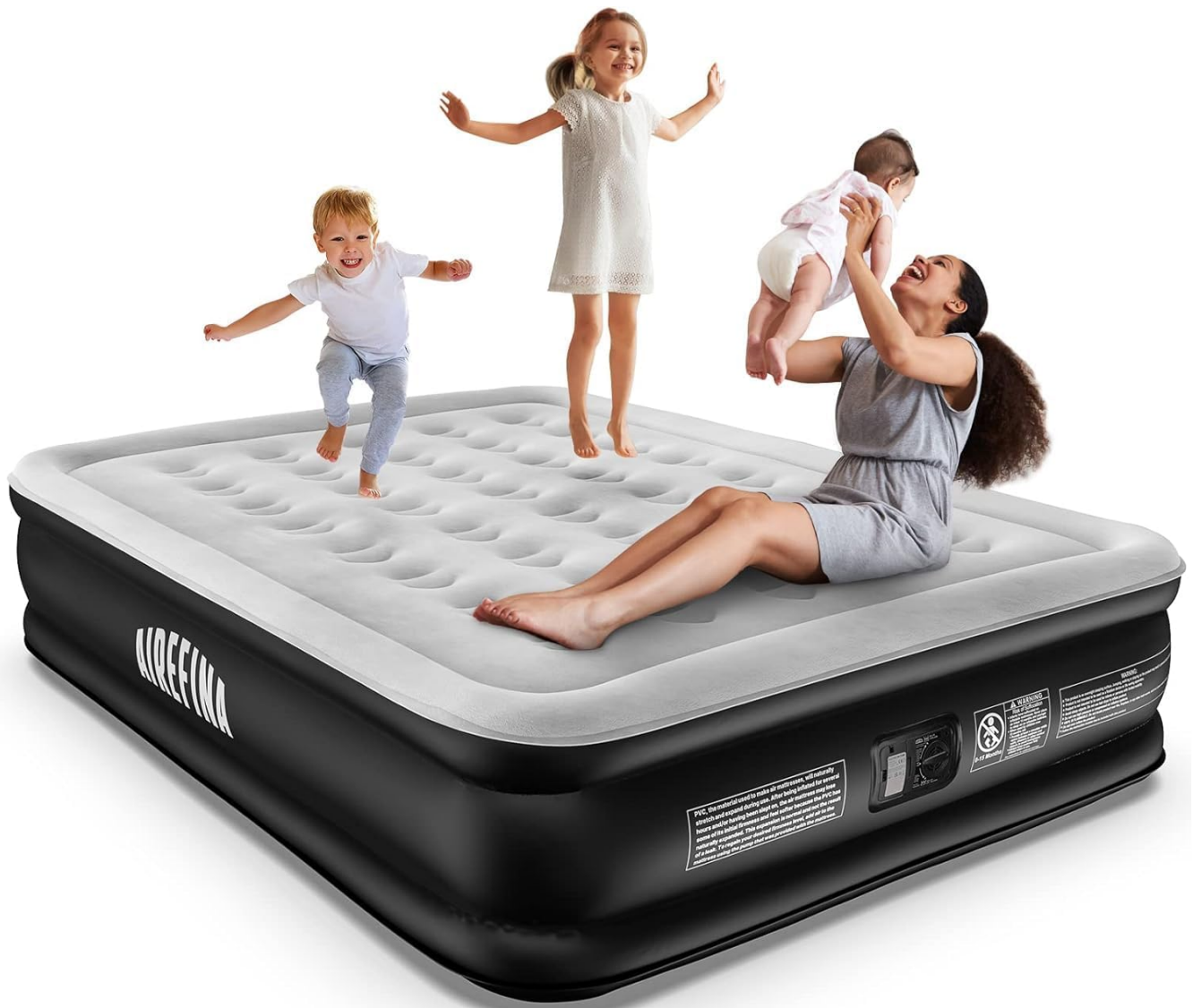
Image: Airefina Queen Air Mattress with Built-in Pump, showcasing its design and size.