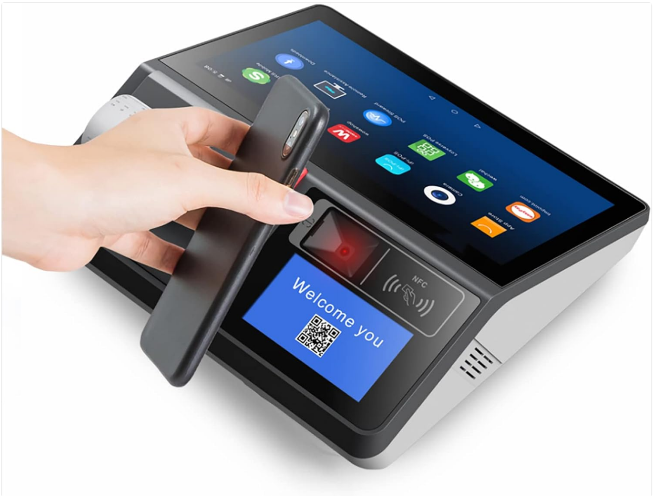
Figure 4.1: The DISHENGZHEN M10 Smart POS Terminal, showcasing its sleek design and integrated components.