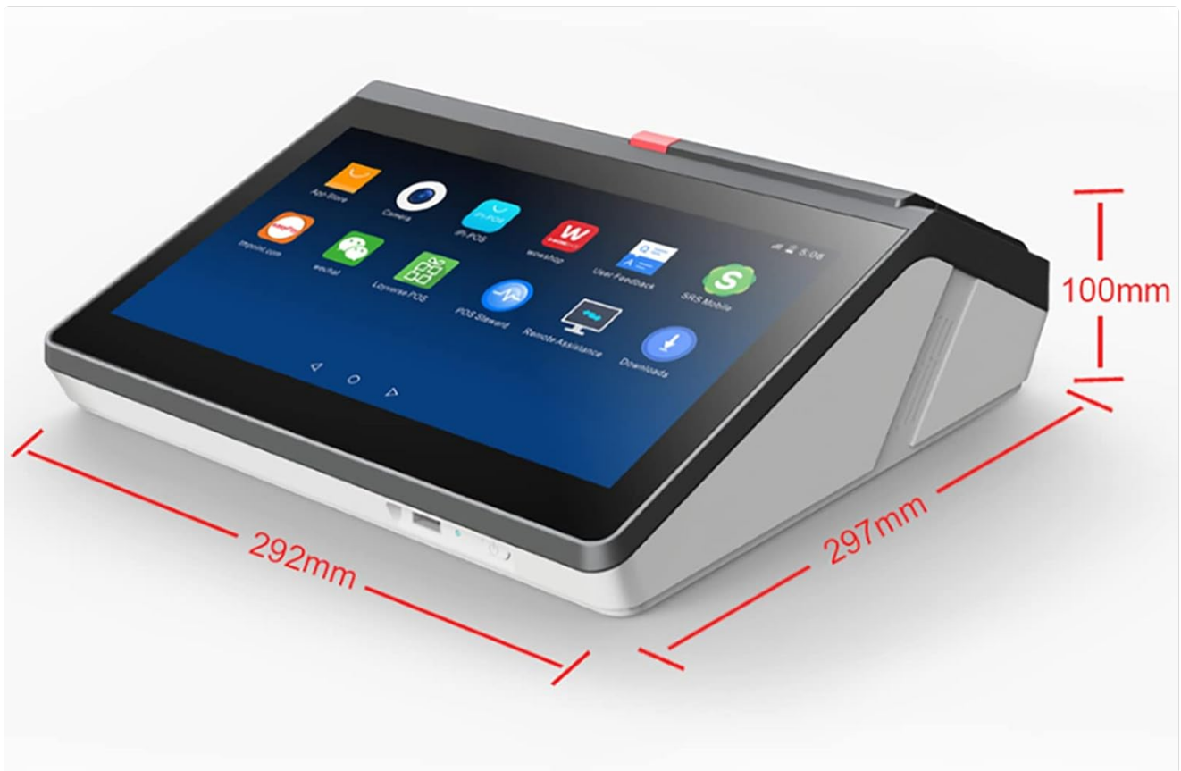
Figure 4.7: The DISHENGZHEN M10 terminal displaying the Android operating system interface, showing its versatility for Android-based POS applications.