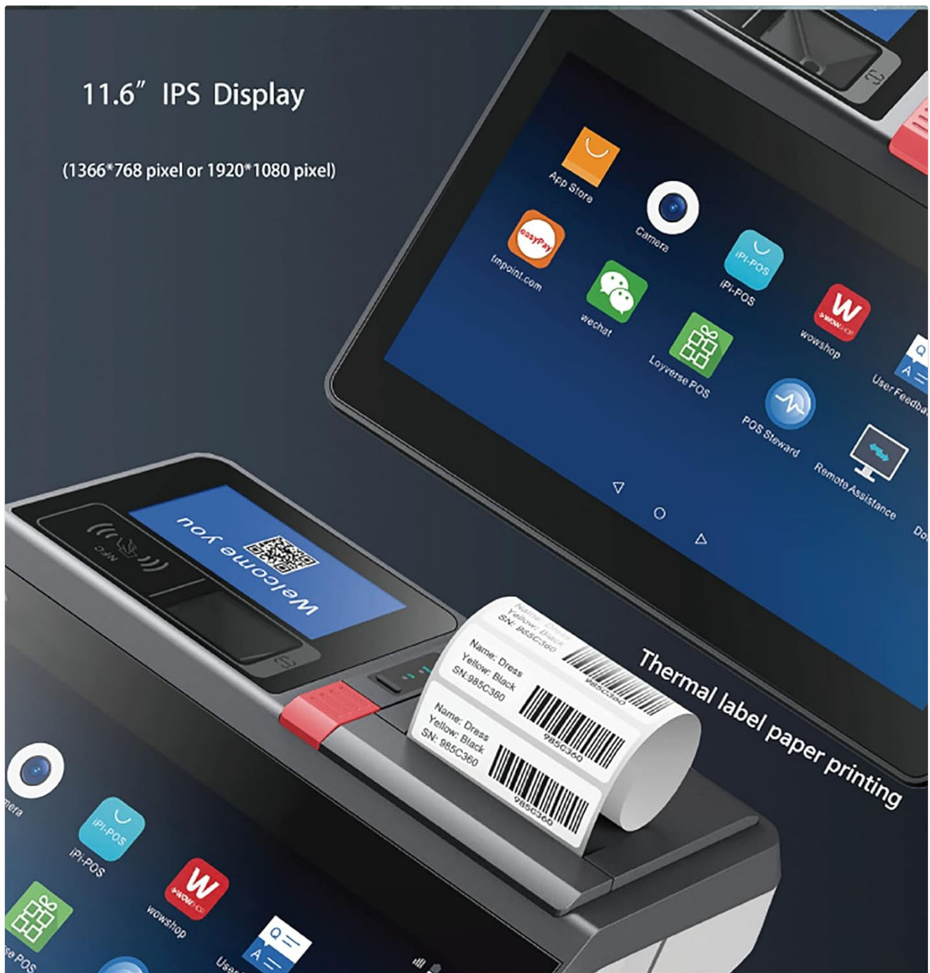
Figure 4.4: An illustrative diagram highlighting key features such as the 11.6-inch IPS Capacitive Touch screen, Windows 10/Android OS, 80mm Receipt Thermal Printer with Autocutter, and optional components like 1D/2D barcode scanner, NFC, and 4.3-inch LCD Display.