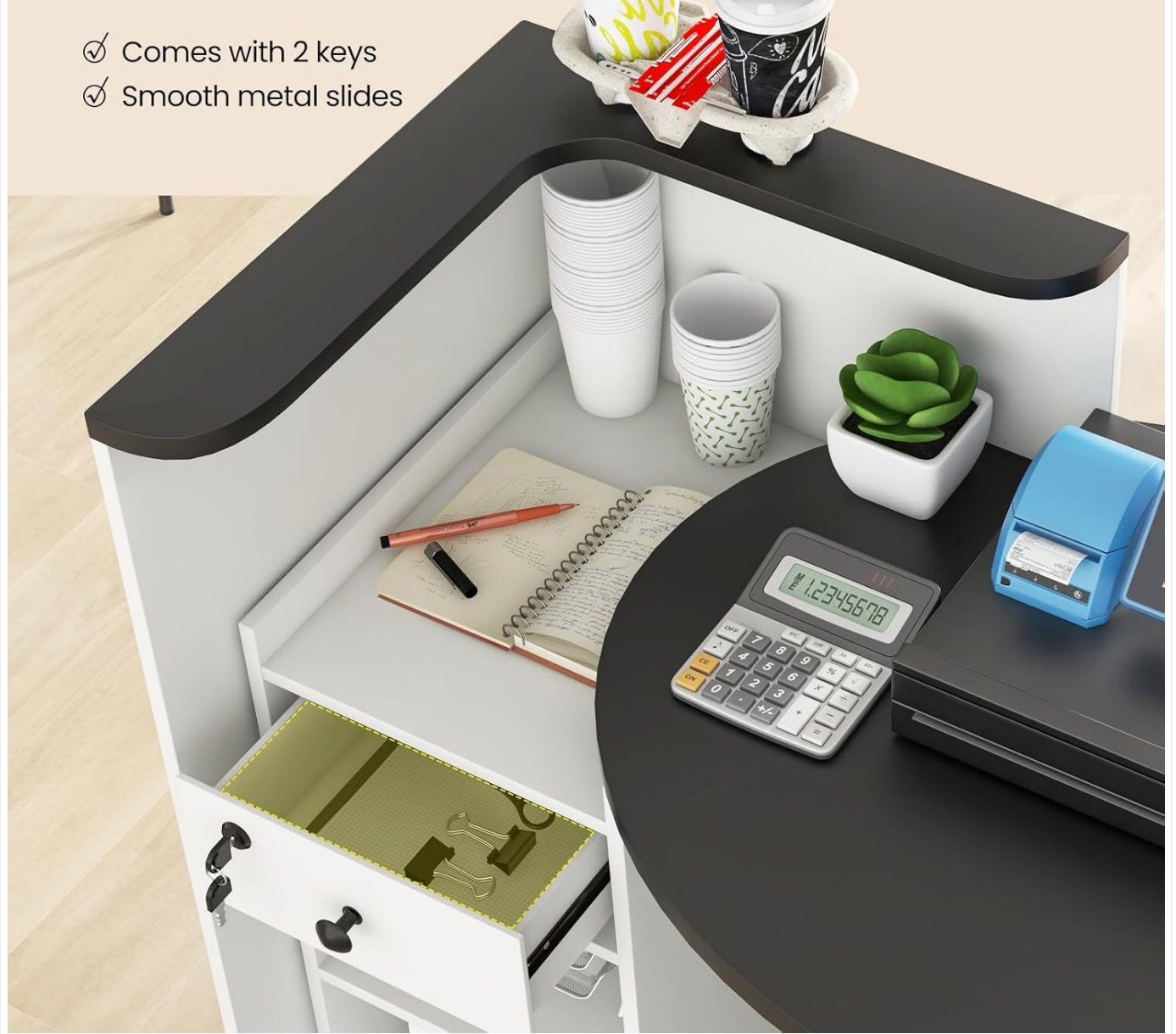
Figure 4: Customize your storage space with the adjustable shelf to keep sundries tidy and organized.