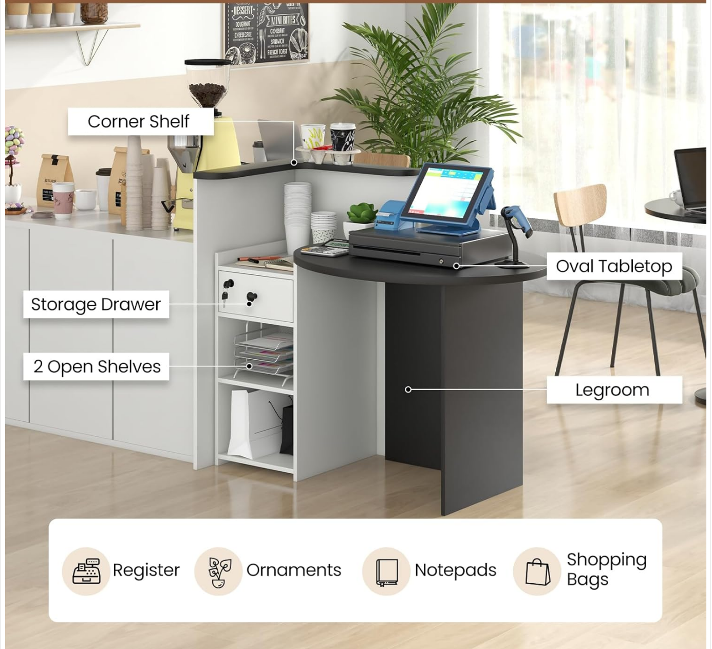
Figure 5: Overview of the desk's multiple storage options including corner shelf, storage drawer, and open shelves.