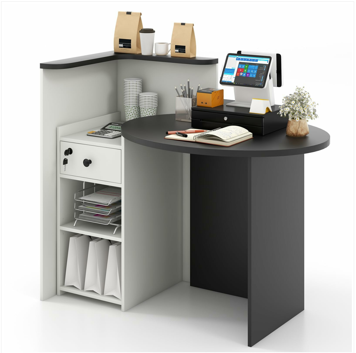
Figure 1: IFANNY 48-inch L-Shaped Reception Desk (Black & White model)

This versatile desk features a robust and stable structure made from thickened engineered wood, ensuring durability. It includes a private lockable drawer for securing valuables and diversified storage space with an L-shaped top shelf and 2-tier open shelves, including a 3-position adjustable shelf for customizable organization. The smooth, waterproof surface allows for easy maintenance.