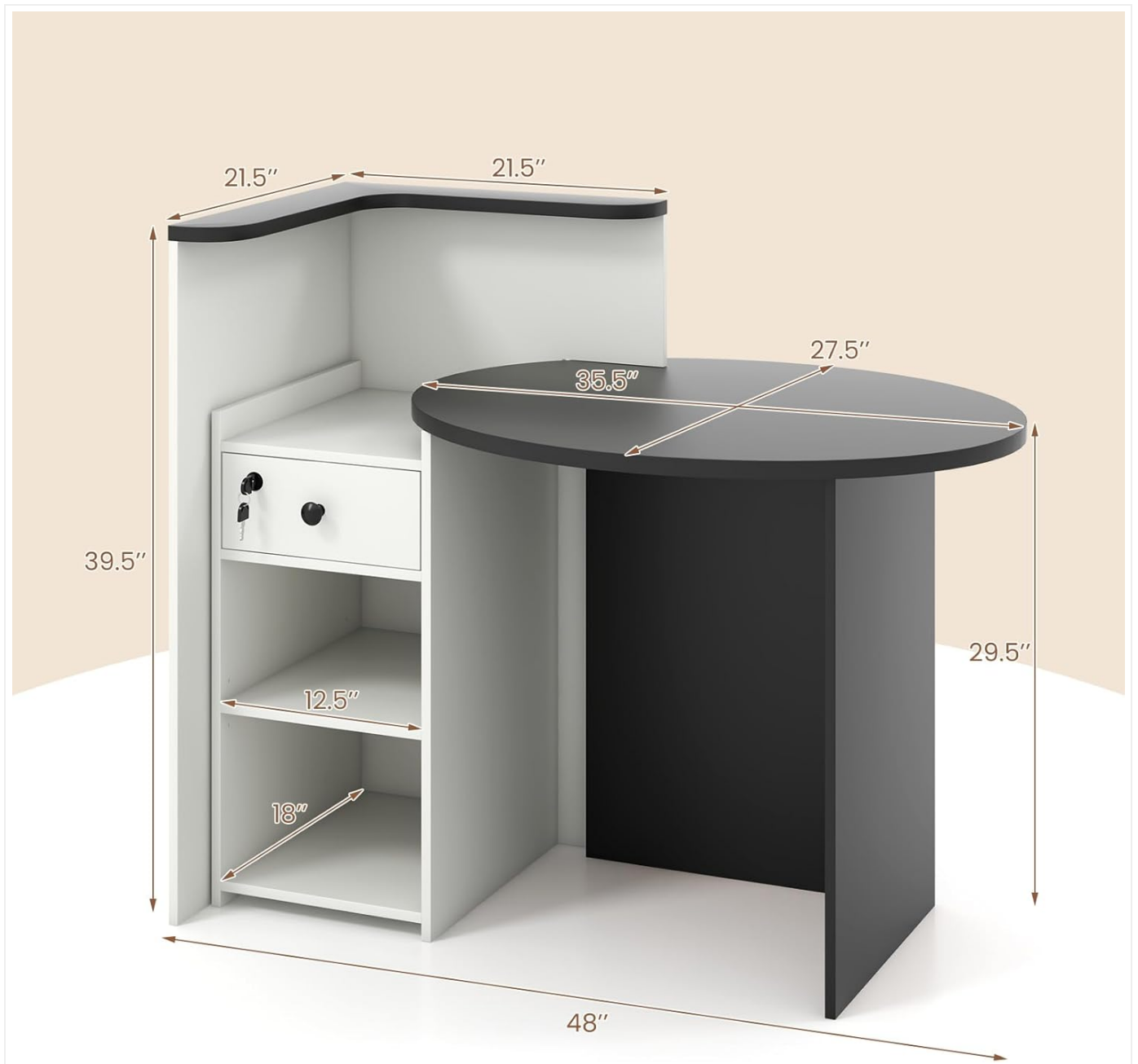
Figure 2: Detailed dimensions of the reception desk components for accurate assembly.