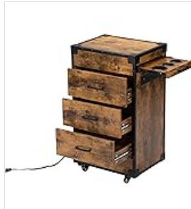
Figure 6: Three open shelves for easy access.