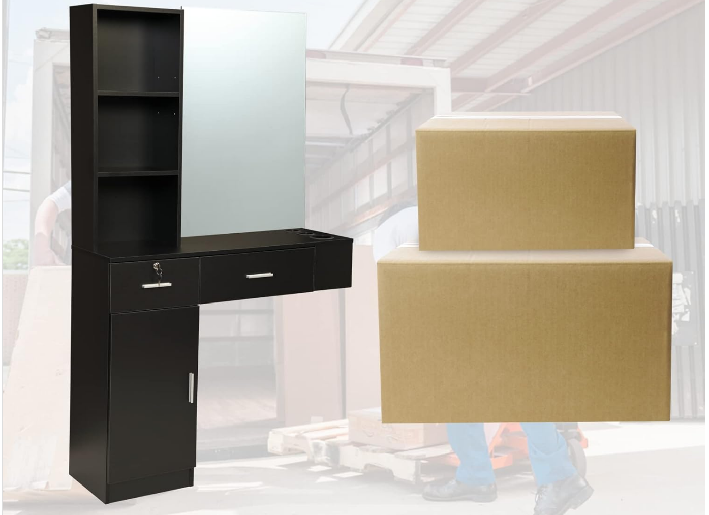
Figure 2: Packaging illustration, showing the product is shipped in two separate packages with the mirror protected by foam.

The item is transported in two packages. The mirror will be placed in a foam model and secured with tape to prevent damage