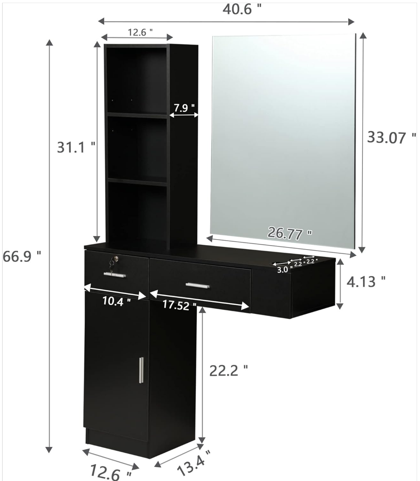
Figure 5: Product dimensions.