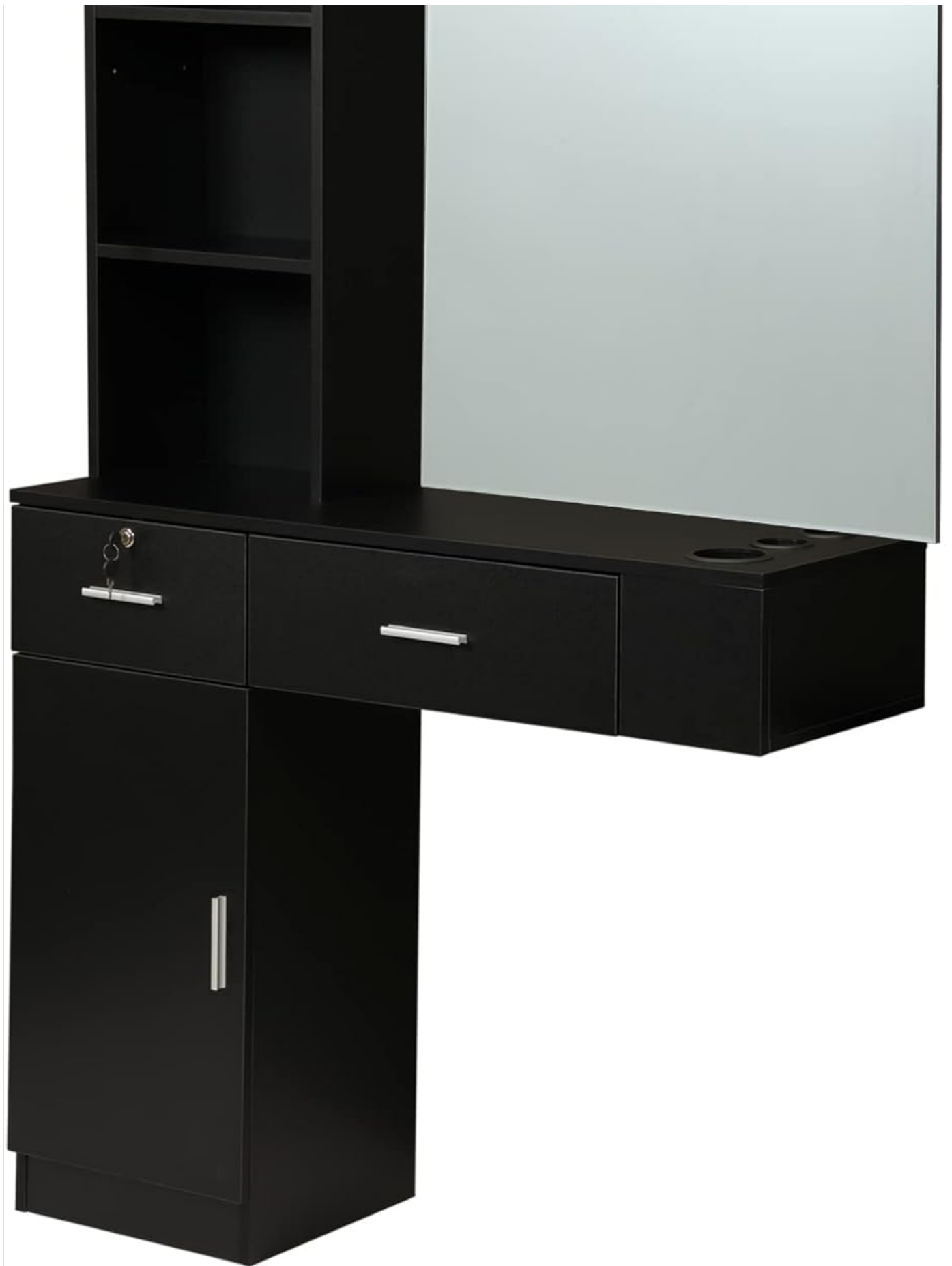
Figure 3: The RESHABLE Wall Mount Salon Station with Mirror.