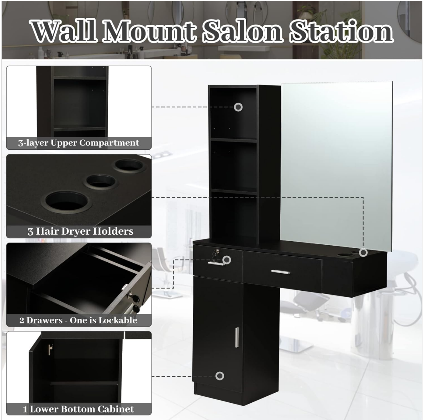
Figure 4: Detailed view of the station's storage features.