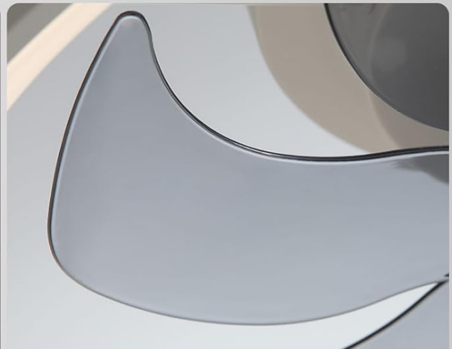
ABS Fan Blades