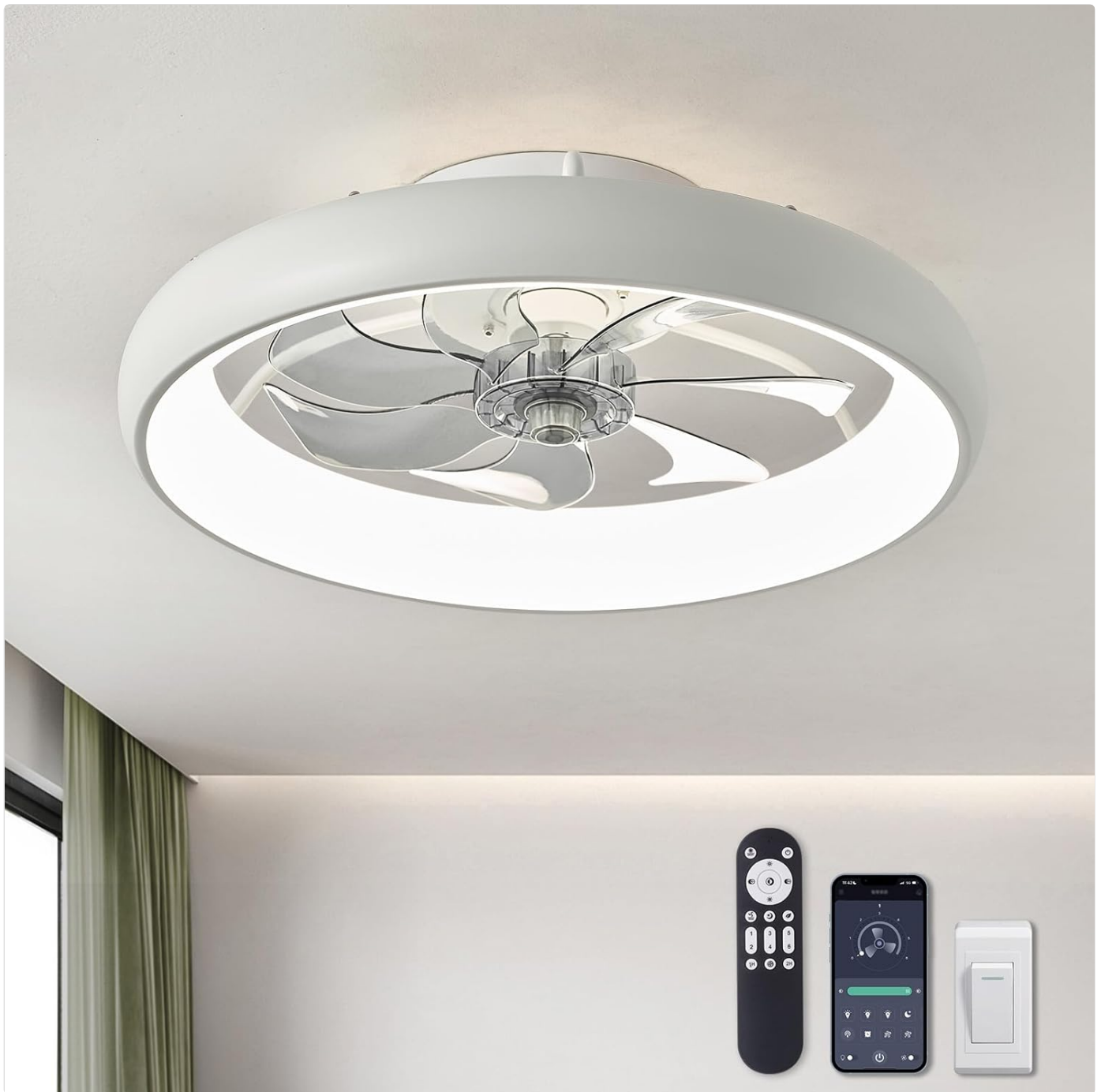
Image 1.1: LUDOMIDE Modern Dimmable LED Ceiling Fan with remote and app control.