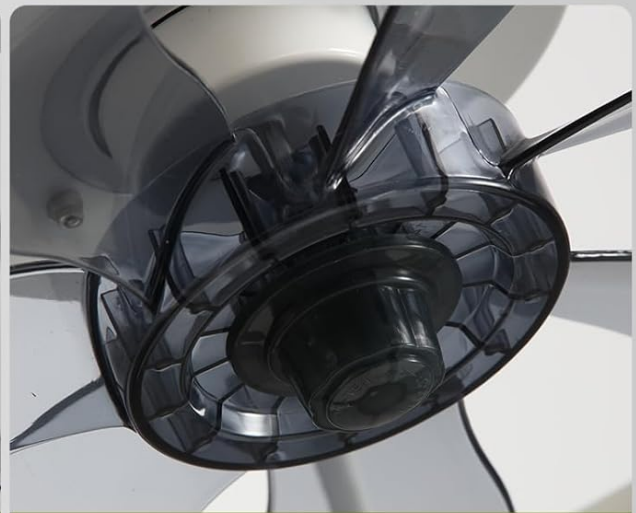
DC 100% Copper Motor