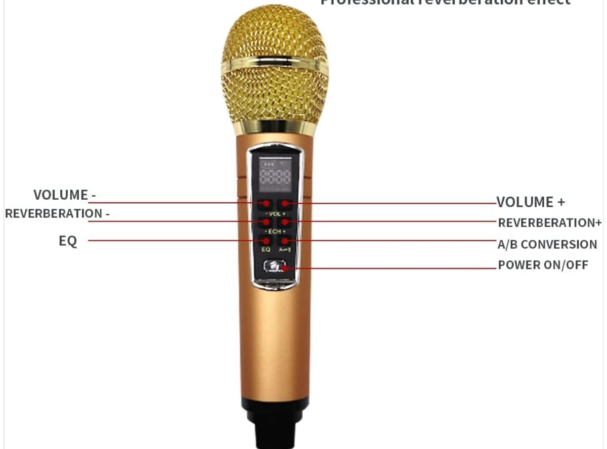
Image: Detailed view of one of the wireless microphones, highlighting its control buttons and display.

Each wireless microphone includes controls for individual adjustments: