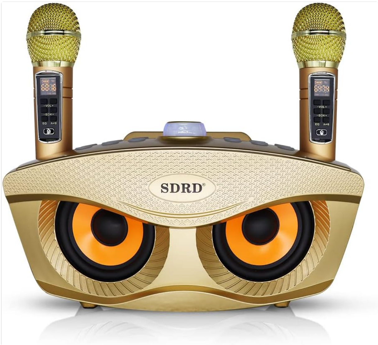
Image: Front view of the SDRD-306 Plus karaoke machine, featuring two main speakers and two wireless microphones docked on top.