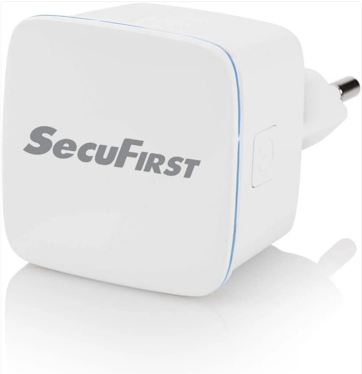
Figure 1.1: Front view of the SecuFirst REP240 Wi-Fi Repeater, showing its compact design.