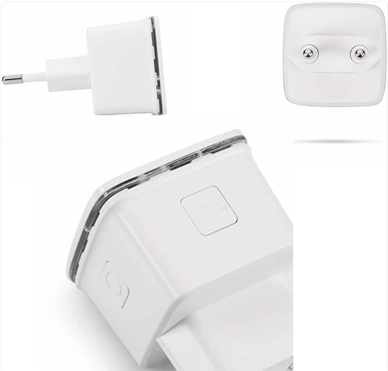
Figure 1.2: Various angles of the REP240, highlighting its plug and side features.

The REP240 features a compact wall-plug design that avoids obstructing adjacent outlets. It includes a WPS button for quick setup and an Ethernet port for wired connections or Access Point mode.