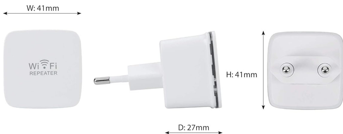
Figure 1.4: Dimensions of the SecuFirst REP240, showing its width (W: 41mm), height (H: 41mm), and depth (D: 27mm).