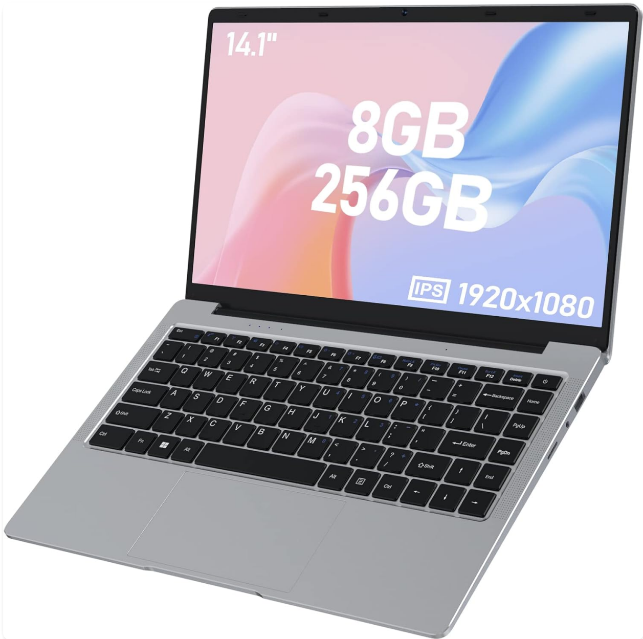
Figure 4.3: The laptop's IPS display and flexible hinge design.