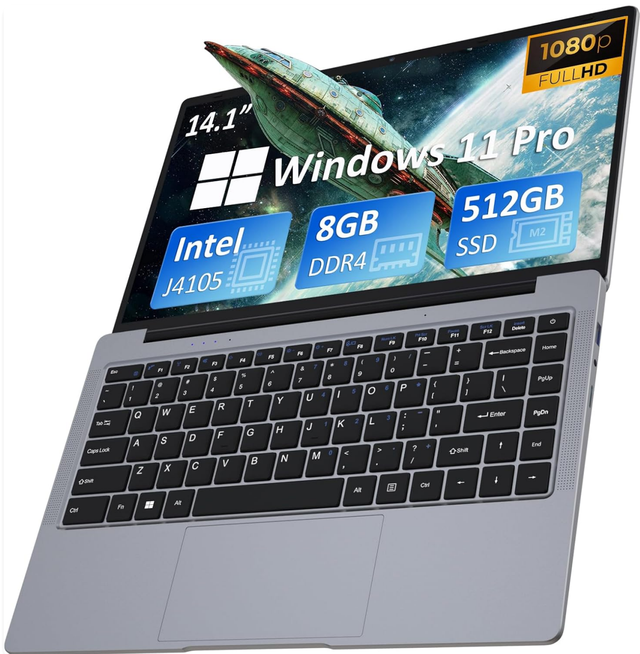
Figure 1.1: Aorus 14.1" Laptop and included accessories.