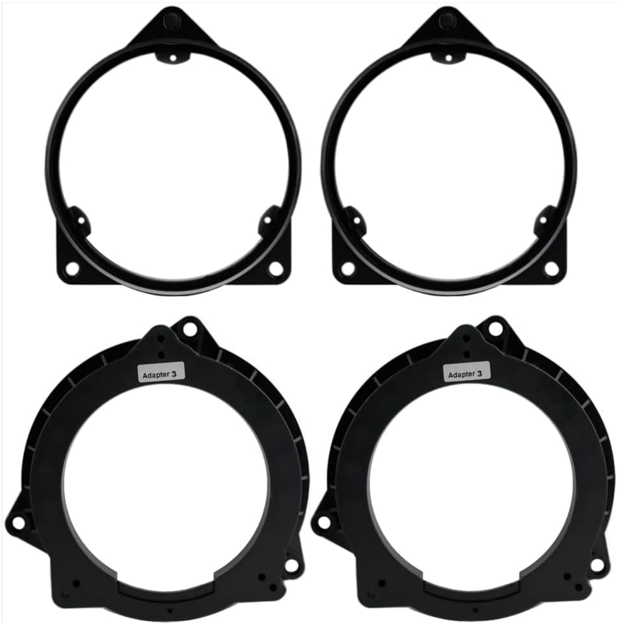
Image: Four black plastic mounting adapters, two labeled "Adapter 3", designed for speaker installation.