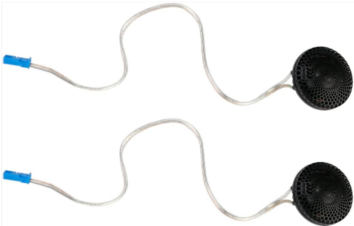
Image: Two Morel Acuflex Silk Dome Tweeters, each with attached wiring and blue connectors.