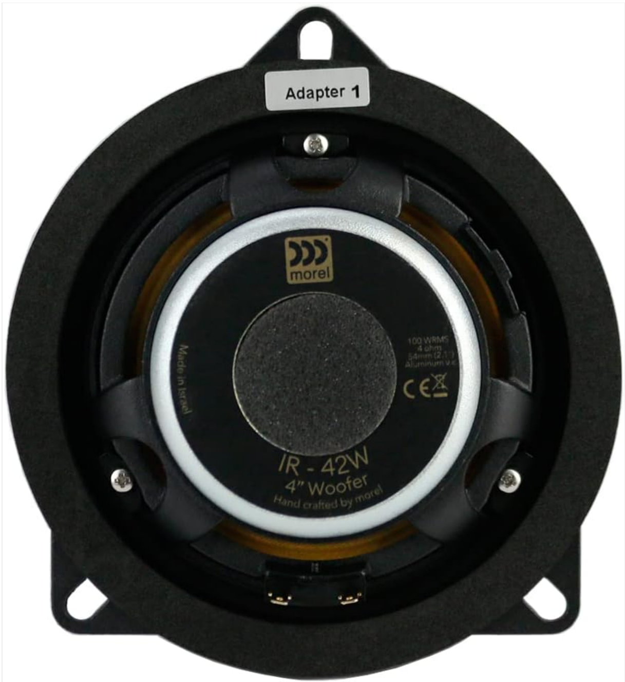
Image: Rear view of the Morel IR-BMW42 4-inch woofer, showing the magnet structure, terminals, and "Adapter 1" label.