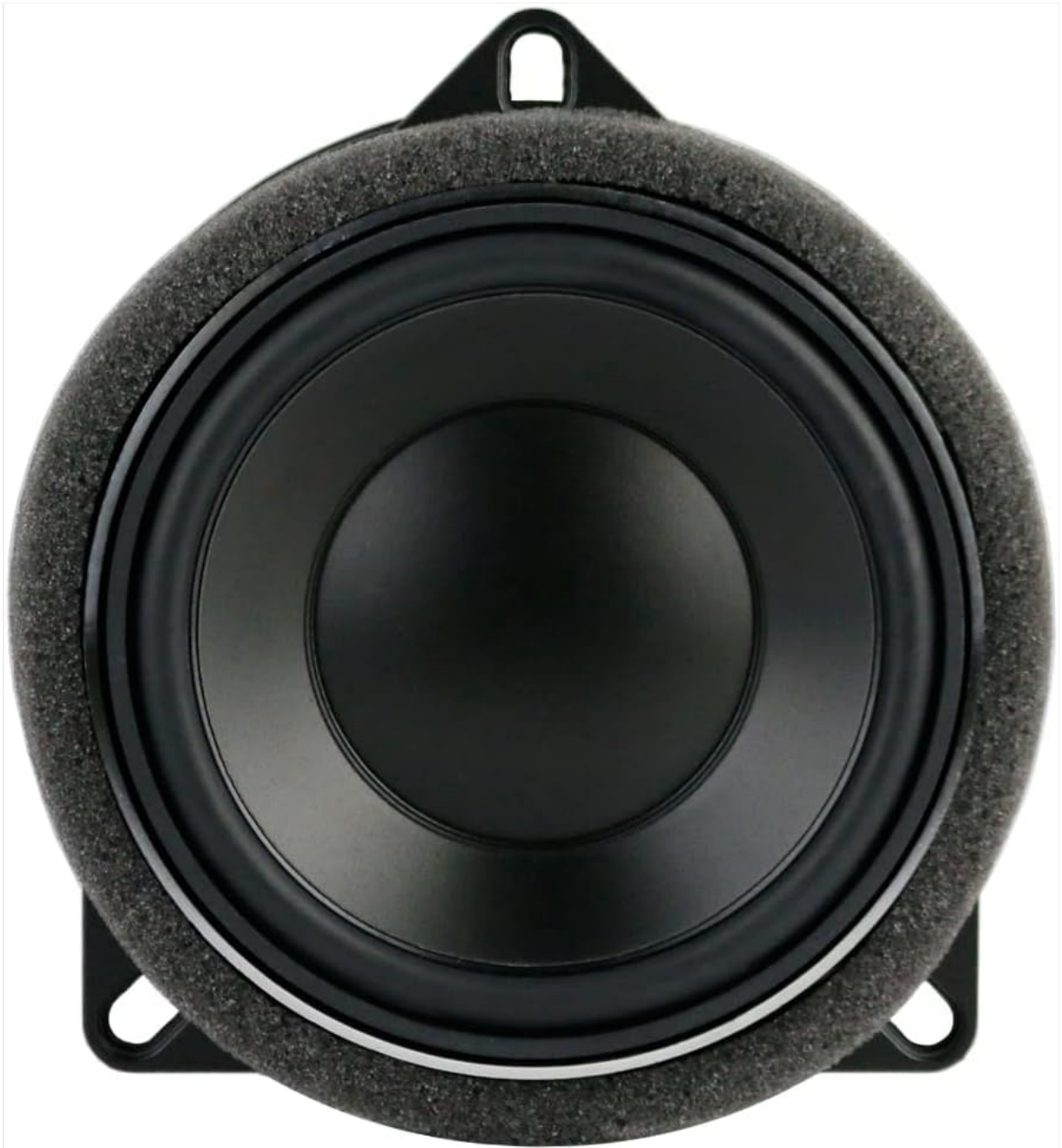
Image: Front view of the Morel IR-BMW42 4-inch woofer with a black cone and foam surround.