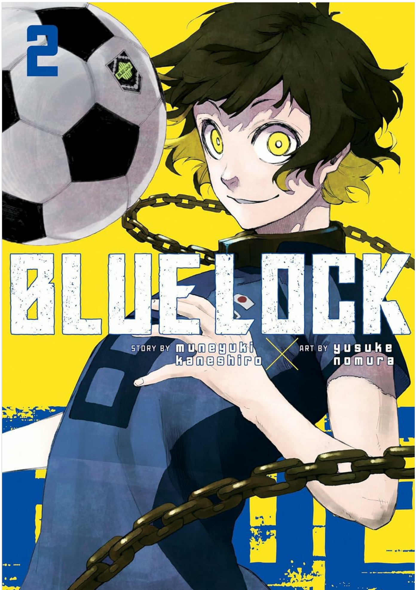
Figure 2.2.2: Cover of Blue Lock Manga Volume 2. This image displays the front cover of the second volume, featuring another character from the series.