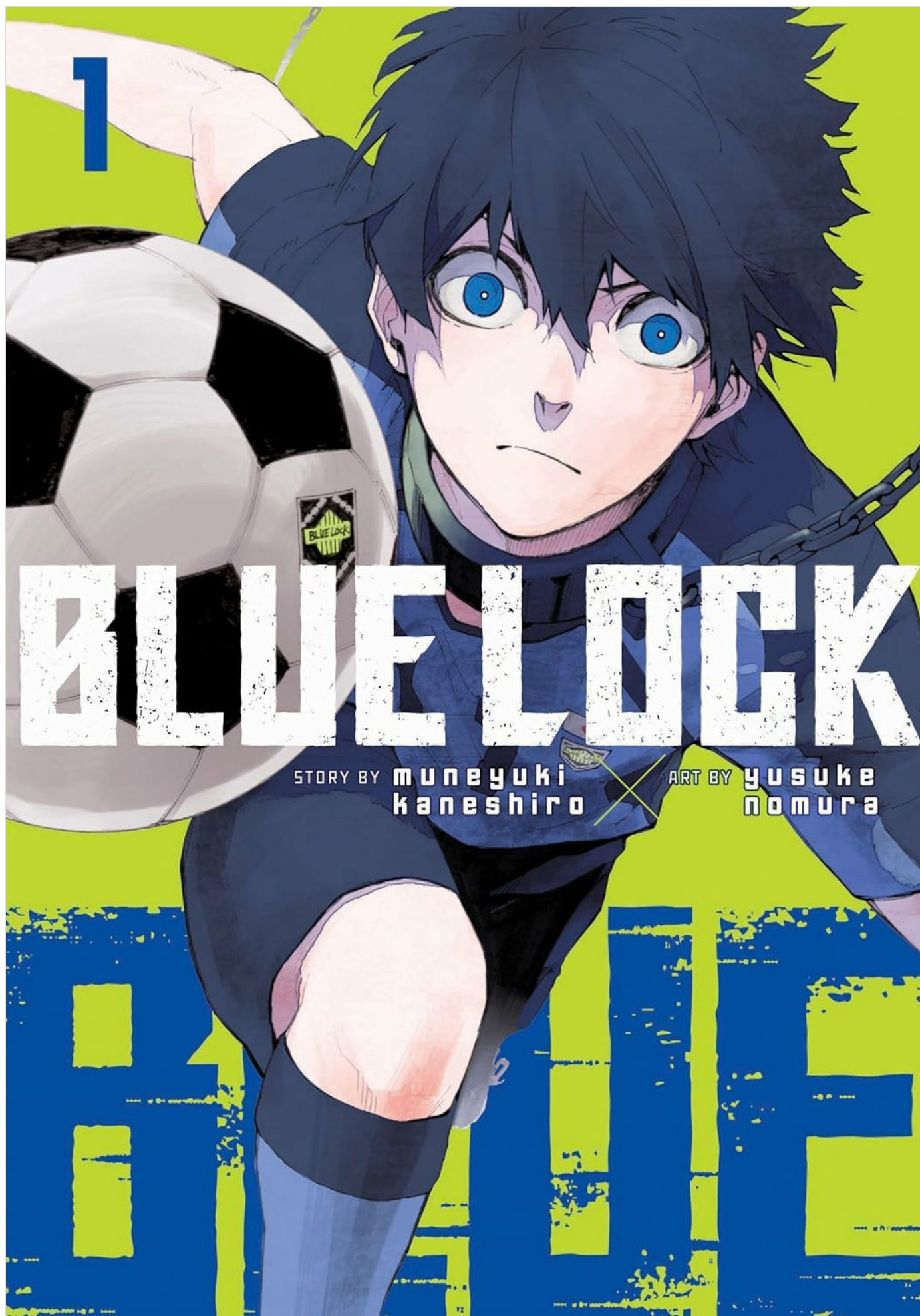
Figure 2.2.1: Cover of Blue Lock Manga Volume 1. This image displays the front cover of the first volume, featuring the main character Yoichi Isagi with a soccer ball.