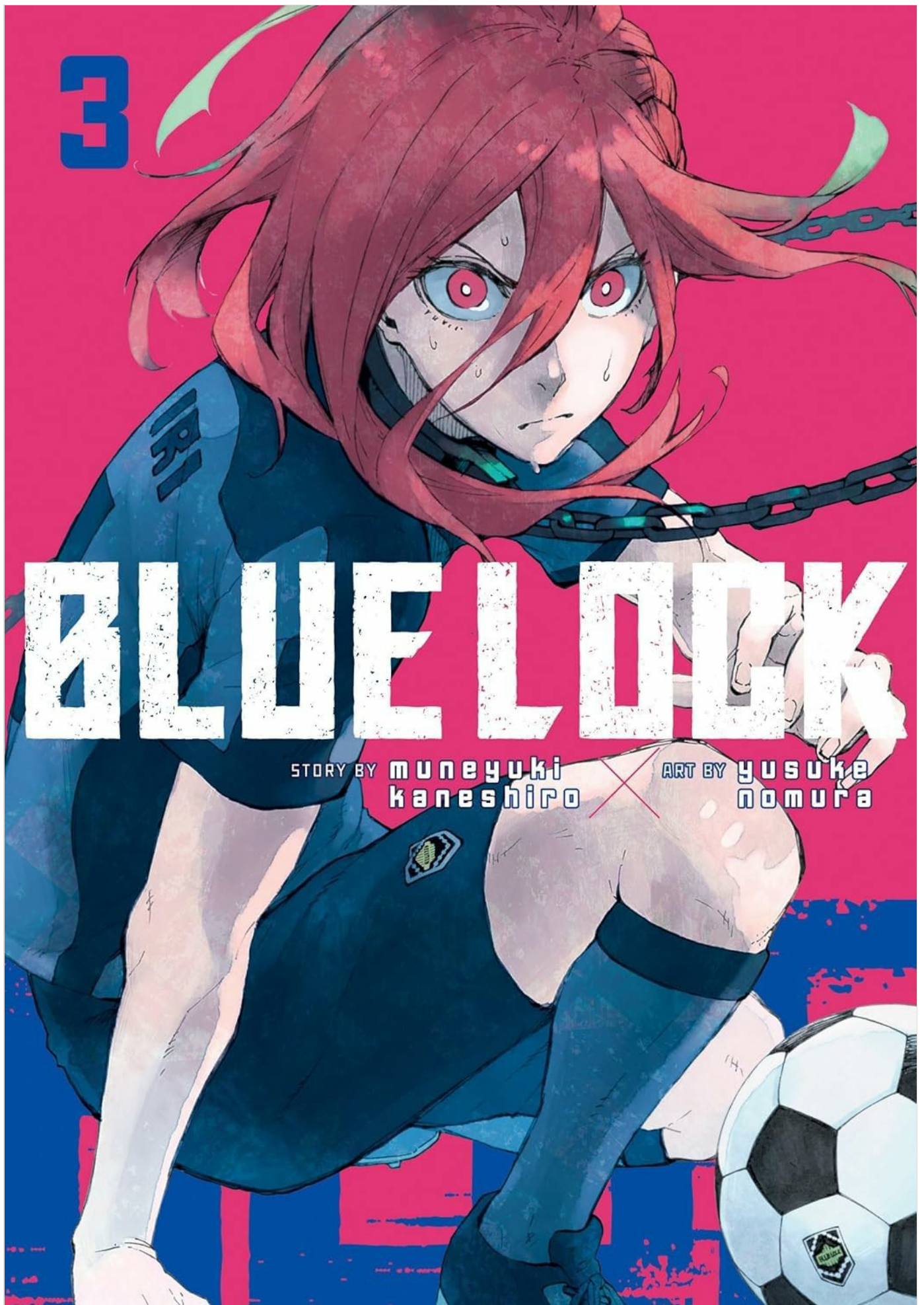
Figure 2.2.3: Cover of Blue Lock Manga Volume 3. This image displays the front cover of the third volume, featuring a character with red hair.