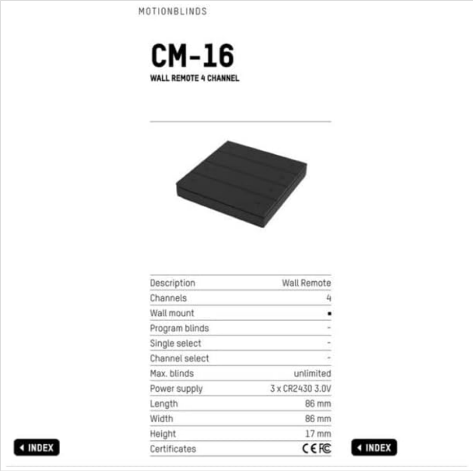
Figure 4: Detailed specifications for the MotionBlinds CM-16-BK Wall Remote. This table provides comprehensive technical data including channels, power supply, dimensions, and certifications.