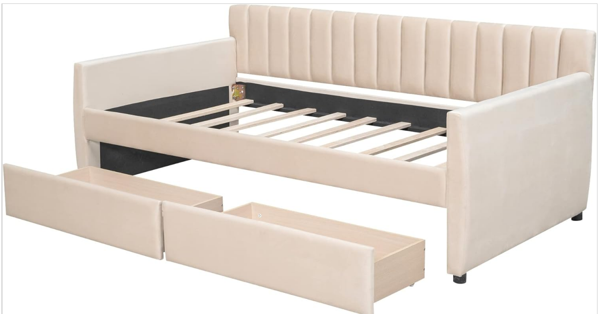
Image: The daybed with its two storage drawers fully extended, showing their capacity and design.

Assemble the two storage drawers according to their specific instructions. This usually involves attaching the front, back, and side panels, then installing the bottom panel and wheels/glides.