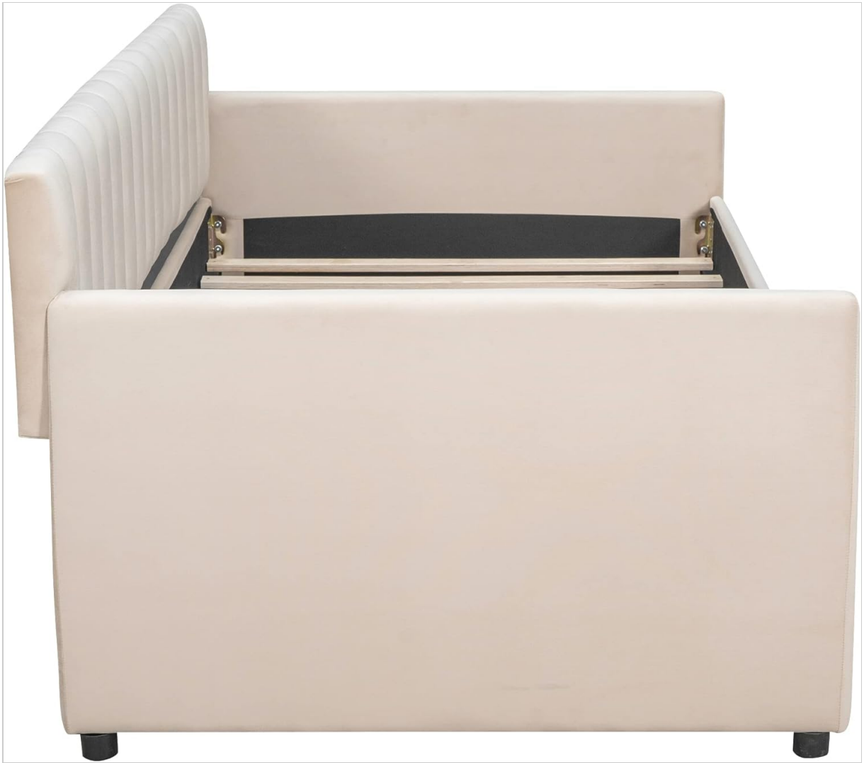
Image: Side view of the daybed frame, illustrating the placement of the wooden slats that support the mattress.