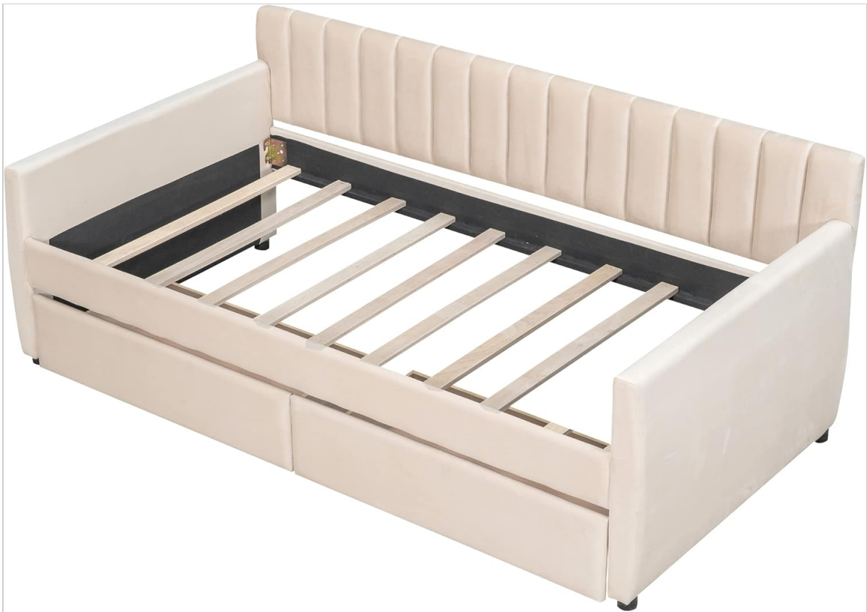
Image: Rear view of the daybed frame, showing the upholstered back panel and the attachment points for the side rails.