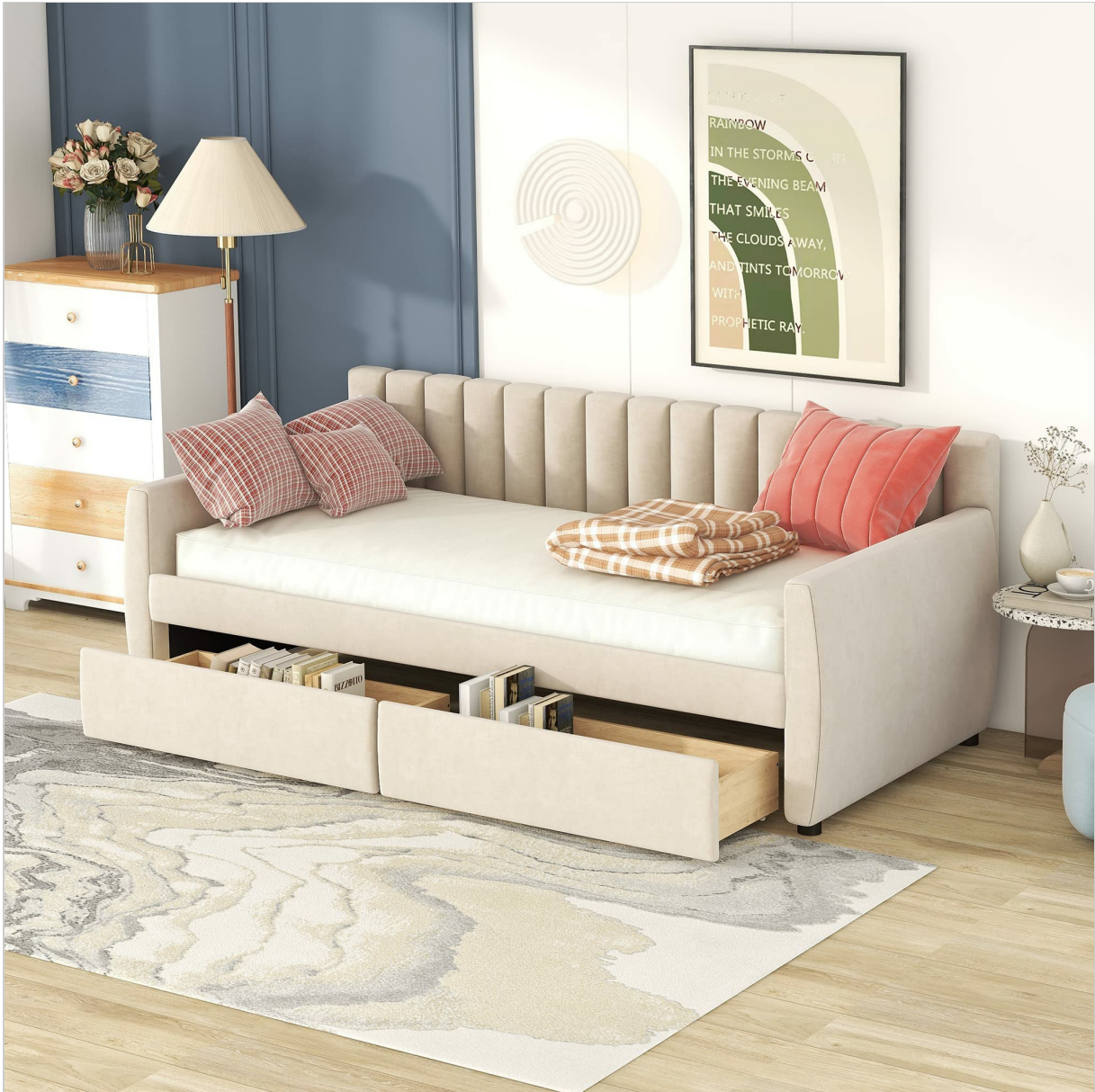
Image: Overall dimensions of the SOFTSEA Twin Daybed with Storage Drawers. The daybed measures 79.9 inches in length, 41.3 inches in width, and 31.9 inches in height. The storage drawers are also detailed with their respective dimensions.