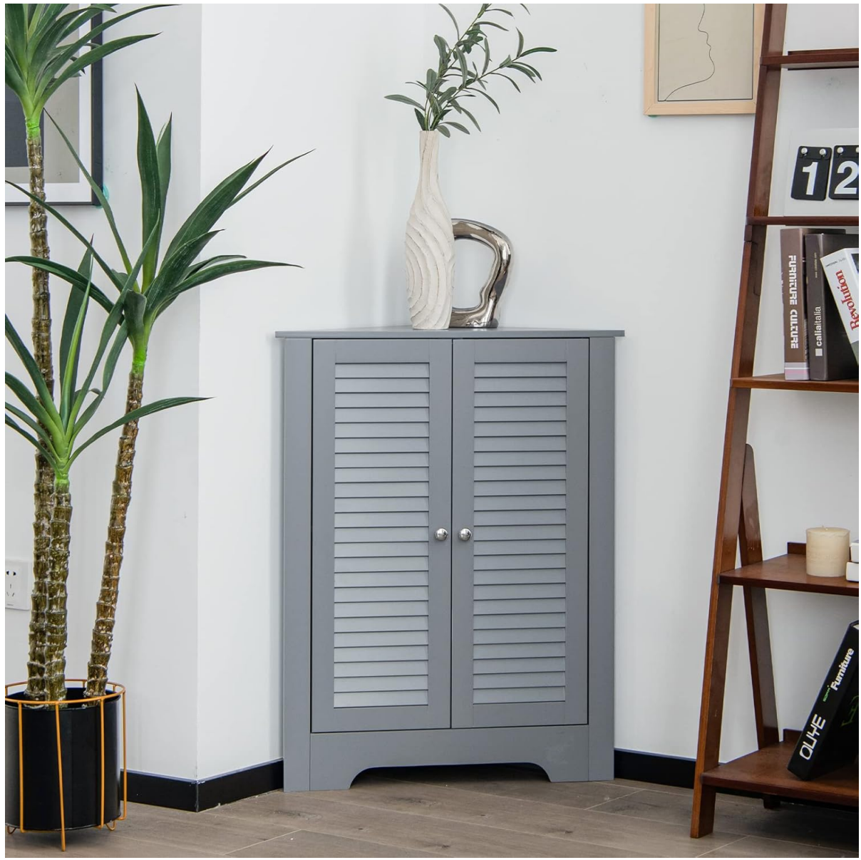
Image 1.1: The COSTWAY Wooden Corner Cabinet, fully assembled and placed in a room corner.