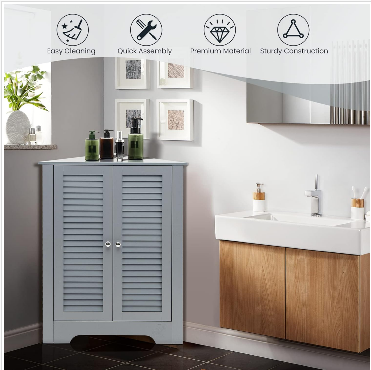
Image 3.1: Icons highlighting key features: Easy Cleaning, Quick Assembly, Premium Material, and Sturdy Construction.