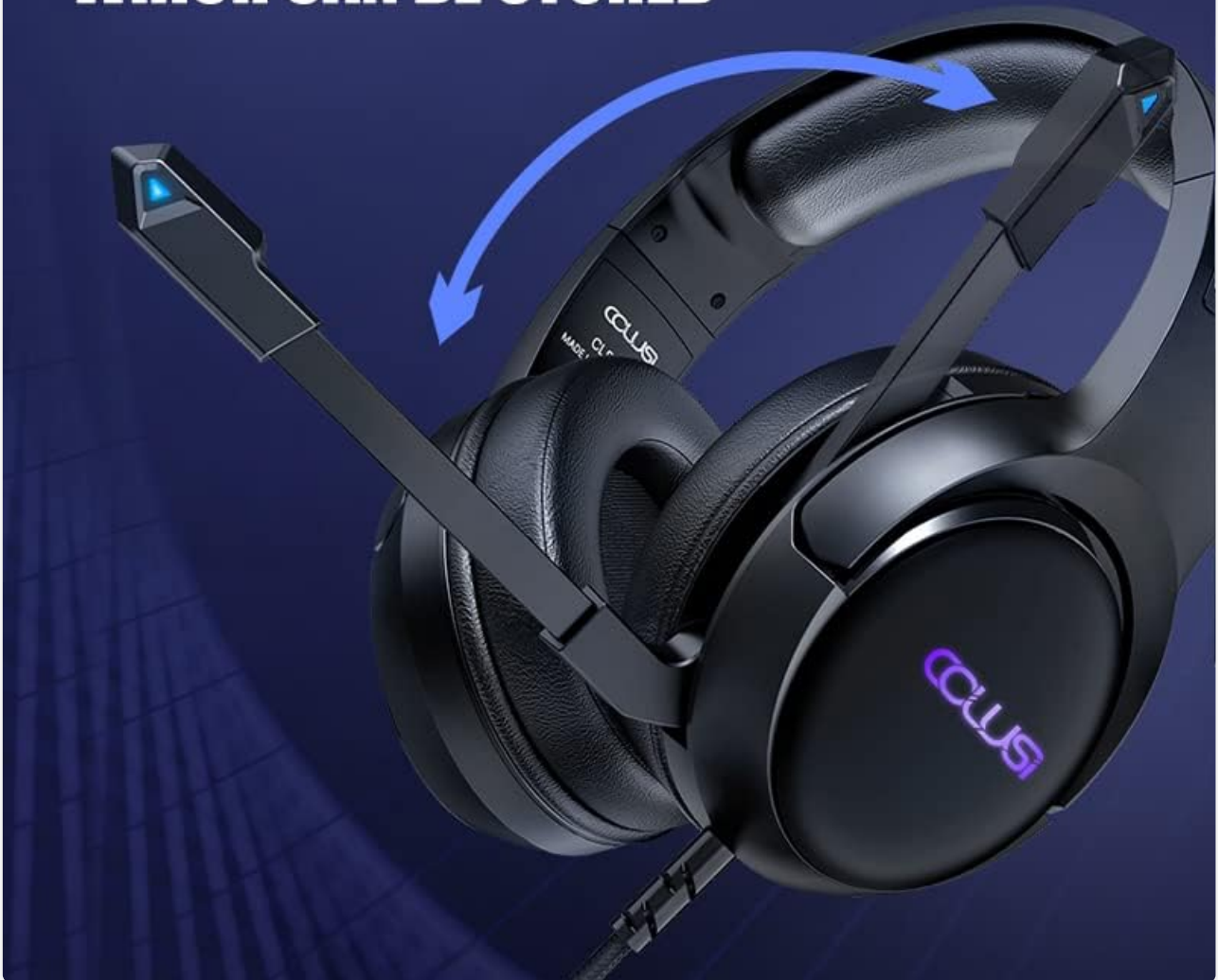
Figure 3.3: The hidden-type design microphone can be conveniently stored when not in use.