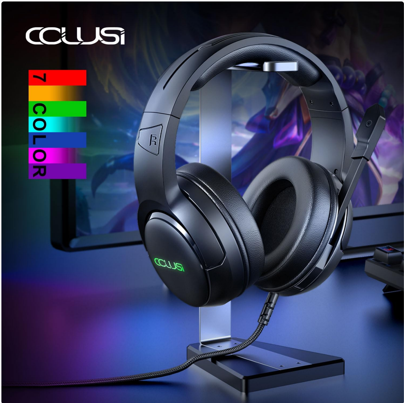
Figure 5.1: The C600 headset features vibrant 7-color LED lighting when connected via USB.