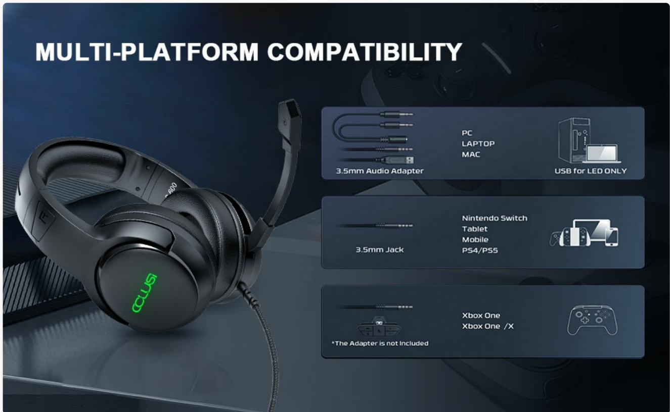
Figure 4.1: Diagram illustrating multi-platform compatibility and connection methods for various devices.