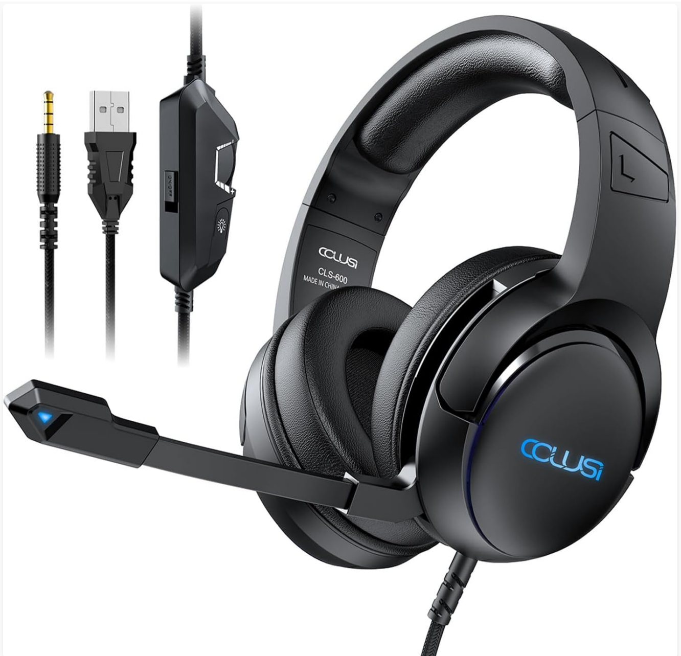
Figure 3.1: COLUSI C600 Wired Gaming Headset showing the headset, 3.5mm audio jack, USB connector, and in-line control unit.