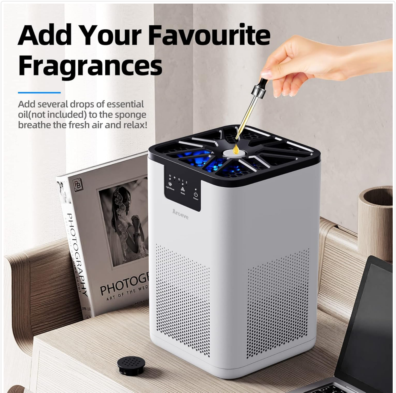
Image: A hand carefully adding essential oil to the designated aromatherapy pad on the top of the air purifier.

Add several drops of essential oil(not included) to the sponge breathe the fresh air and relax!