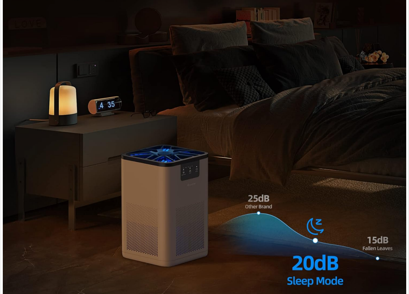
Image: The air purifier positioned in a bedroom, demonstrating its quiet operation in sleep mode at 20dB.

Filtering the air with the lowest noise level of 20dB , it is perfect for a restful and soothing indoor environment.