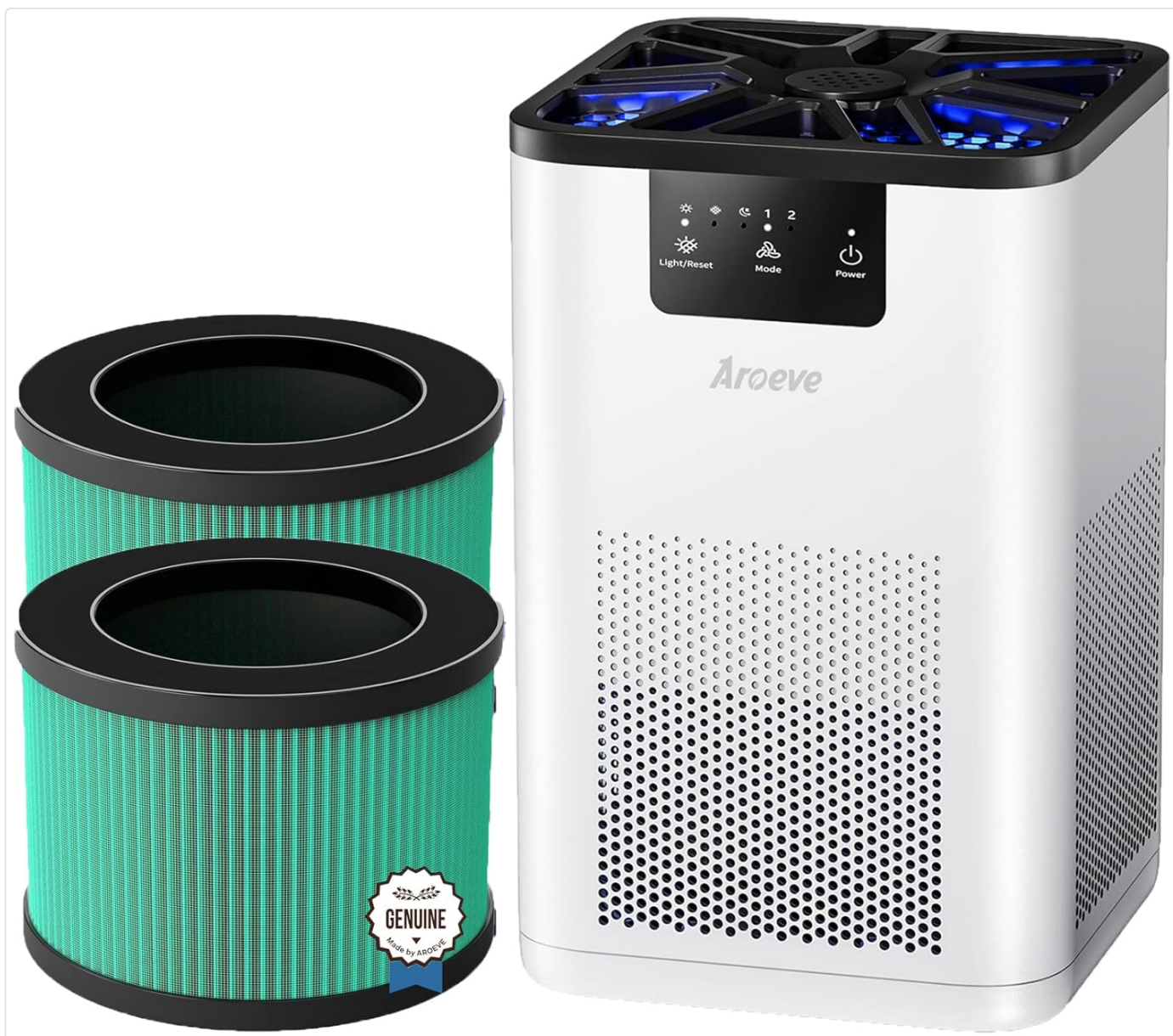
Image: The AROEVE Air Purifier MK06 unit shown alongside two replacement filters, highlighting the product's main components.