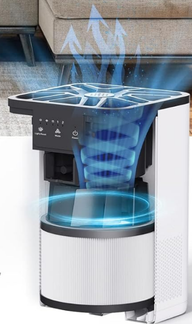
Image: The air purifier operating in a living room, illustrating its 360-degree air circulation capability.

With air spiral technology and 360-degree air outlets, the purifier refreshes air per hour in rooms up to 215ft 2 , which is 25% more efficient than traditional purifier systems.