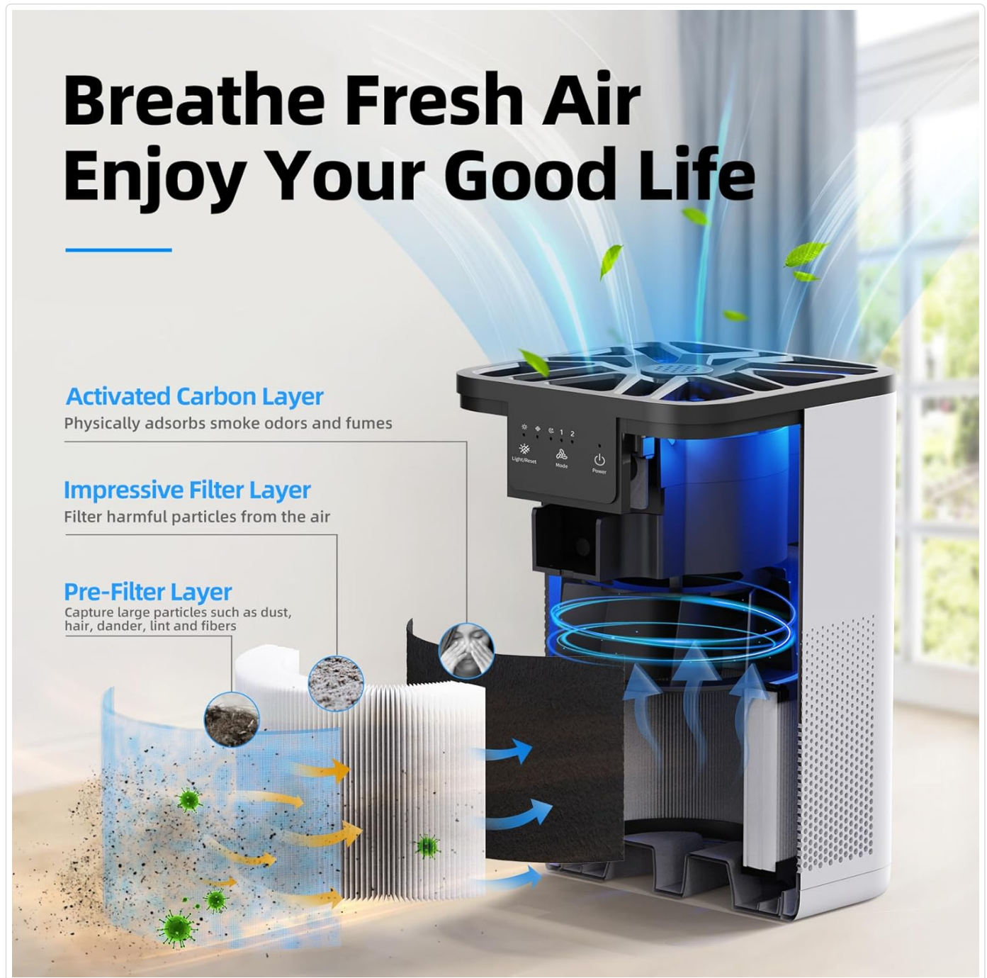
Image: An exploded view diagram illustrating the air purifier's internal components and the three-stage filtration process.

The AROEVE MK06 air purifier utilizes a multi-layer filtration system to effectively clean the air.