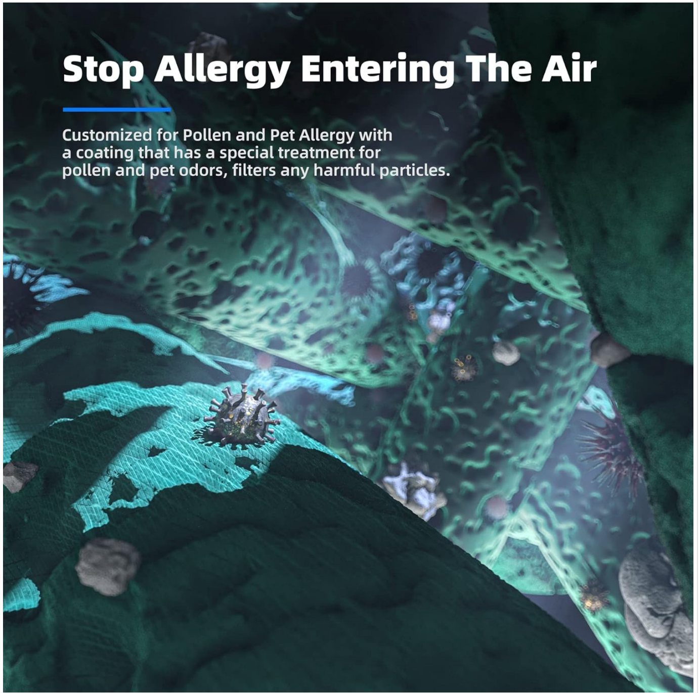
Image: An illustration depicting the filter's ability to capture microscopic allergy-causing particles like pollen.

Customized for Pollen and Pet Allergy with a coating that has a special treatment for pollen and pet odors, filters any harmful particles.