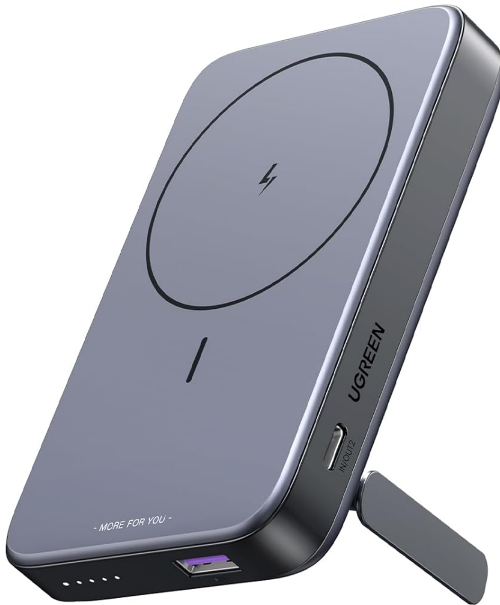
Figure 1: UGREEN 10,000mAh Magnetic Power Bank with its integrated foldable stand deployed. This image highlights the sleek design and the stand's functionality.