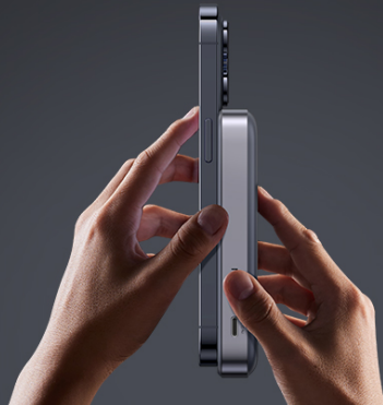
Figure 10: A side profile view of the power bank attached to a smartphone, illustrating its slim and compact design that does not obstruct the camera lens.

Snap easily and won't block the camera lens.