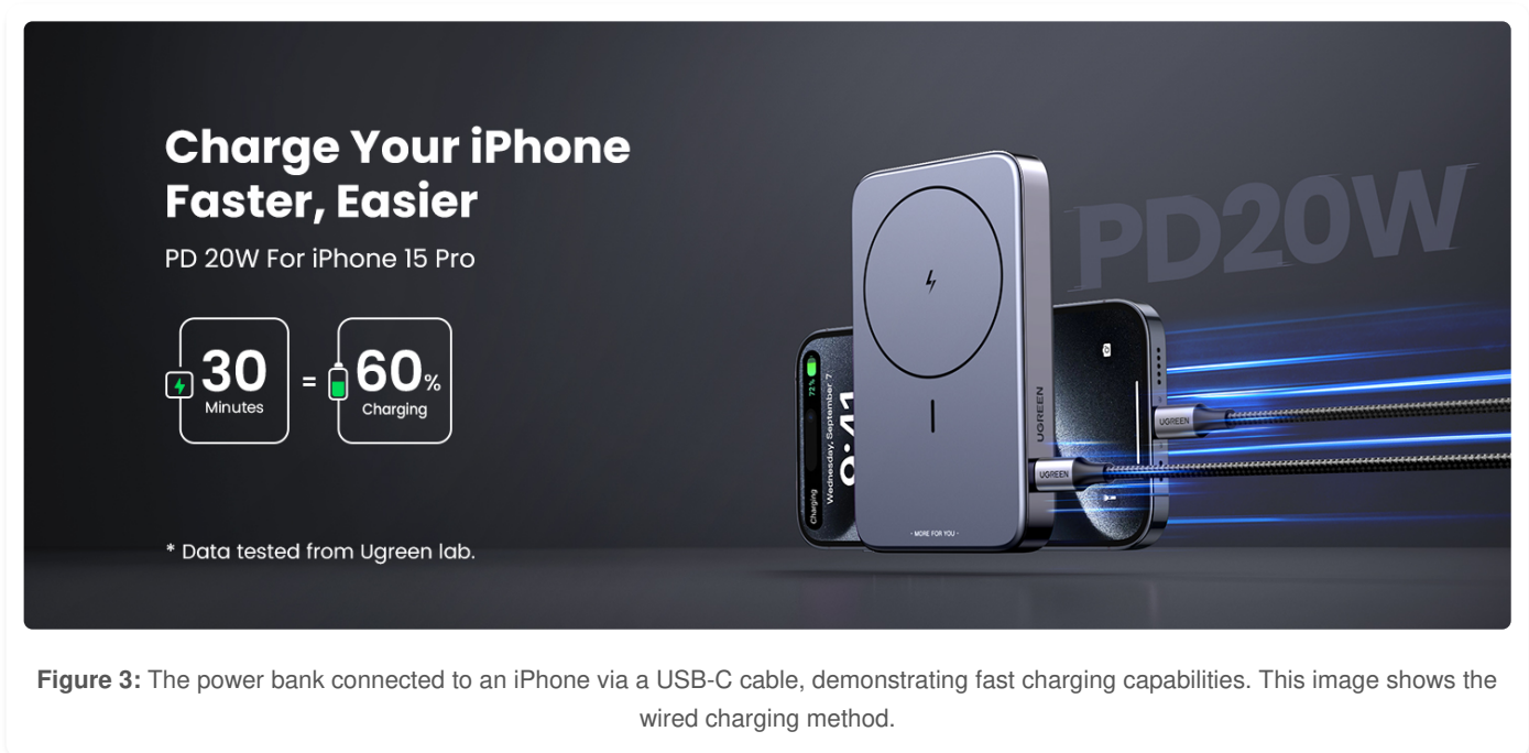
Figure 3: The power bank connected to an iPhone via a USB-C cable, demonstrating fast charging capabilities. This image shows the wired charging method.