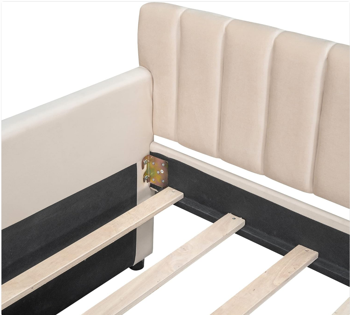
Image: Close-up view of the wooden slat support system and the metal bracket connecting the frame components.