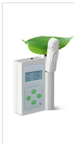
Figure 5.3: The device's sensor head clamping a leaf.