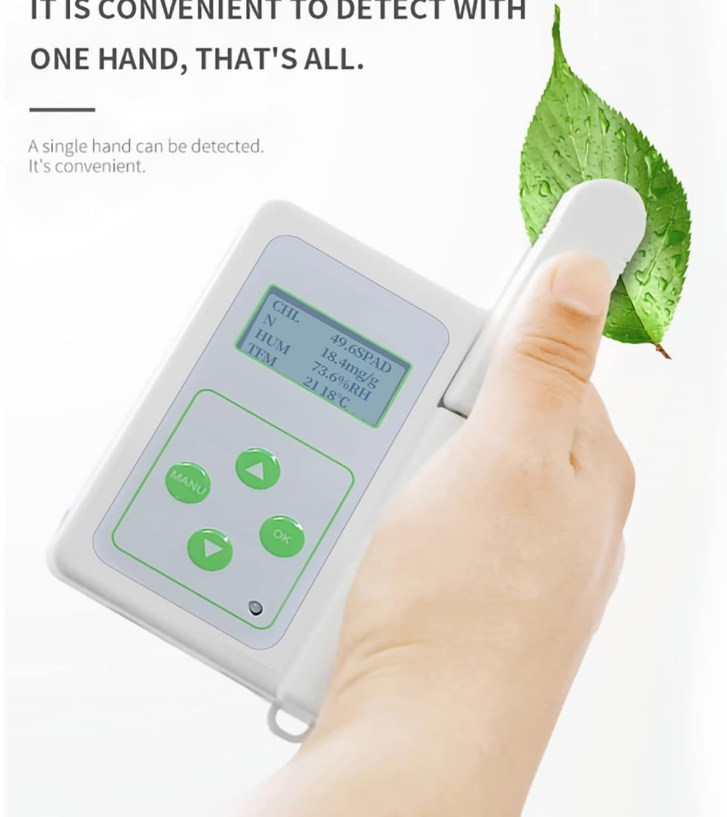
Figure 5.2: Convenient one-hand operation for detection.

A single hand can be detected. It's convenient.