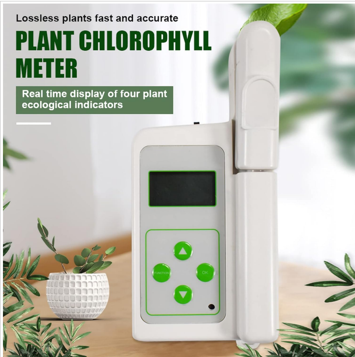
Figure 1.2: Real-time display of four plant ecological indicators.

Real time display of four plant ecological indicators