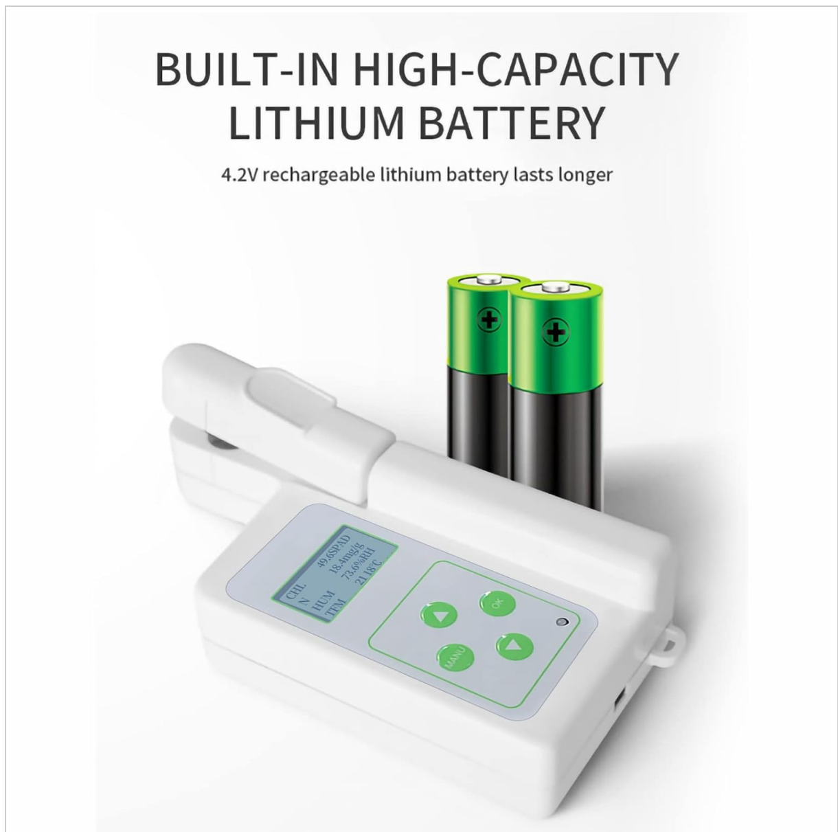
Figure 4.1: The device features a built-in high-capacity lithium battery.

The device is equipped with a built-in 4.2V rechargeable lithium battery. Before first use, fully charge the device. Connect the provided USB cable to the device's USB port and the other end to a suitable USB power source (e.g., computer USB port, wall adapter). The charging indicator will show the charging status.