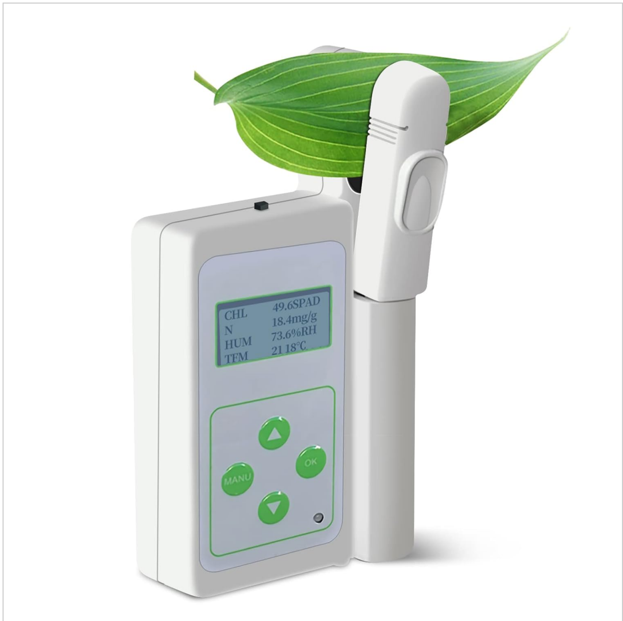
Figure 1.1: The GOYOJO GYJ-D Plant Nutrition Tester.