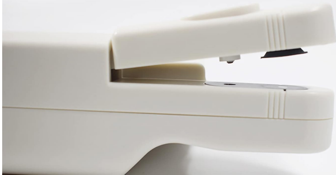
Figure 3.1: Direct reading of rapid detection results by clamping the blade surface.