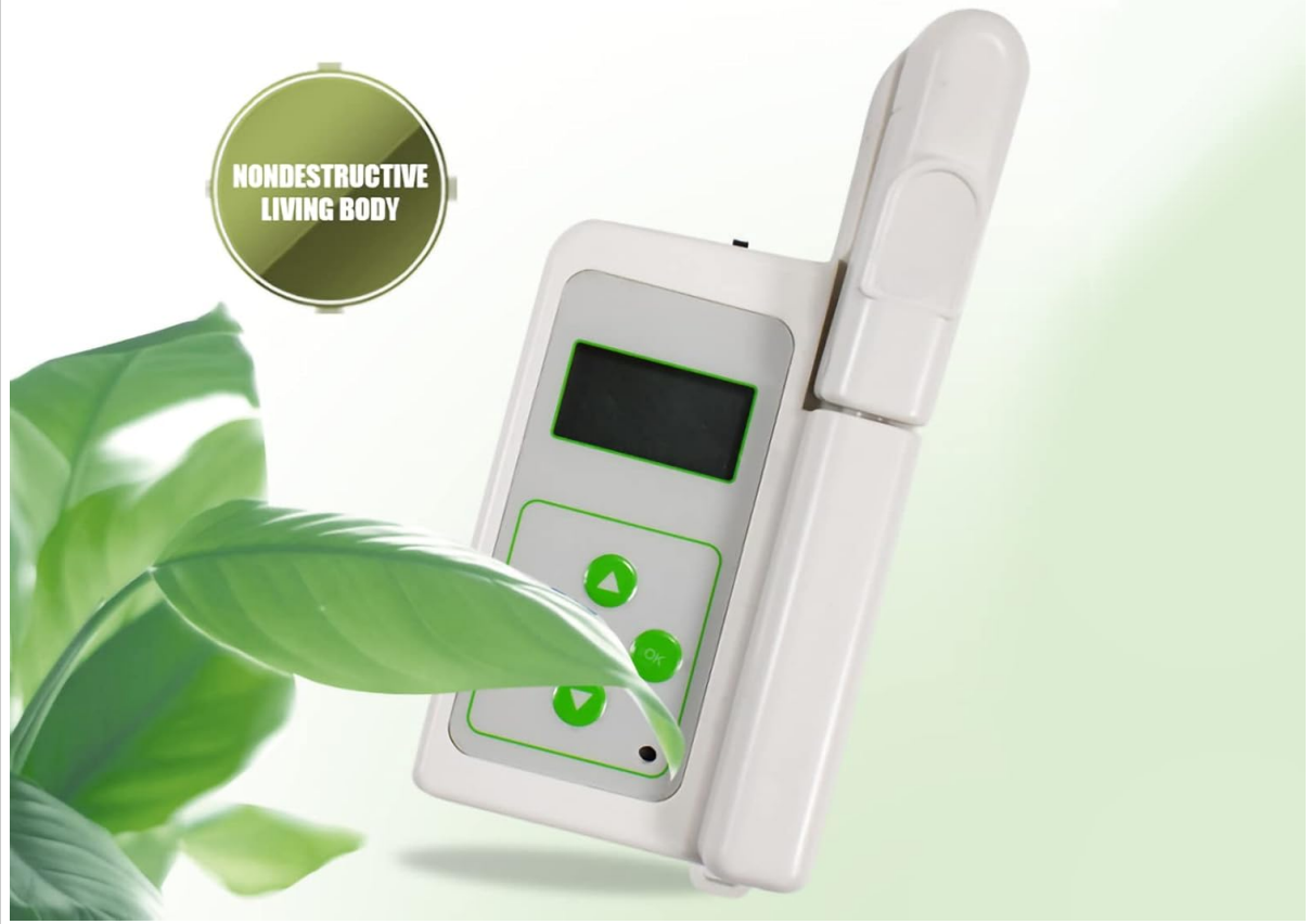
Figure 5.1: In vivo detection of non-invasive plants. A gentle clip will not damage the living plant.

A gentle clip will not damage the living plant and will not affect the growth of the plant