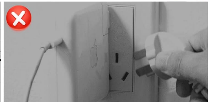
Figure 7: Vertical tower design with wide-spaced outlets to prevent plug blocking and ensure easy access.