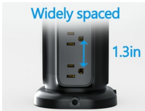
Figure 9: Side view highlighting the 1.3-inch wide spacing between AC outlets on the AiJoy Tower Surge Protector.

Video 1: Official product video demonstrating the AiJoy Flat Plug Power Strip Tower with surge protection features.