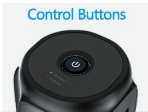
Figure 8: Top view of the AiJoy Tower Surge Protector showing the power control button.