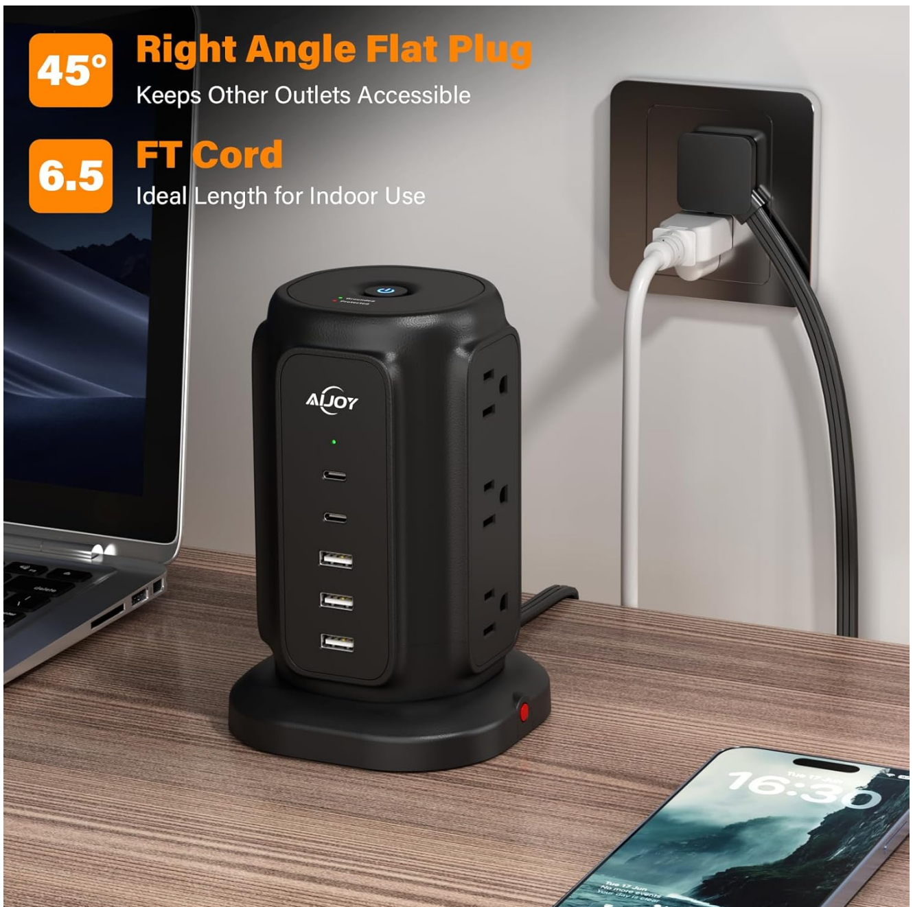
Figure 4: AiJoy Tower Surge Protector with a 45-degree flat plug and 6.5-foot cord, designed for tight spaces.