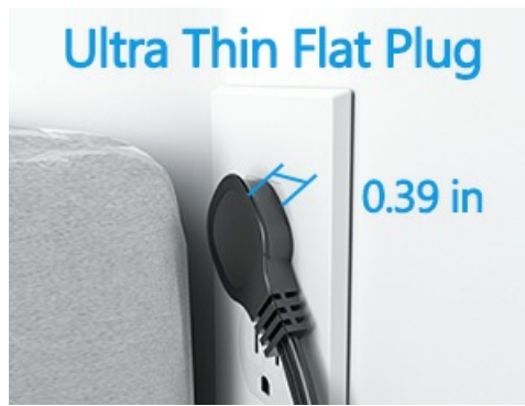
Figure 5: Close-up of the ultra-thin 0.39-inch flat plug of the AiJoy Tower Surge Protector.