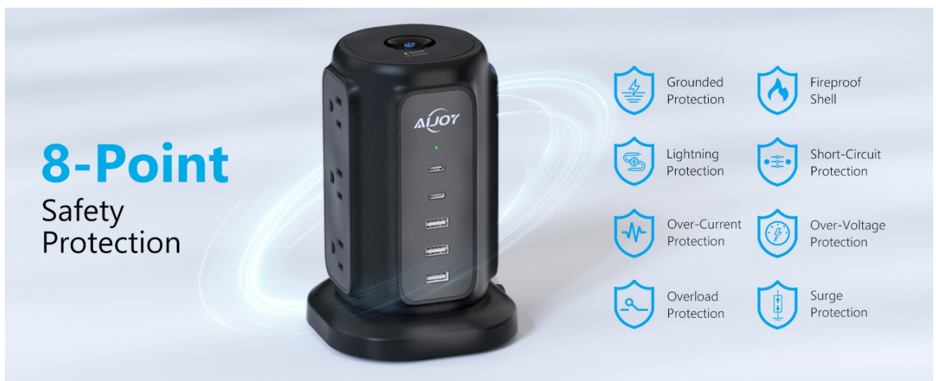
Figure 3: Infographic detailing the 8-point safety system: Grounded Protection, Lightning Protection, Over-Current Protection, Overload Protection, Fireproof Shell, Short-Circuit Protection, Over-Voltage Protection, Surge Protection.