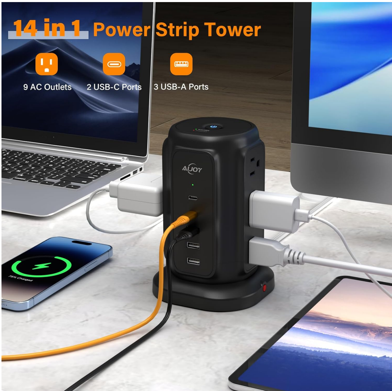
Figure 1: AiJoy Tower Surge Protector with 9 AC outlets and 5 USB ports, charging multiple devices.