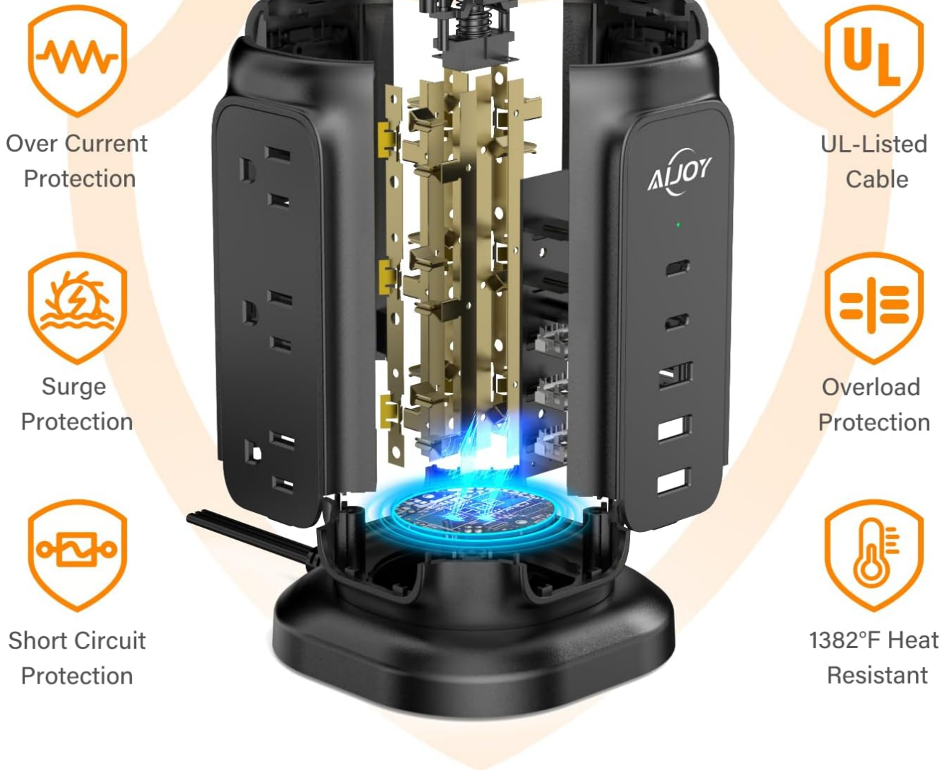
Figure 2: Diagram illustrating multiple safety protections including over current, surge, overload, short circuit, and heat resistance.