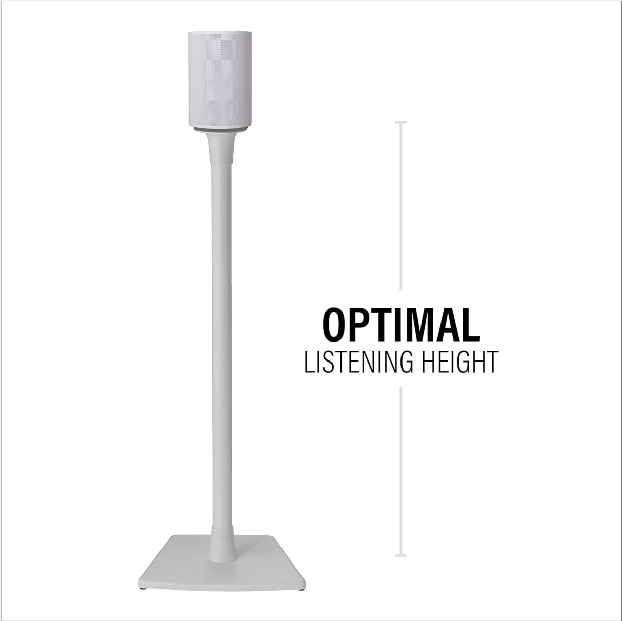
Image: The speaker stand with a Sonos Era 100 speaker, illustrating its optimal listening height.