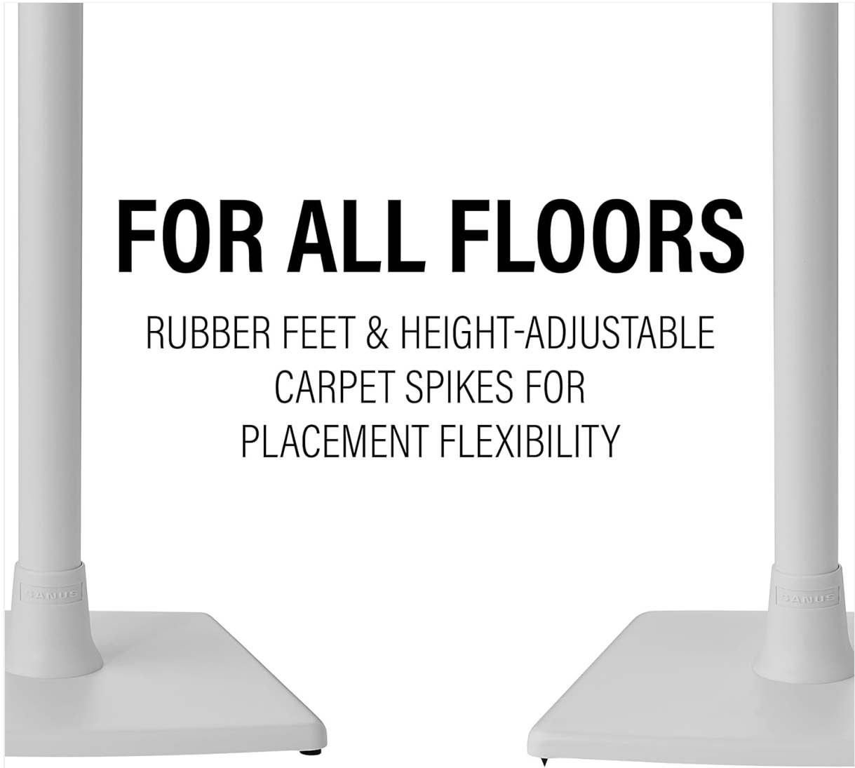
Image: Detail of the stand bases, highlighting the inclusion of both rubber feet and height-adjustable carpet spikes for various floor types.

RUBBER FEET & HEIGHT-ADJUSTABLE CARPET SPIKES FOR PLACEMENT FLEXIBILITY