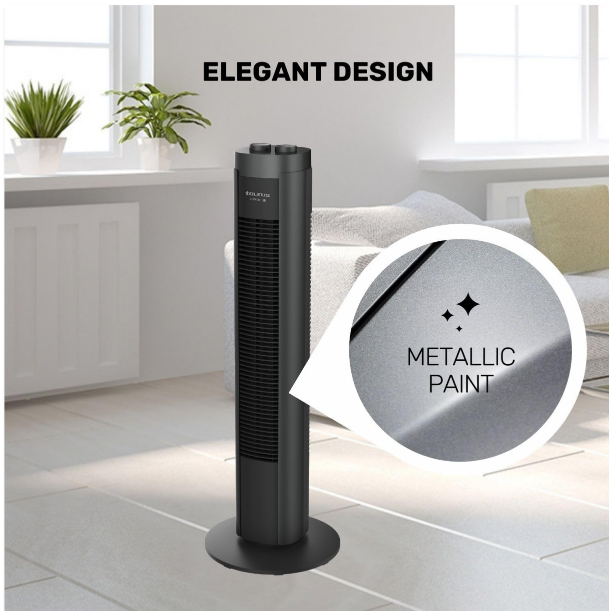
Image: The fan features an elegant design with a metallic paint finish, suitable for various home decors.