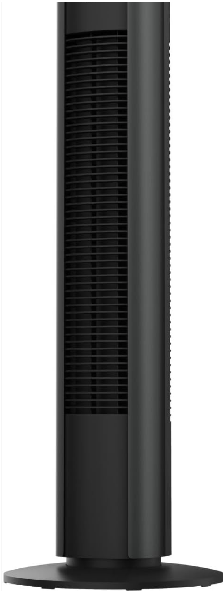
Image: Front view of the Taurus New Babel Tower Fan, showcasing its sleek, grey design.