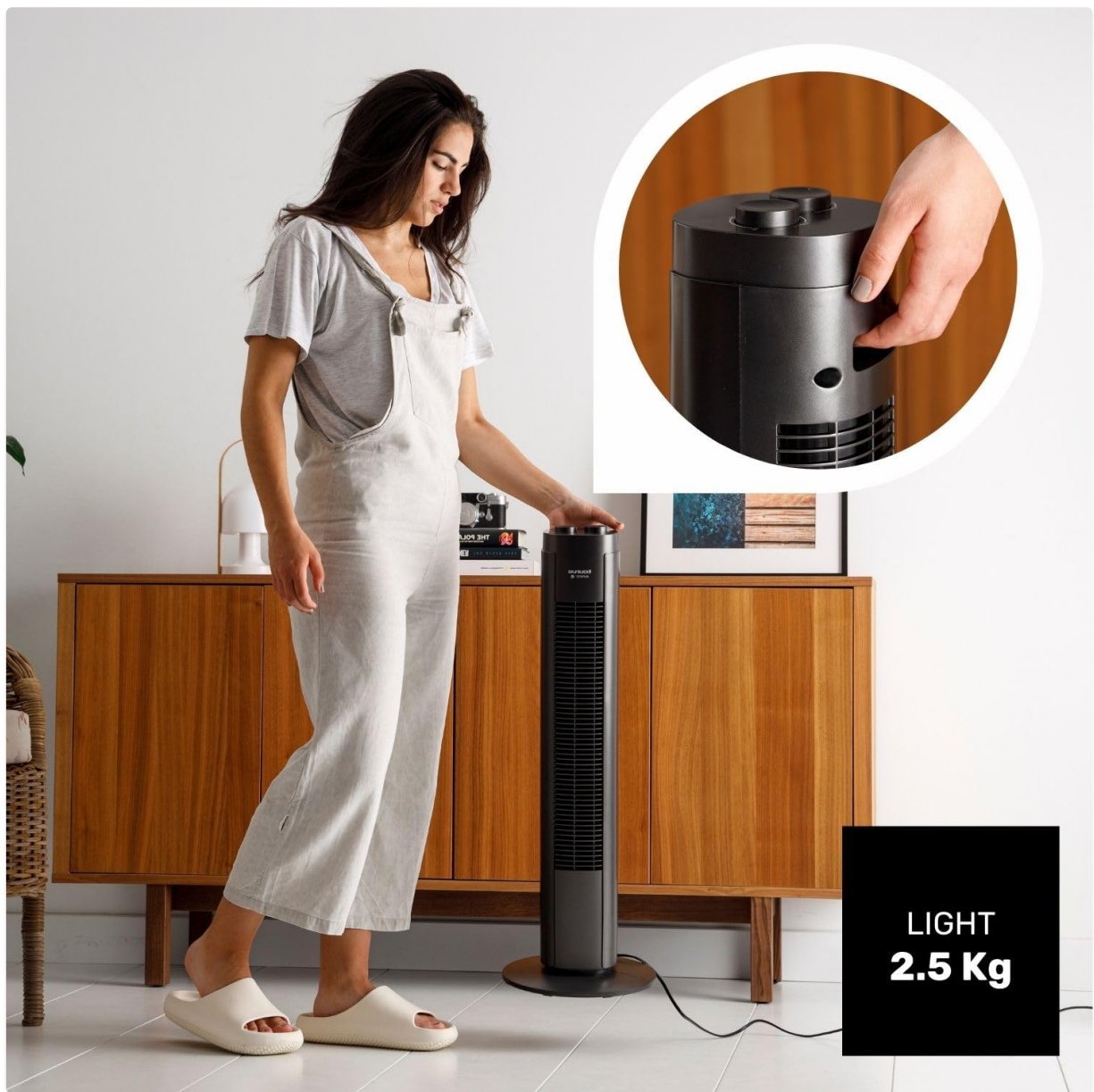
Image: The fan's compact dimensions (76 cm height, 26 cm base diameter) make it suitable for placement in various room settings, such as next to a desk.