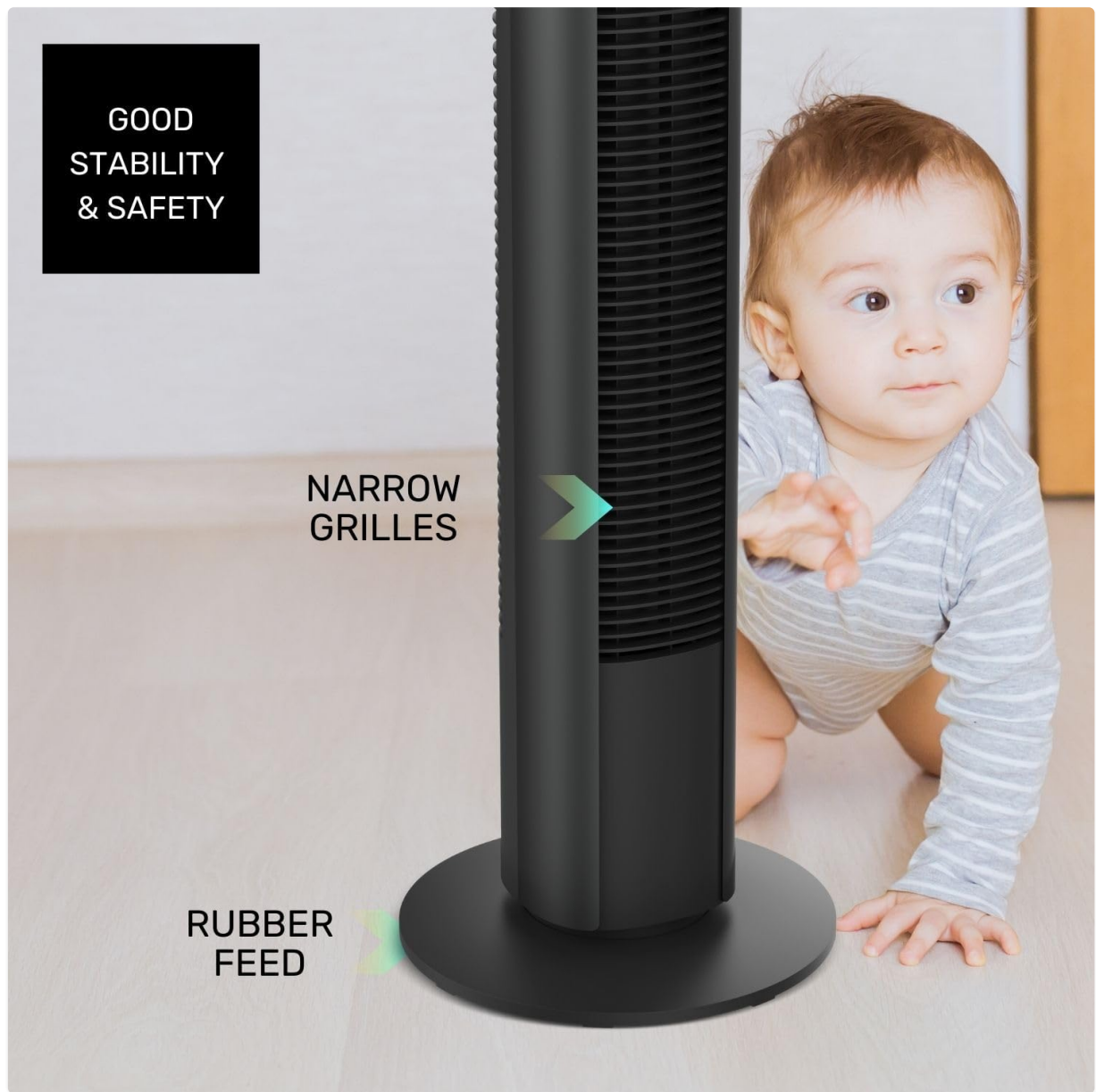
Image: The fan features narrow grilles and rubber feet for enhanced stability and safety, particularly around children.