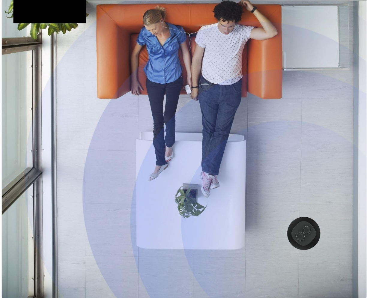
Image: The top-mounted control panel features two rotary selectors for adjusting the timer and fan speed.