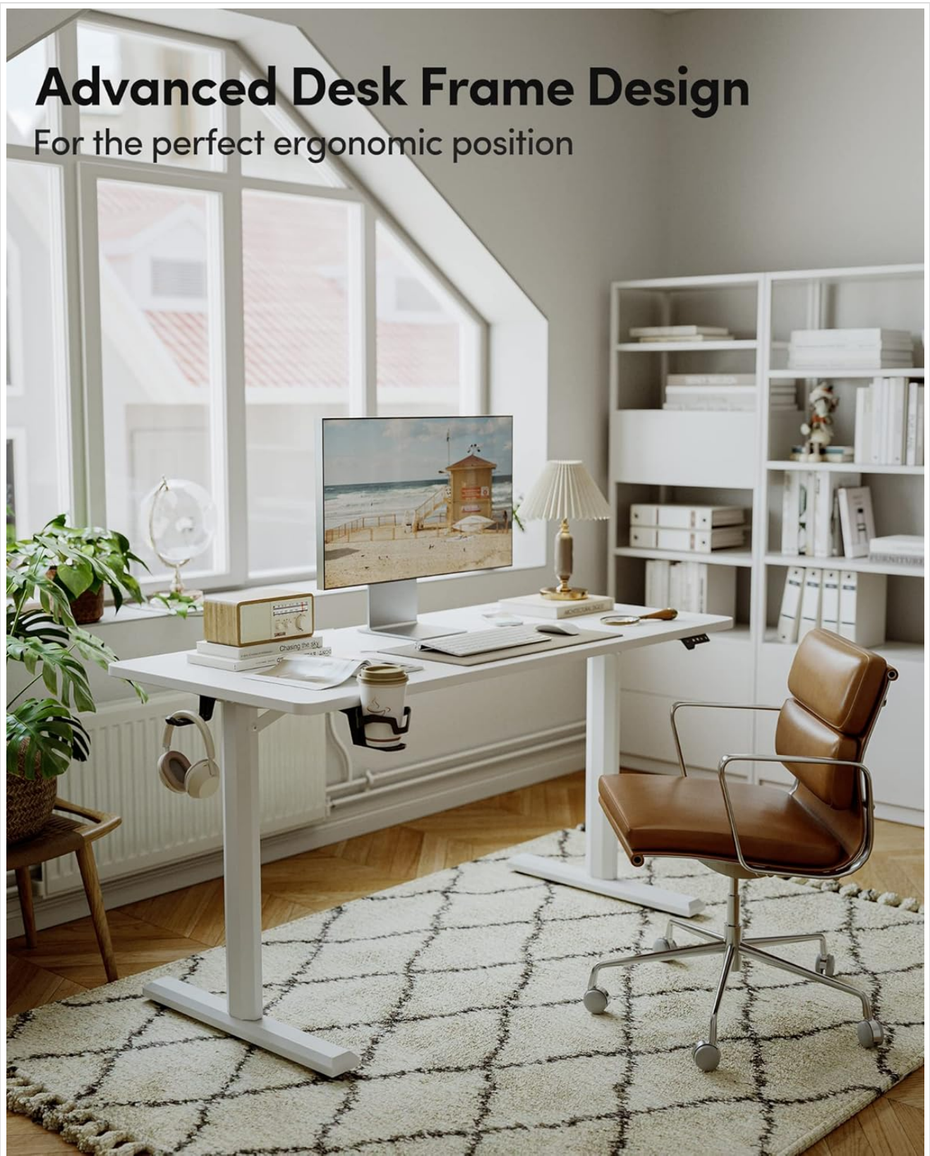
Figure 5: Desk Accessories.

The desk includes practical accessories like a cup holder and a storage hook for enhanced usability.