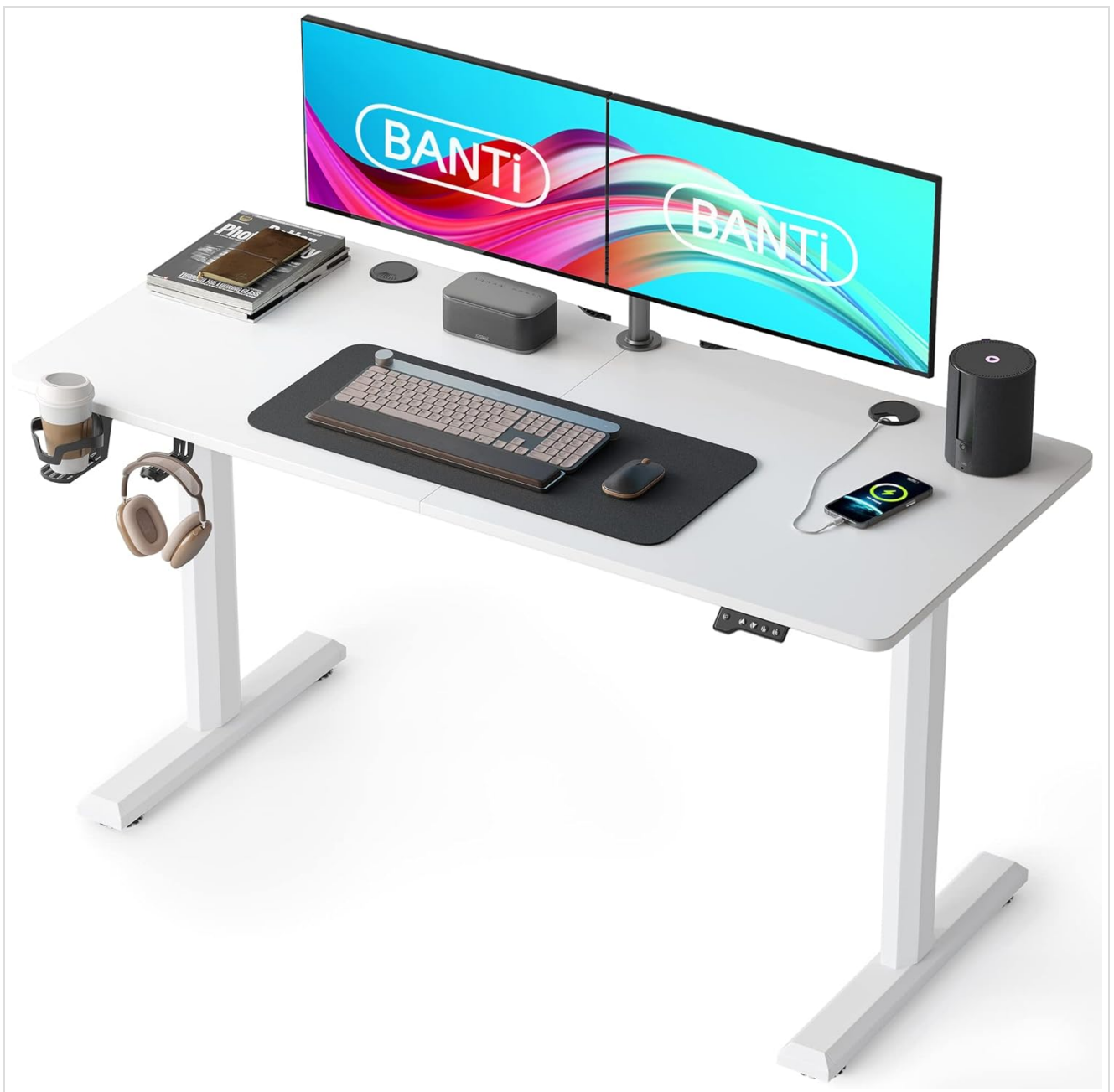
Figure 1: Fully assembled BANTI Electric Standing Desk with accessories.

This image shows the BANTI Electric Standing Desk in a typical office setup, highlighting its spacious desktop and integrated accessories like the cup holder and headphone hook.