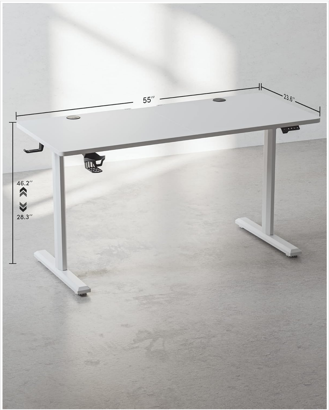
Figure 3: Adjustable Height Range.

The desk offers a height range from 28.3 inches to 46.2 inches, accommodating various user preferences.