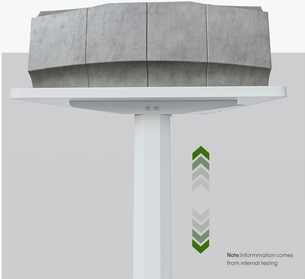
Figure 6: Reliability and Durability.

The desk is tested for durability, with a lifting capacity of 132 lbs and tested over 50,000 times for reliable performance.